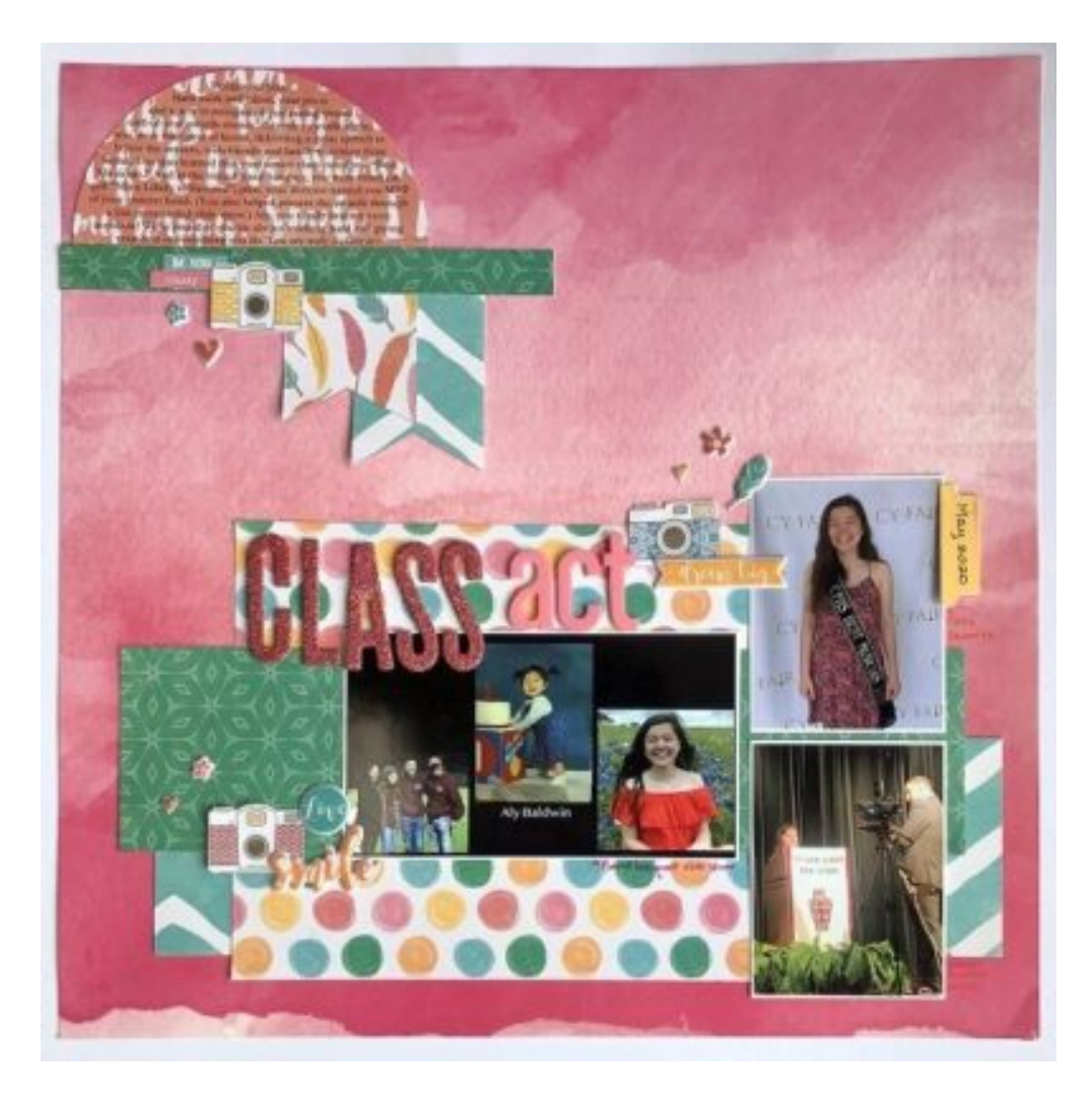
Page by Cynthia