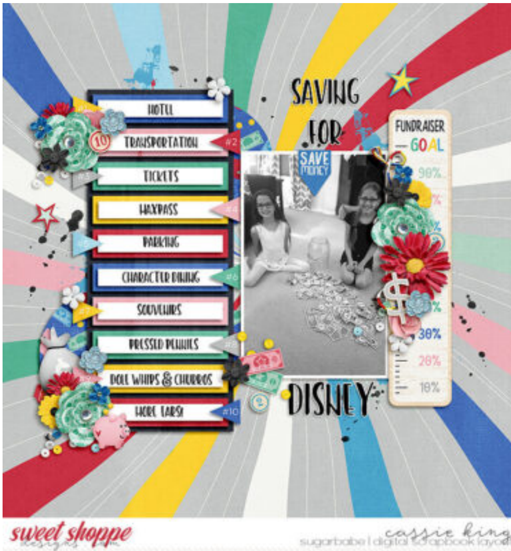
Layout by Cassie