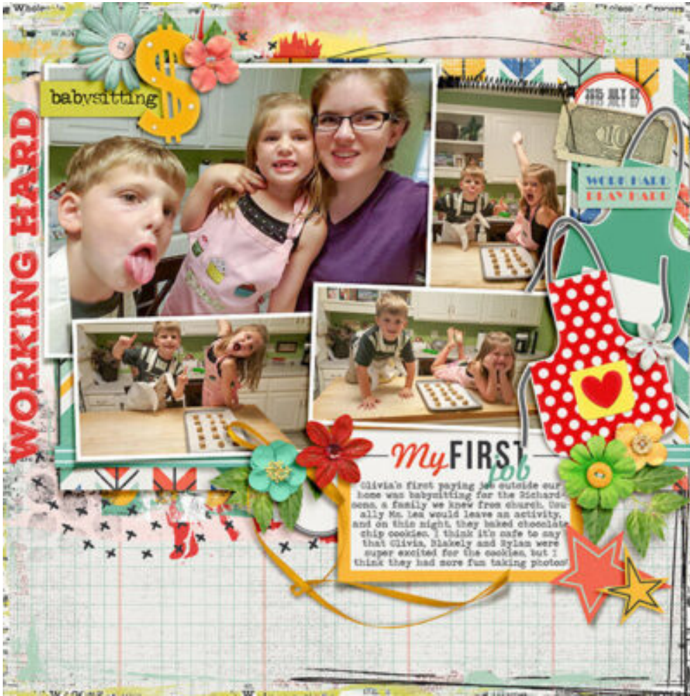
Layout by Cheryl