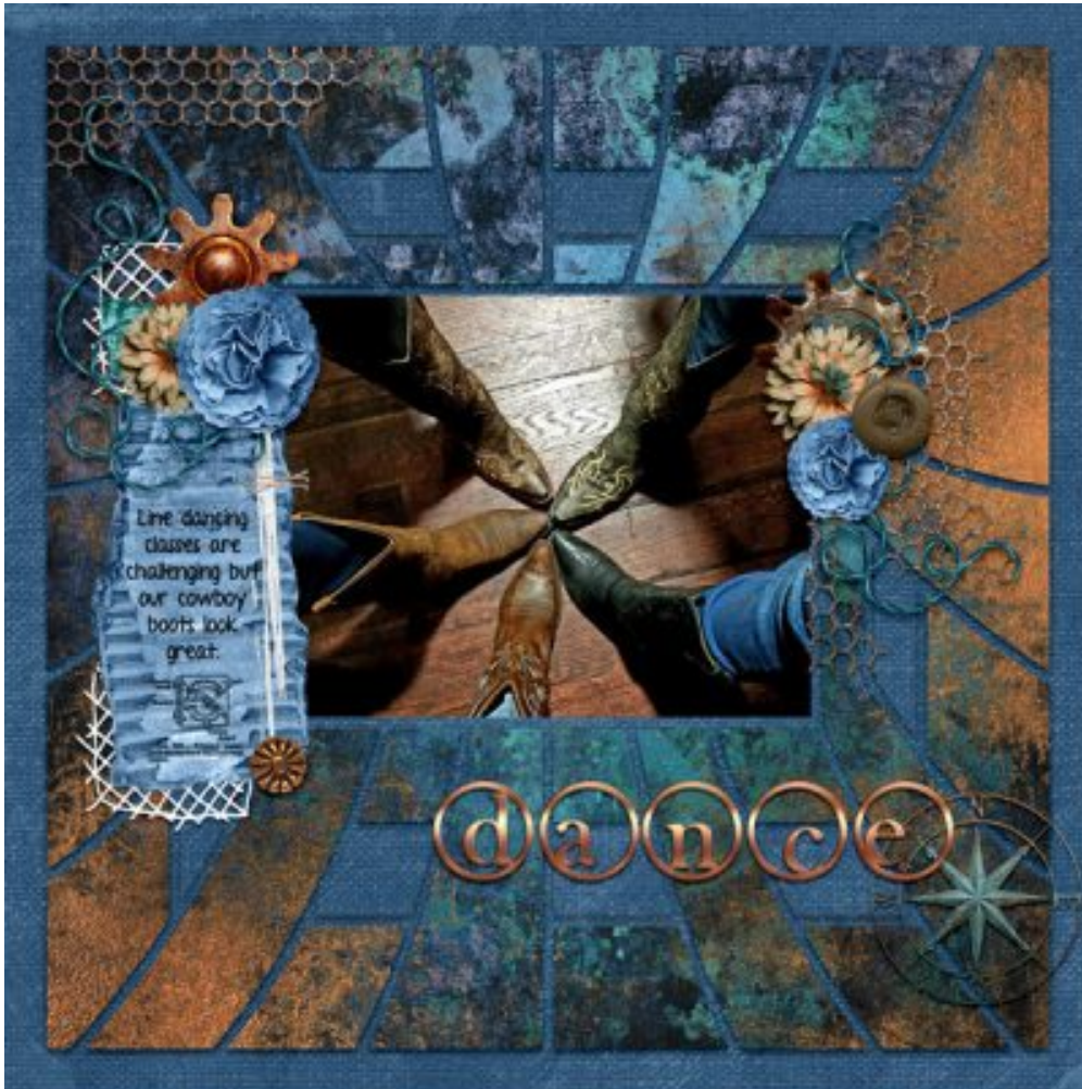
Layout by Hawkgirl