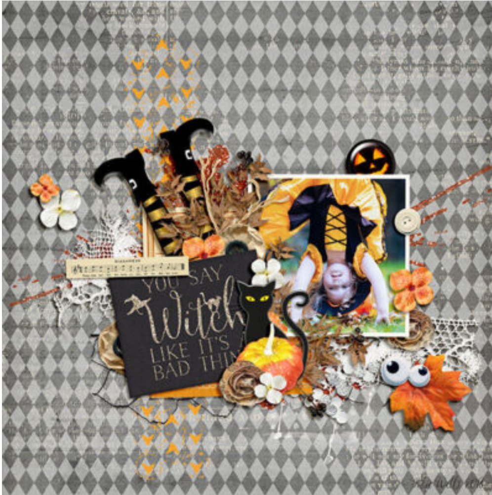
Layout by Julie