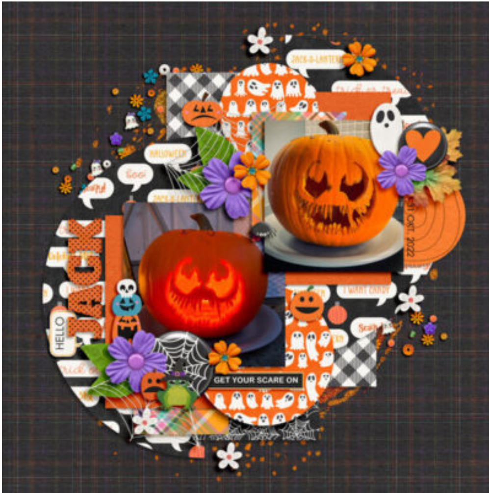
Layout by Carina