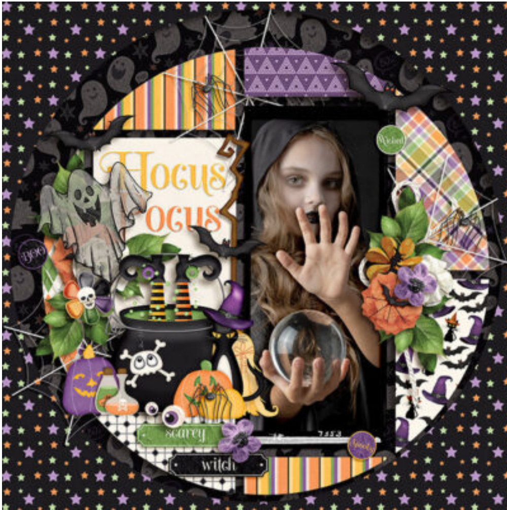
Layout by Julie