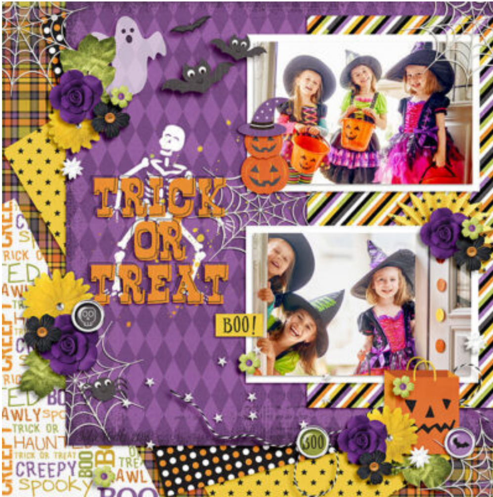
Layout by Julie