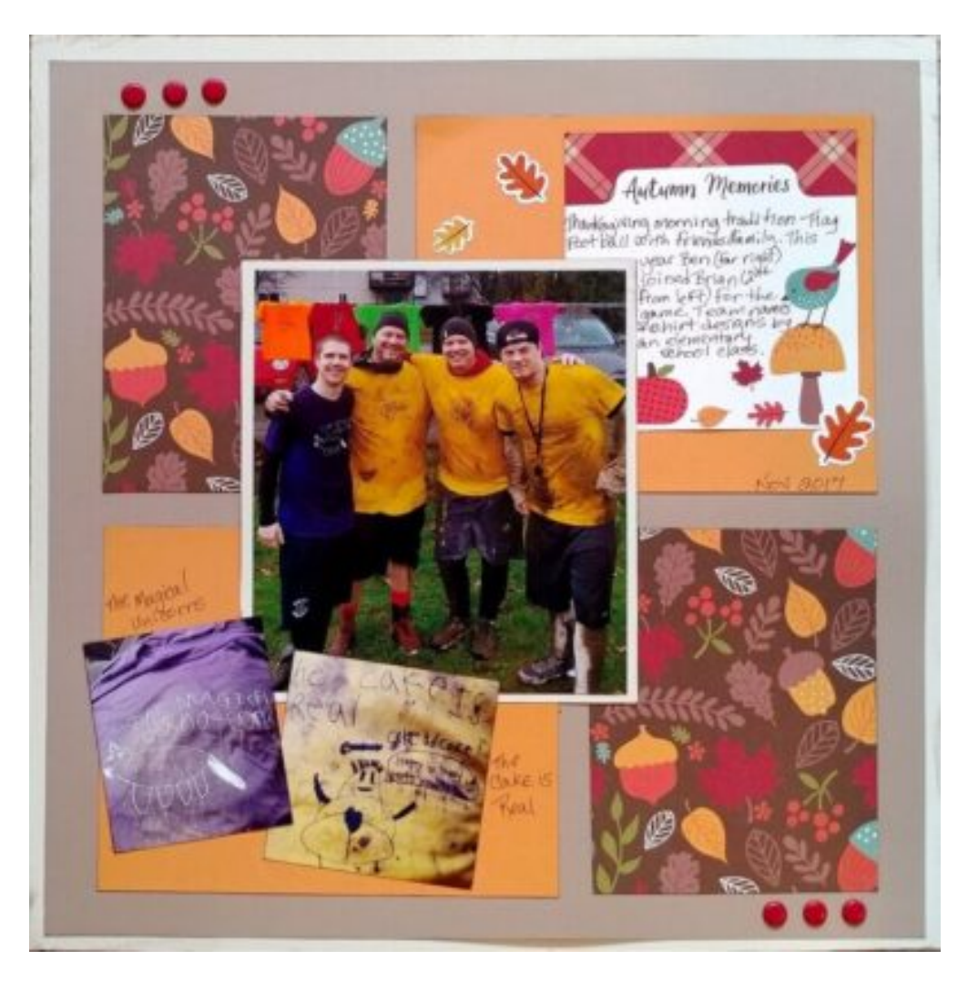
Layout by Susan