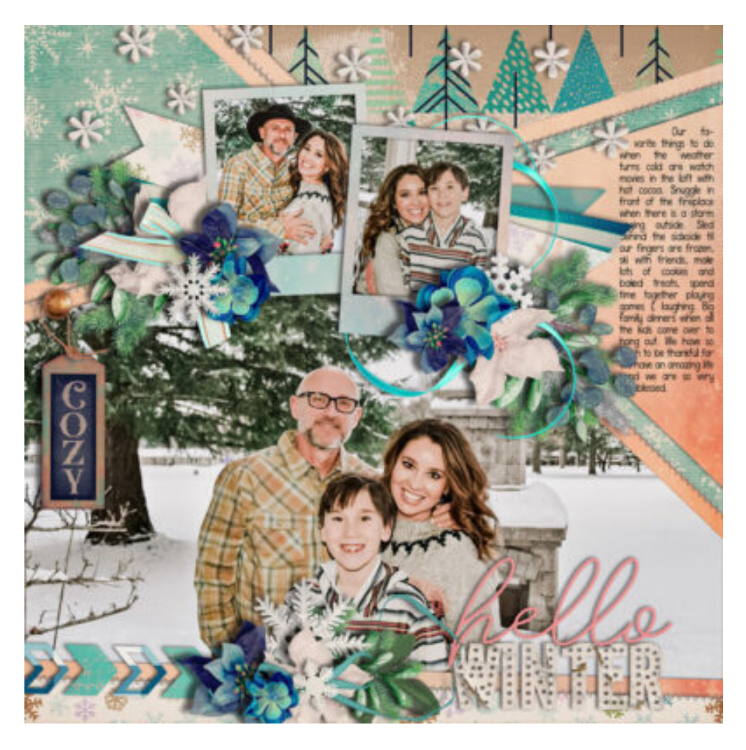
Layout by Charity