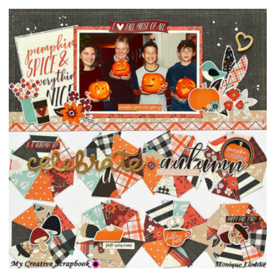
Layout by Monique