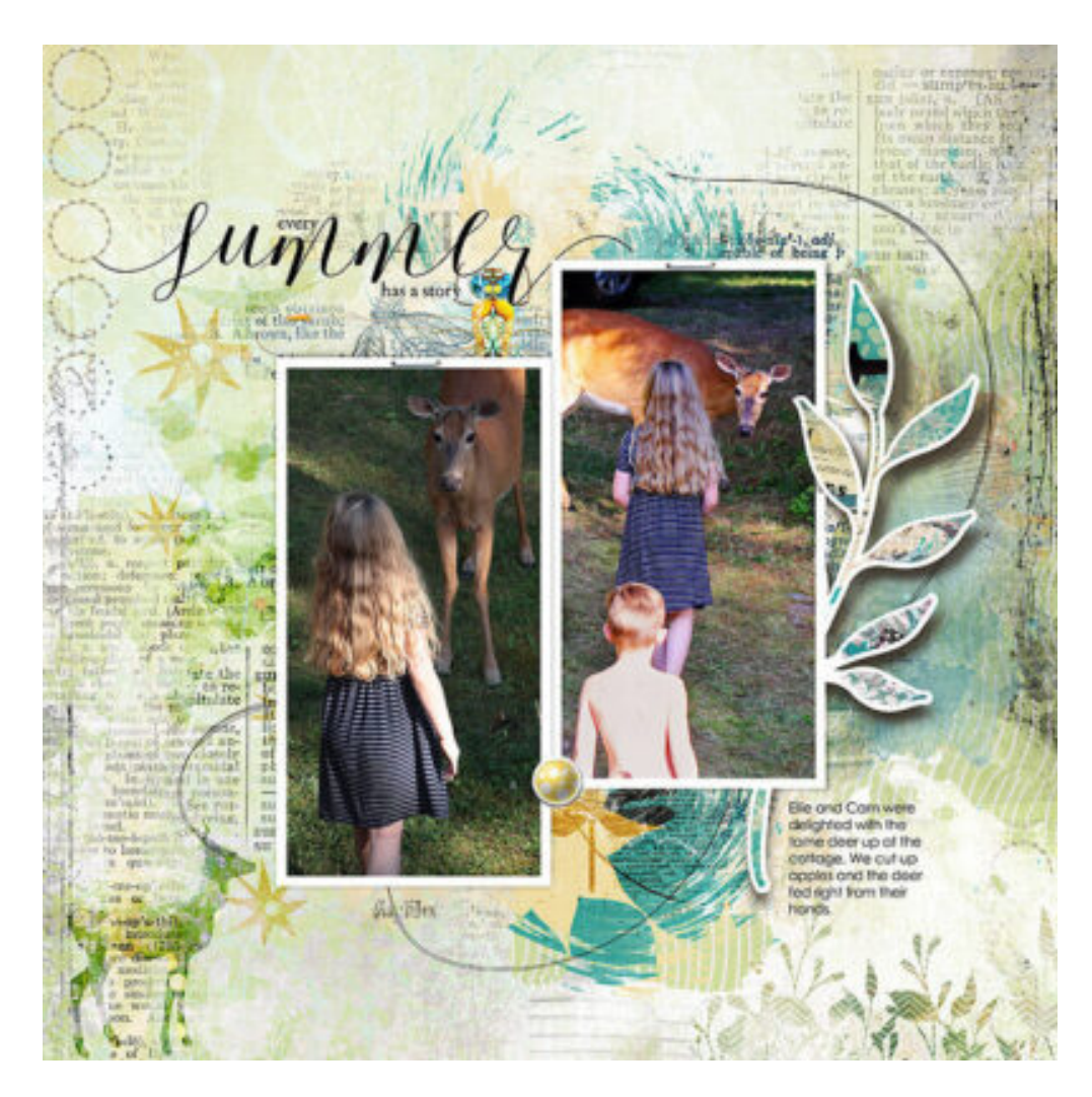
Layout by Janedee