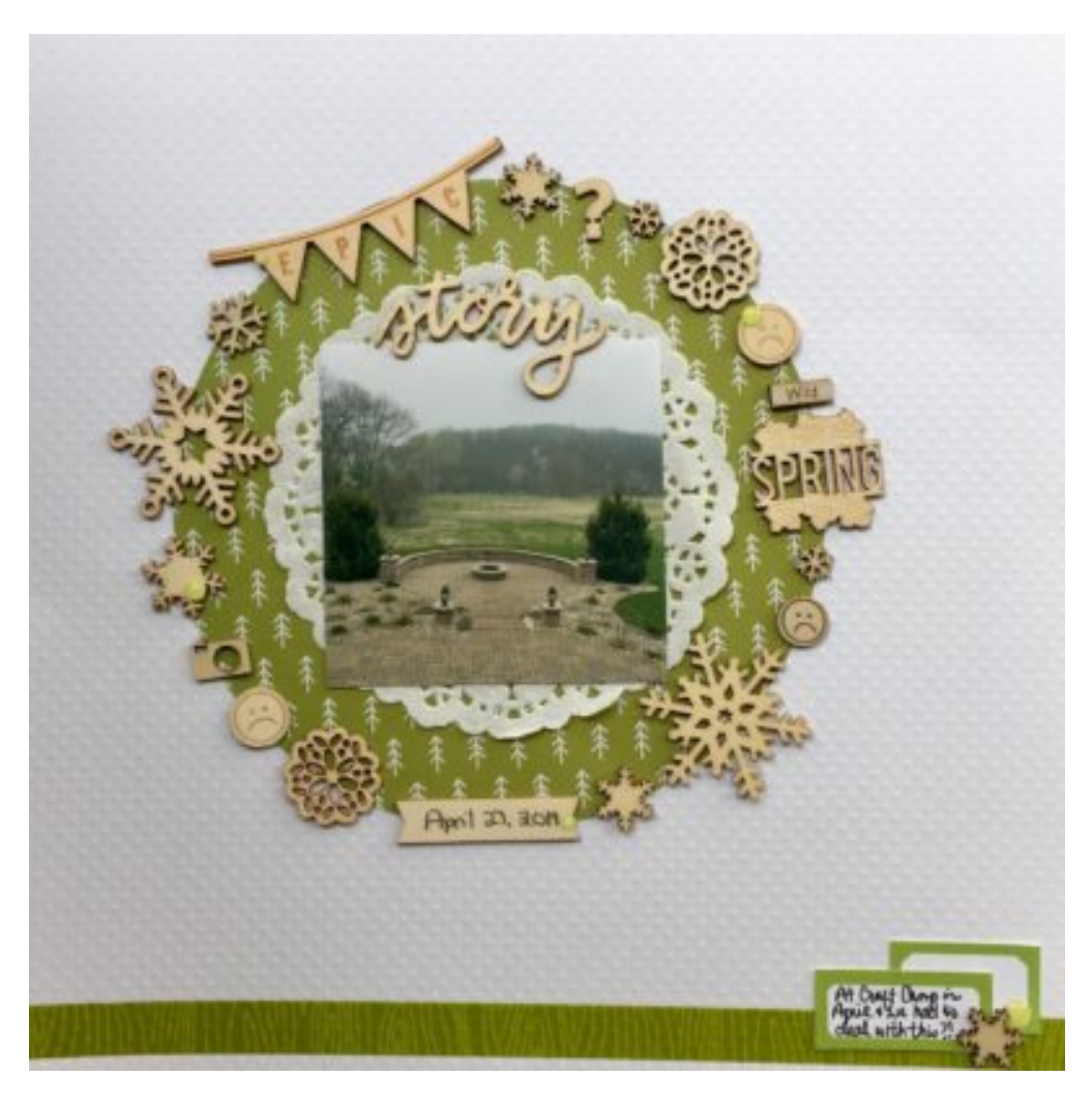
Layout by Kelly