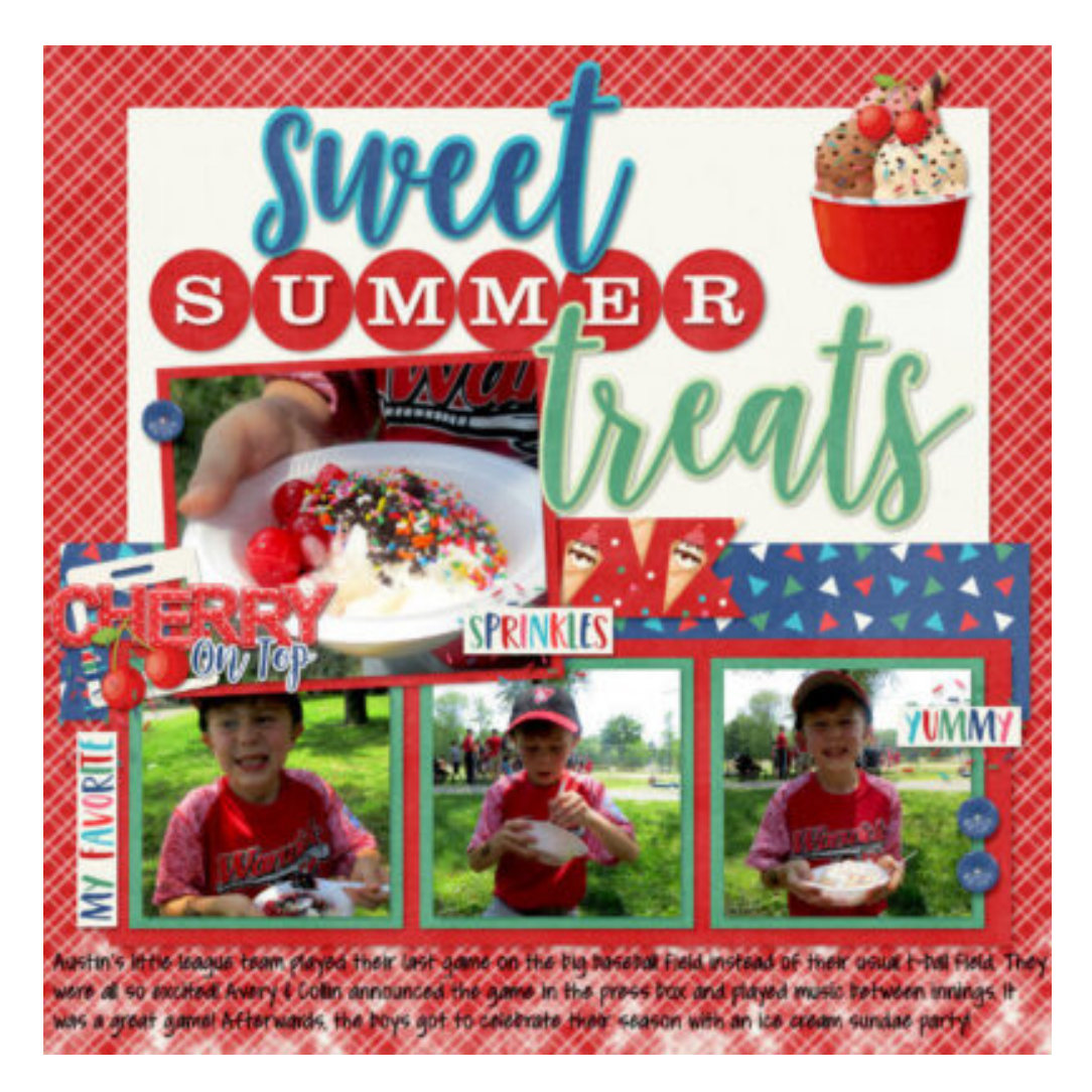
Page by 3blueeyedbabies