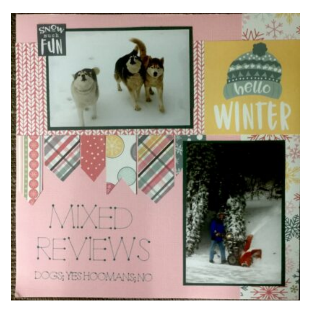
Layout by Snappyscrapper