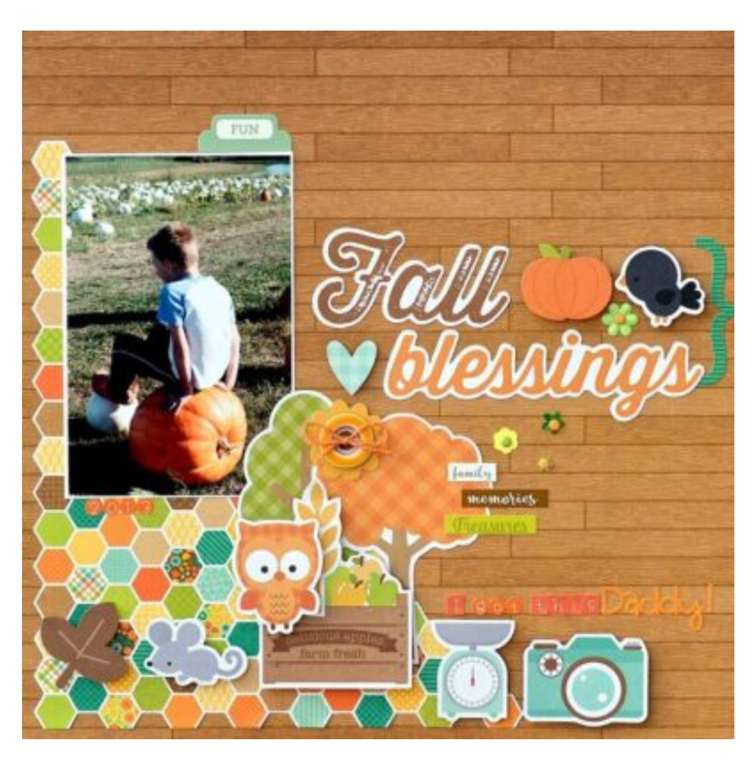
Page by Vivian