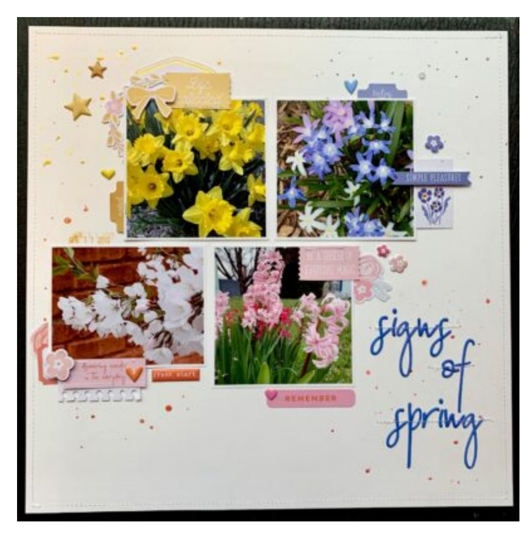
Page by Tina