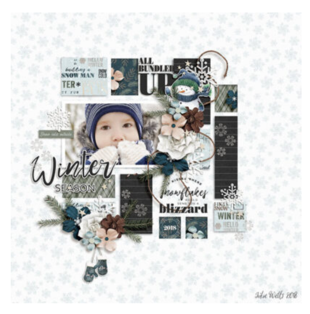
Layout by Julie