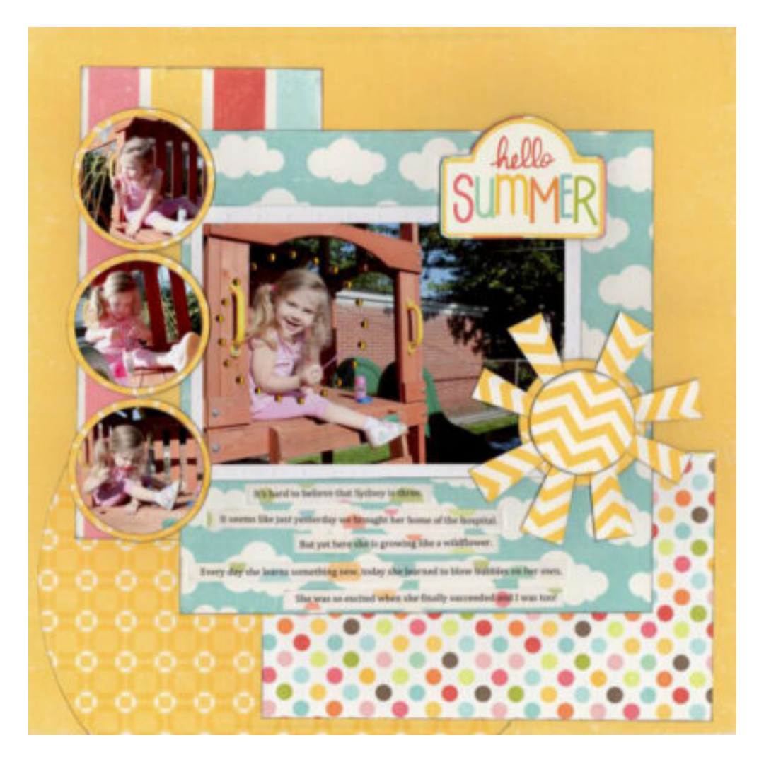
Layout by Lanette