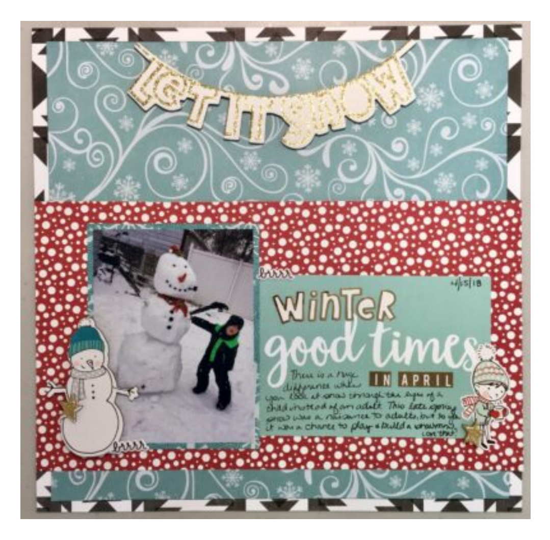
Page by Kelly