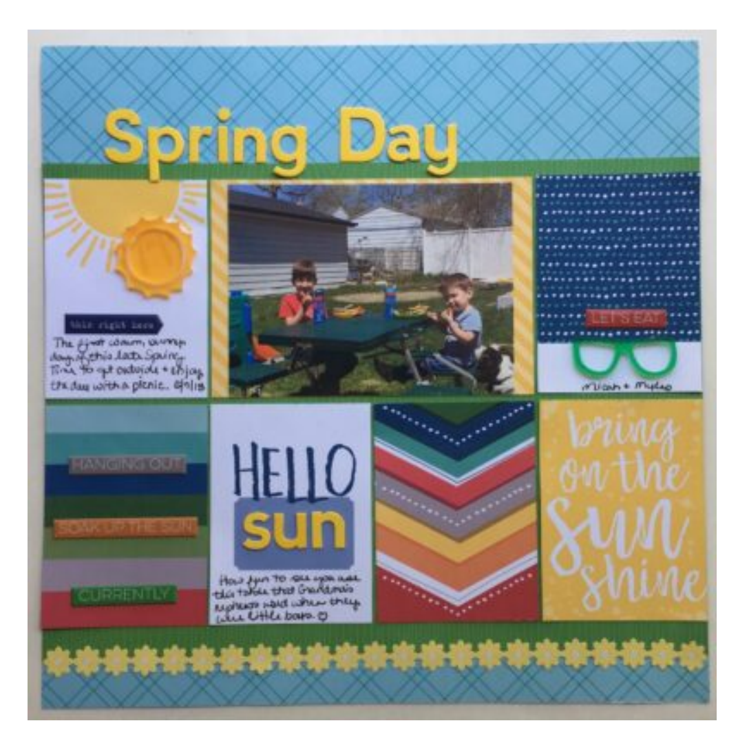
Layout by Kelly