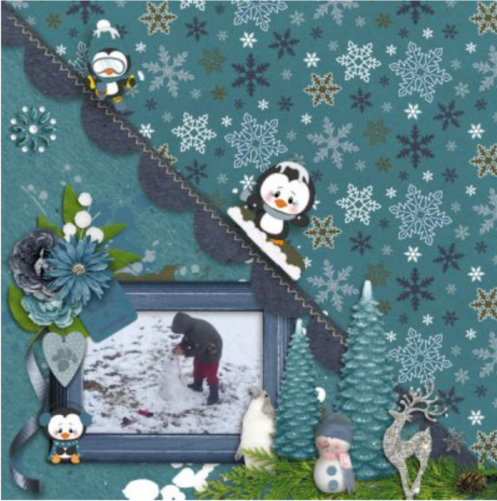
Layout by Joanne