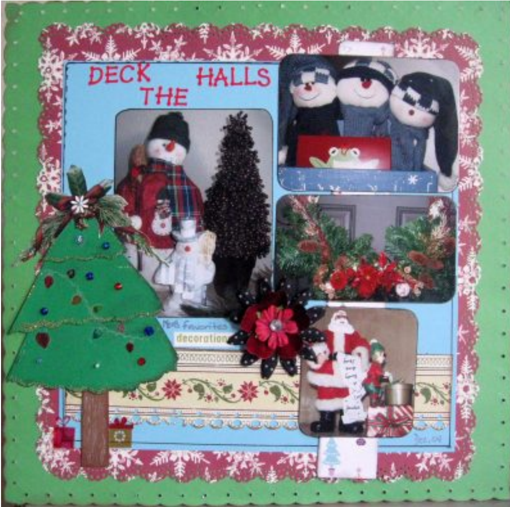
Layout by Rice8994