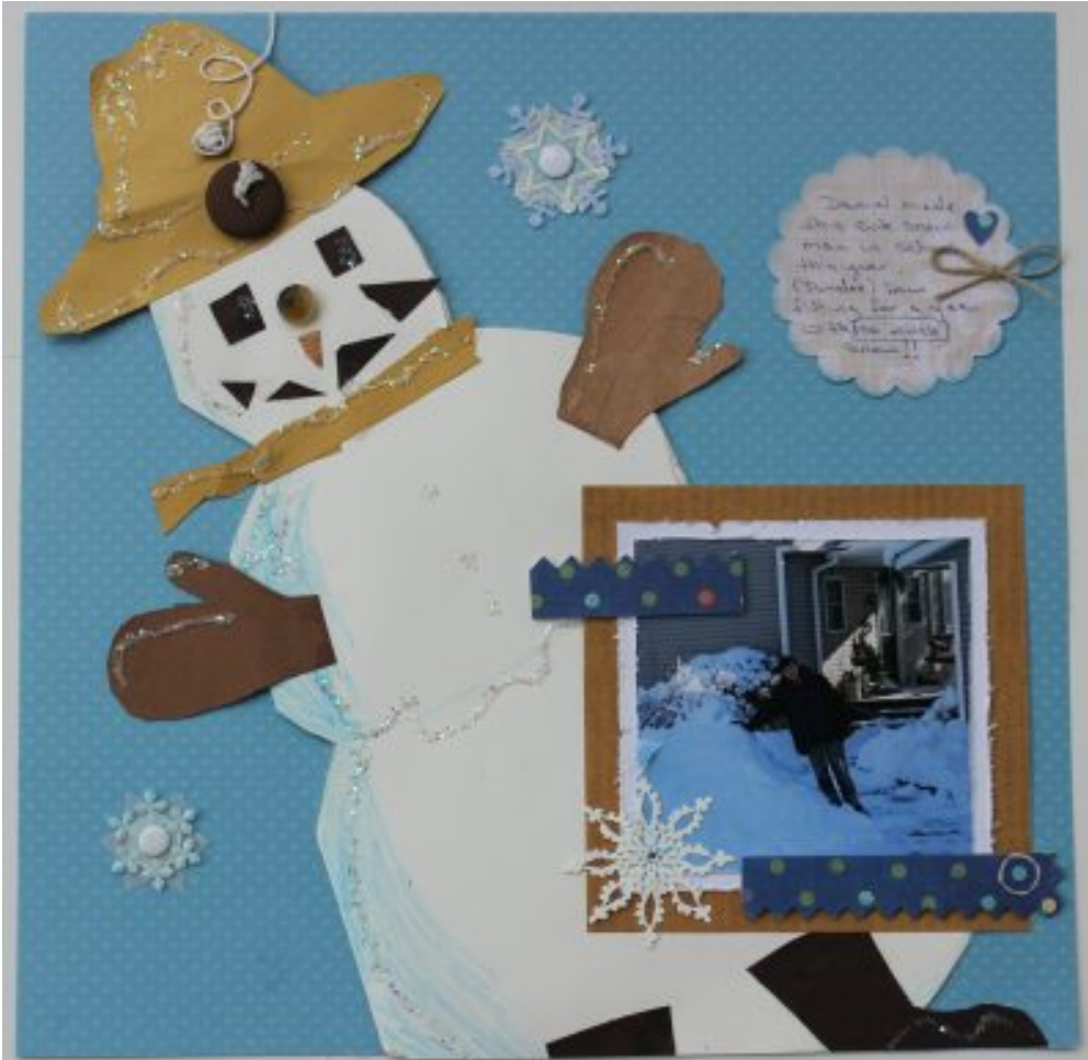
Layout by Christy