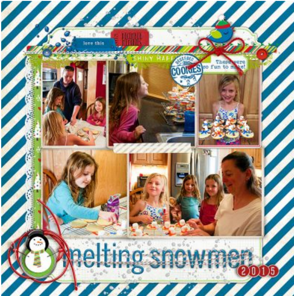
Layout by Liz