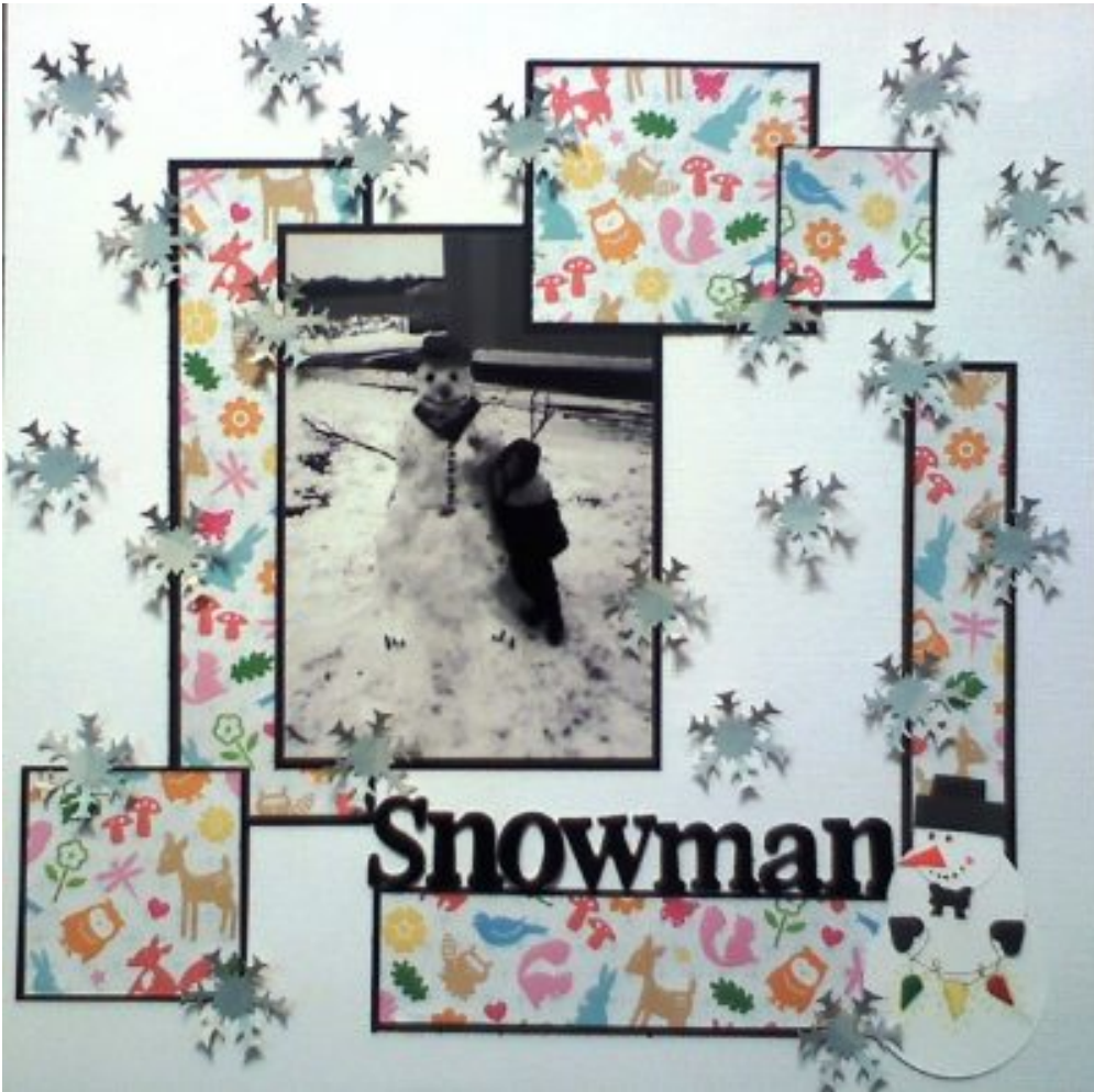
Layout by AuntyT