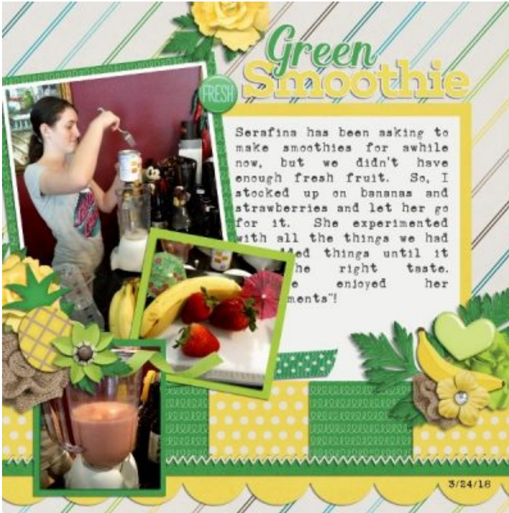
Layout by Meagan43