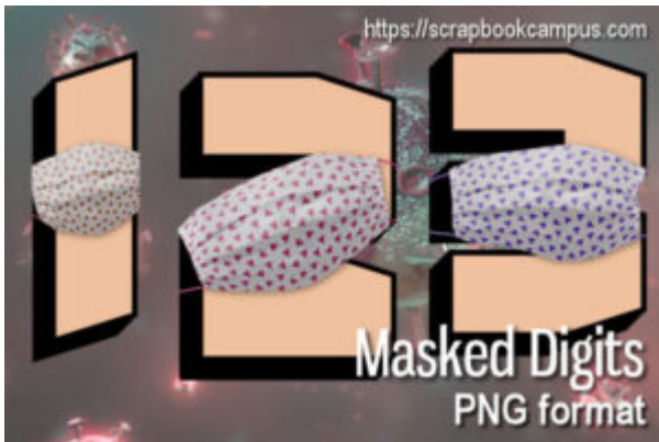
Layout by Linda

Since masks have become the new daily accessory, why