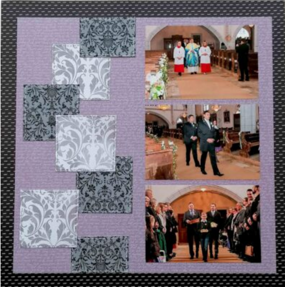
Layout by Susanne