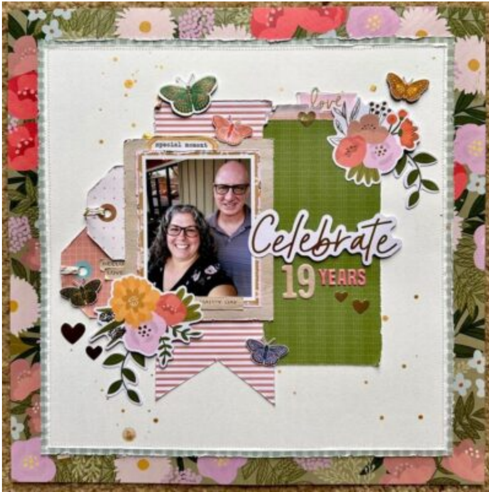
Layout by Tina