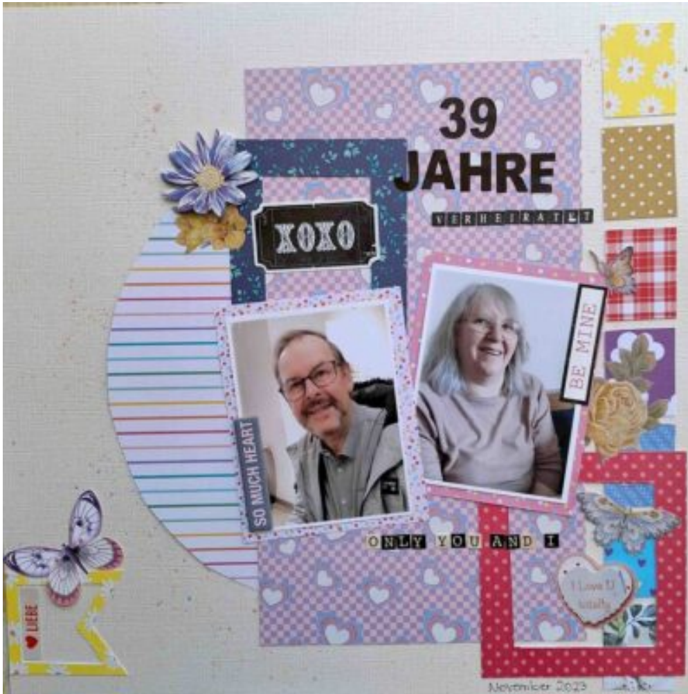
Layout by Susi