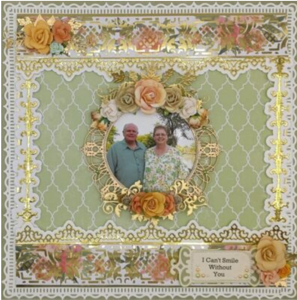
Layout by Kelly