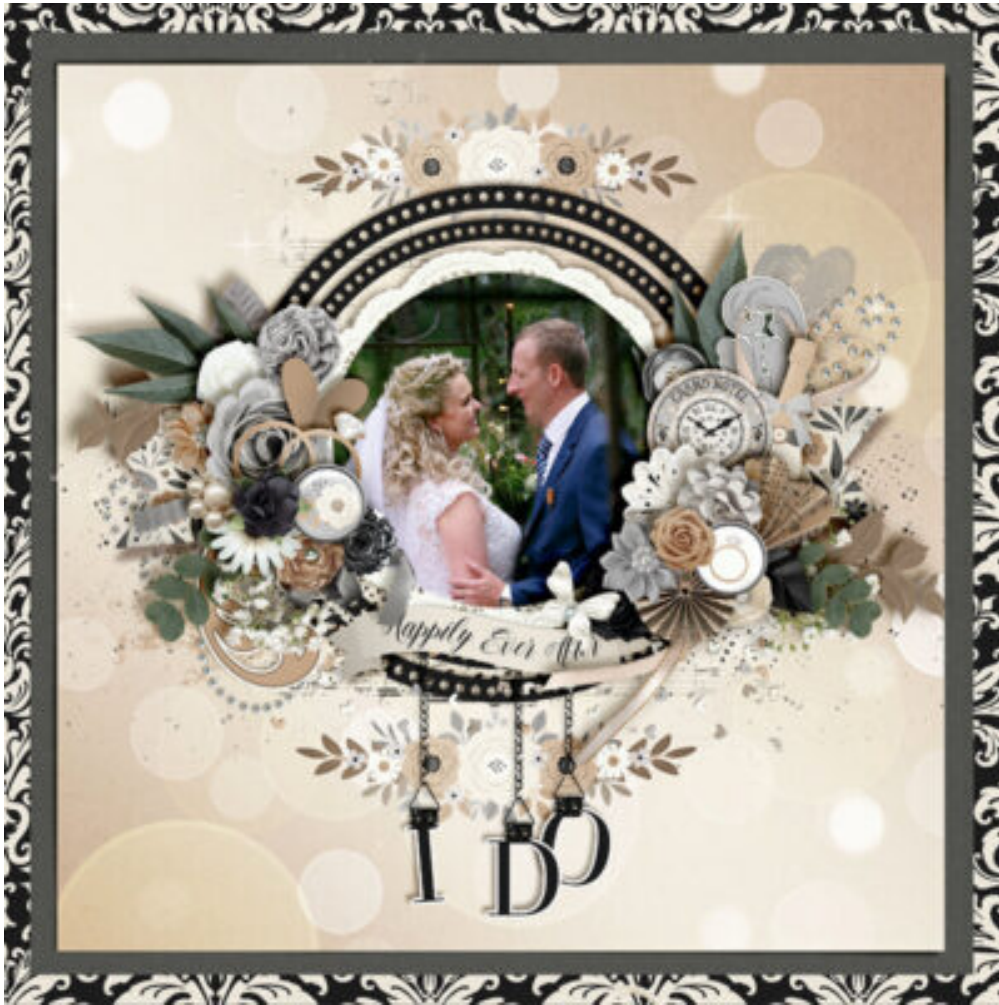
Layout by Christelle