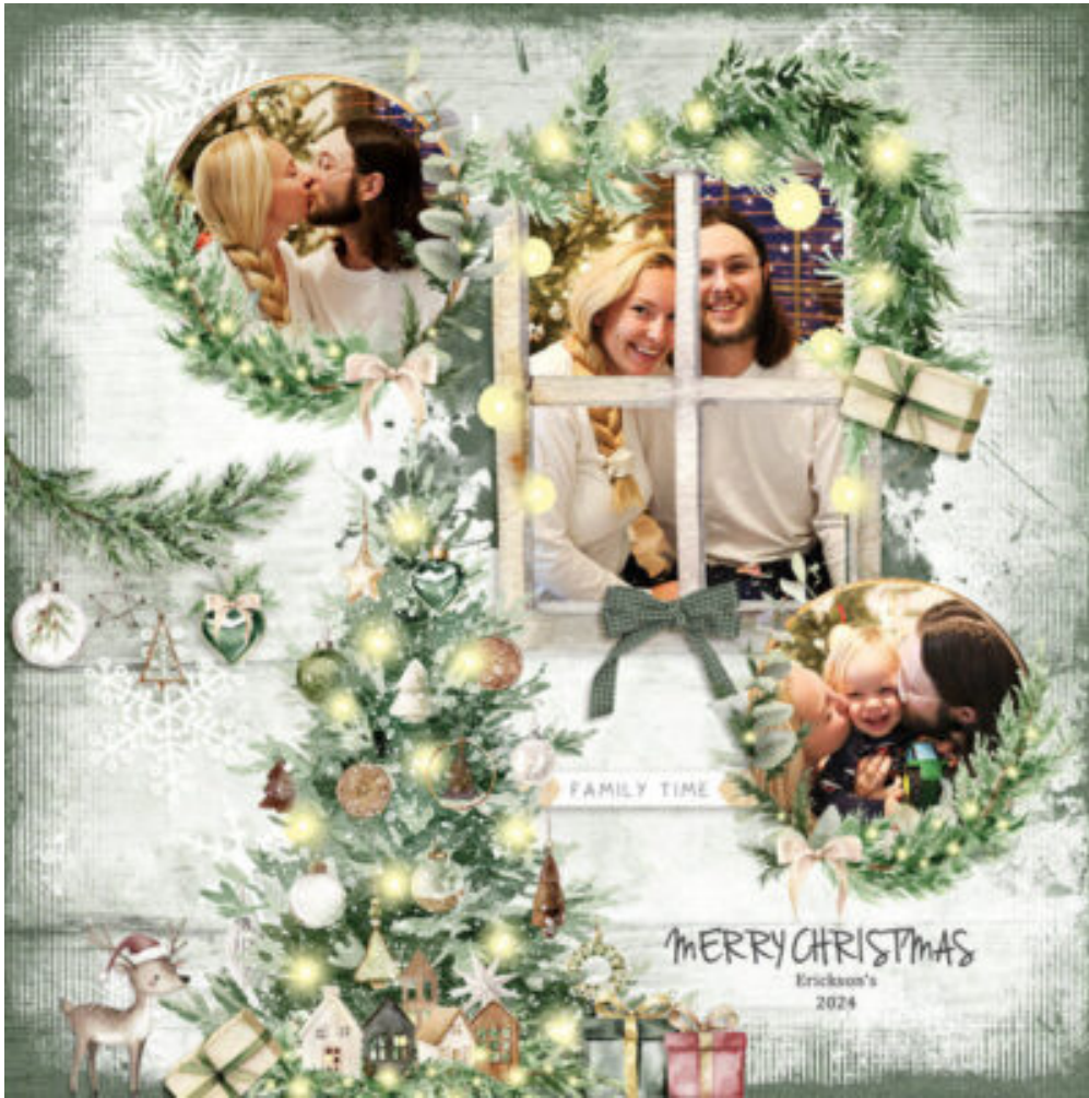
Layout by Glori