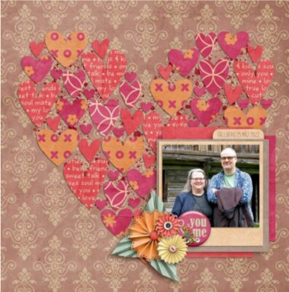
Page by Eva