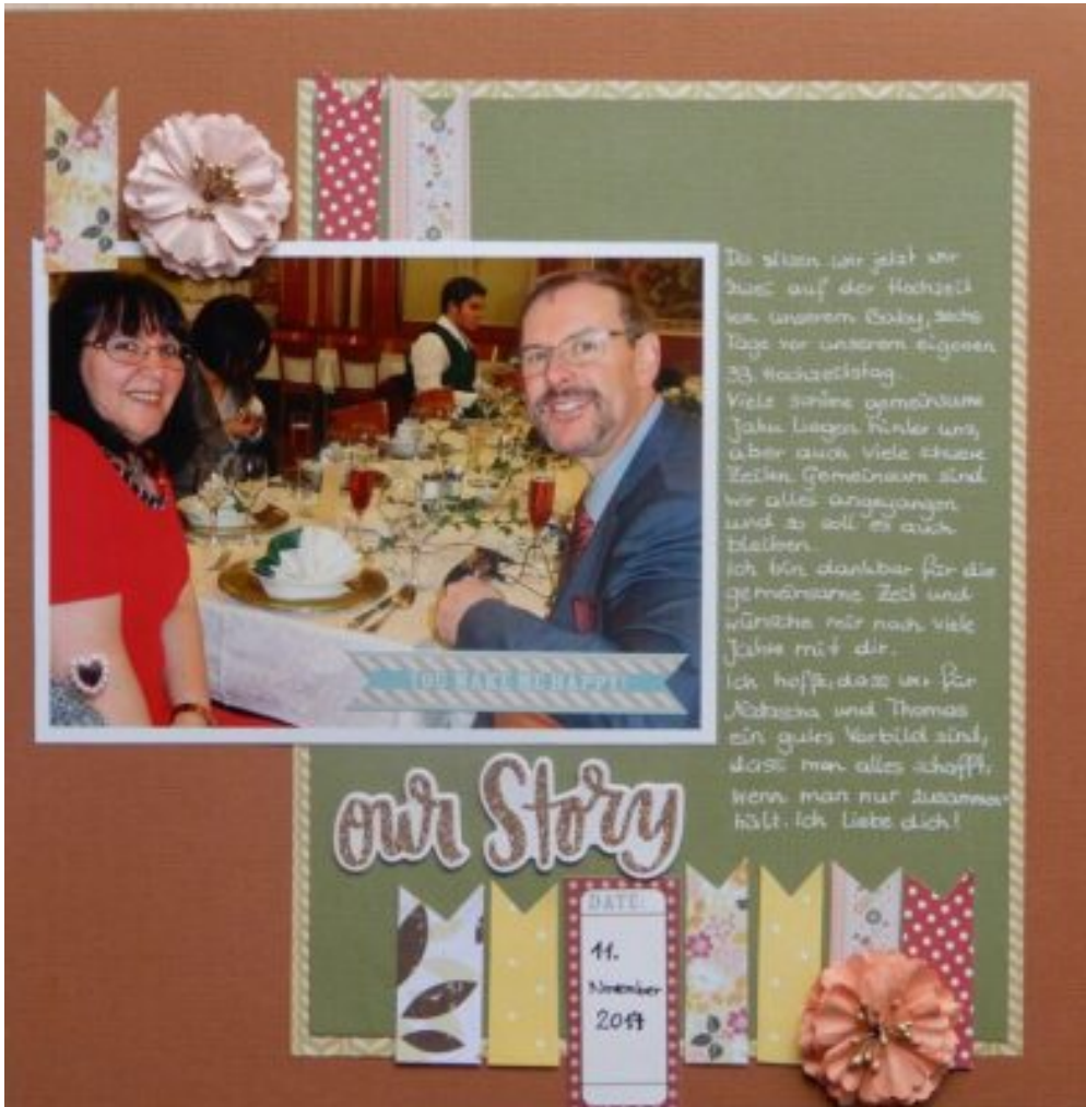
Layout by Susi