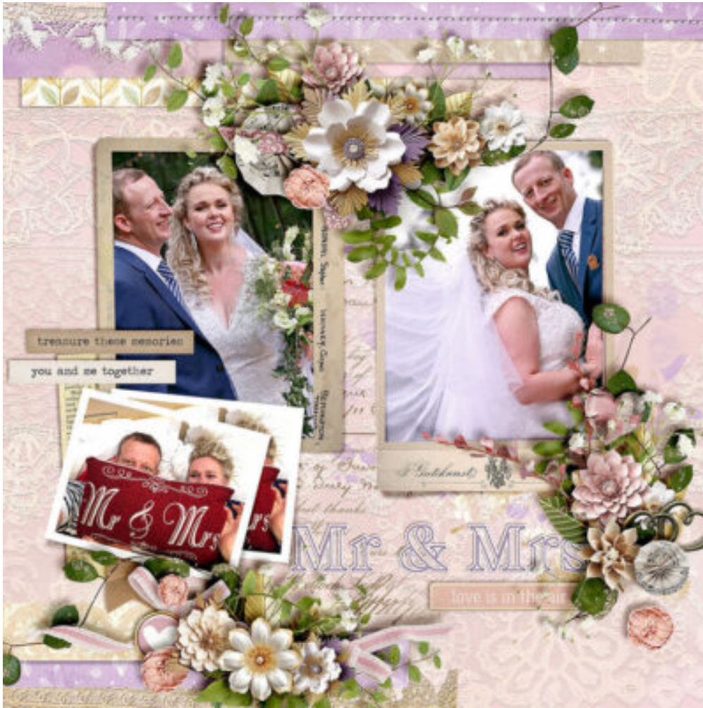
Page by Christelle