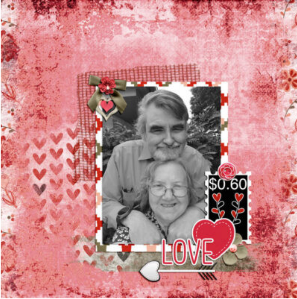
Project by Scribler