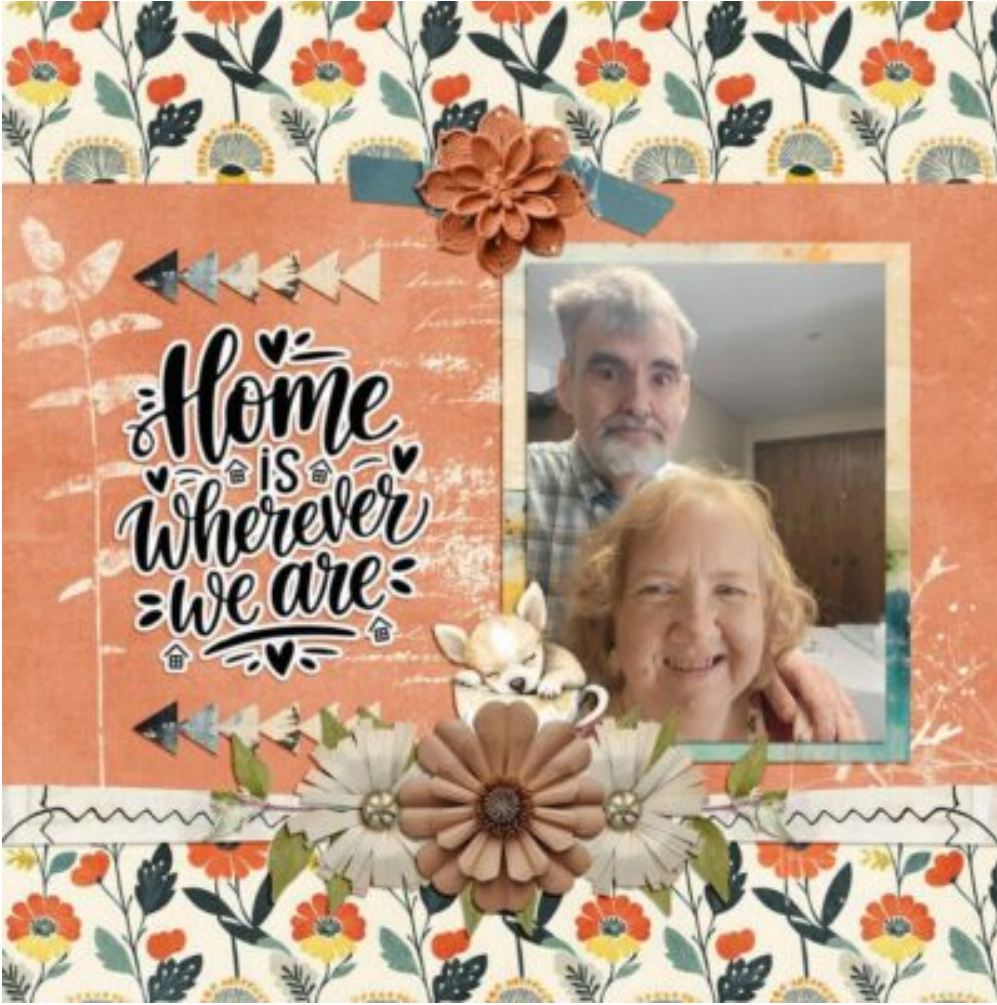
Page by Scribler