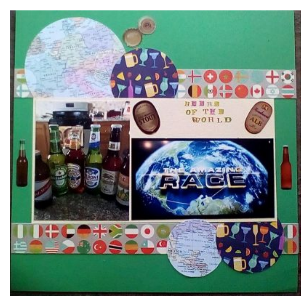
Layout by T-towngirl