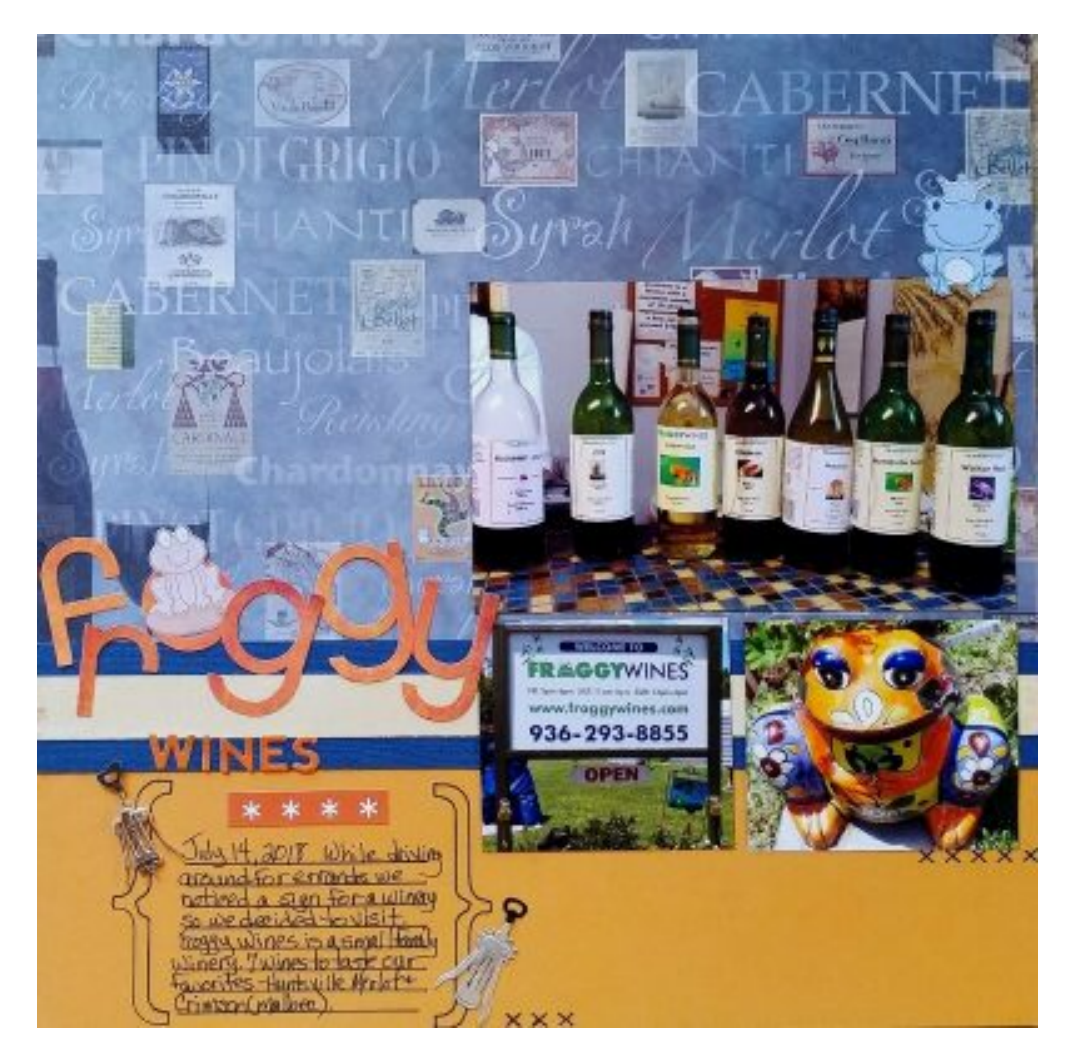
Layout by Susan