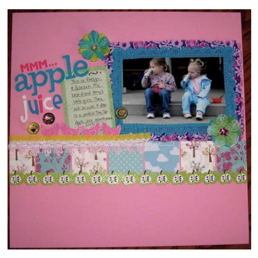
Layout by Silver26AK