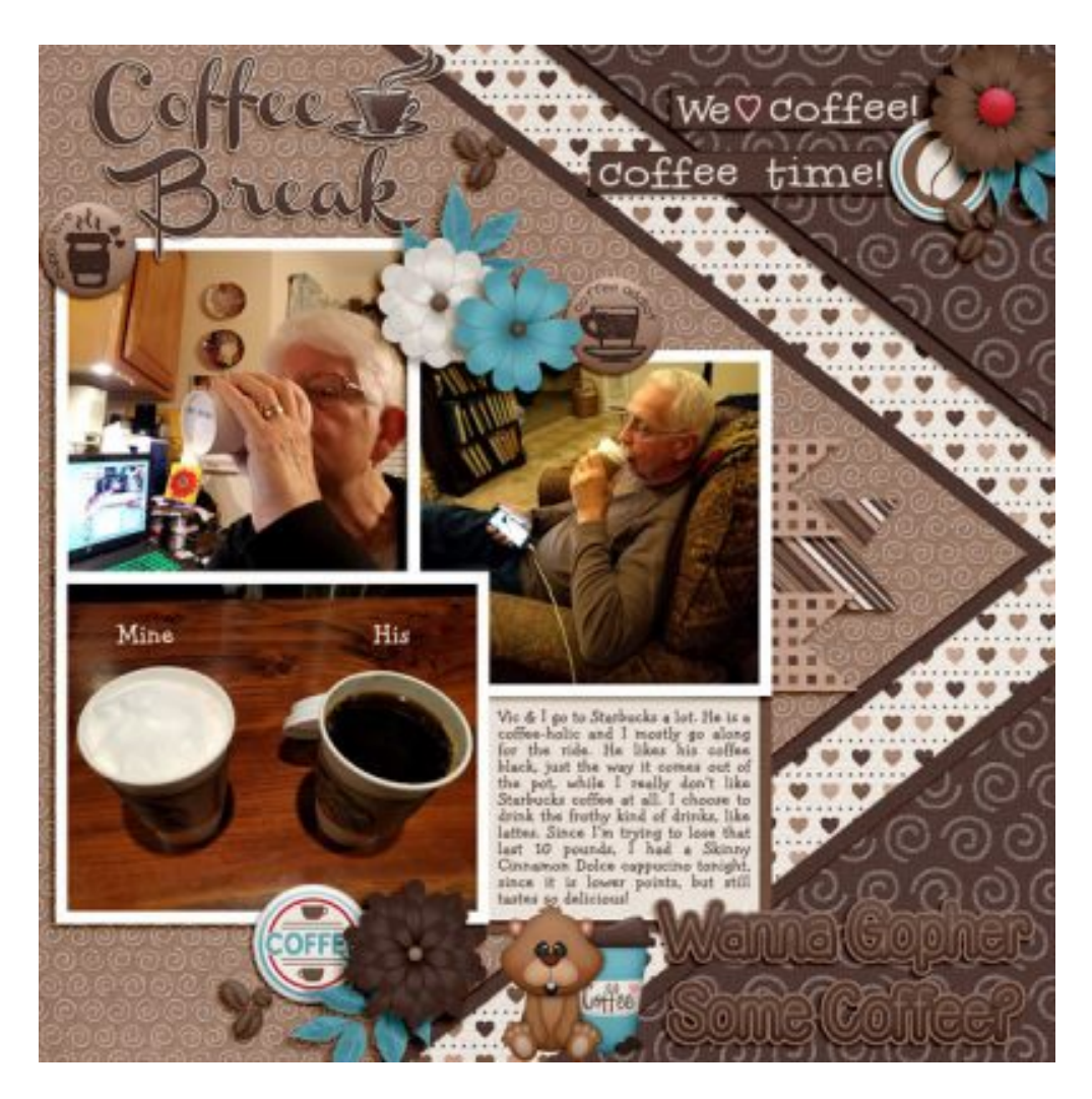
Layout by Betsyfru