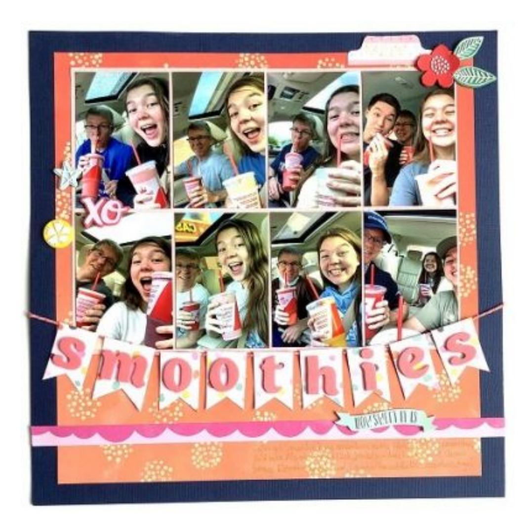
Page by Cynthia