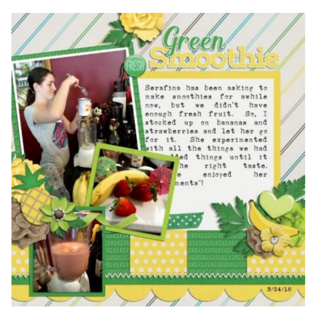
Layout by Meagan43