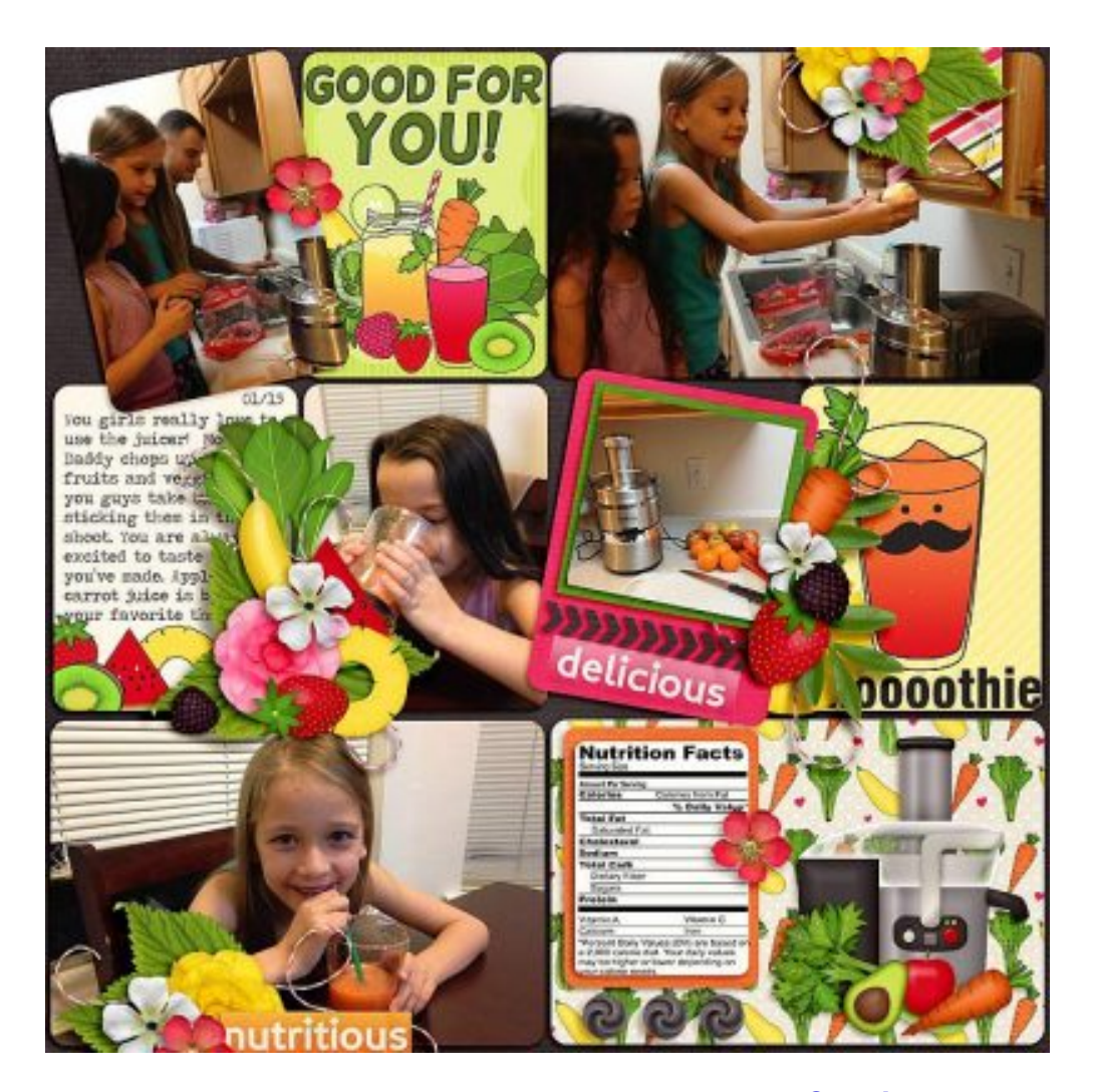
Layout by Cassie