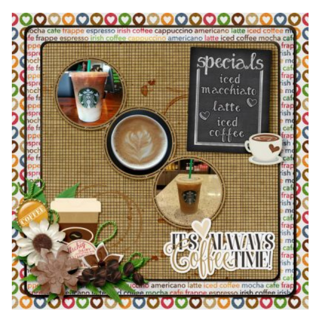
Page by Betsyfru