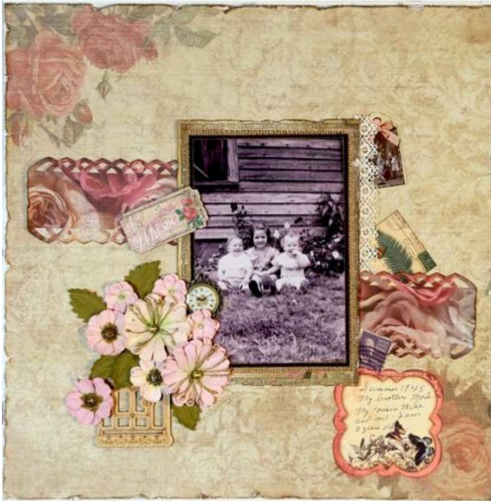
Layout by Anajul