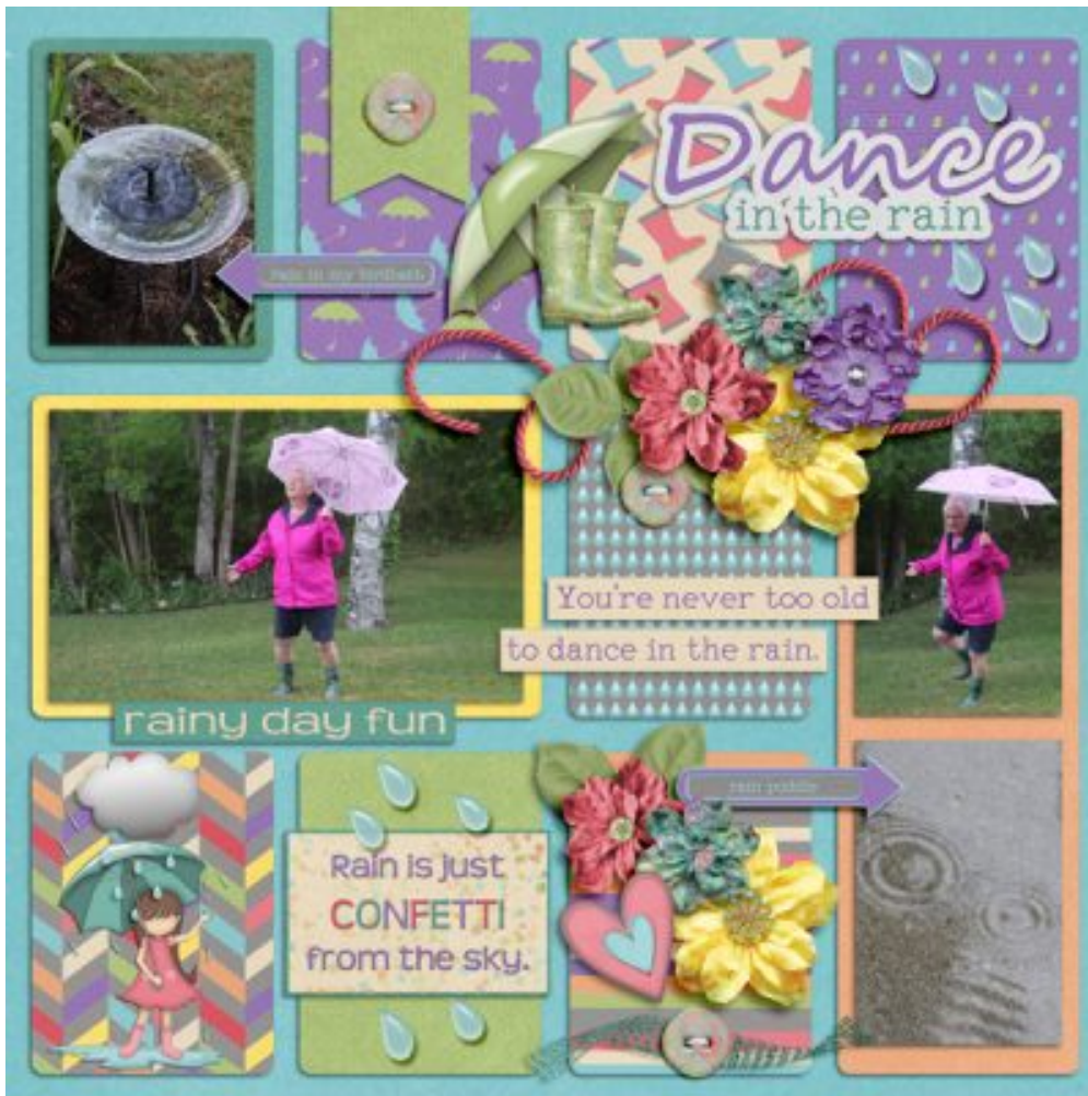
Layout by Betsyfru