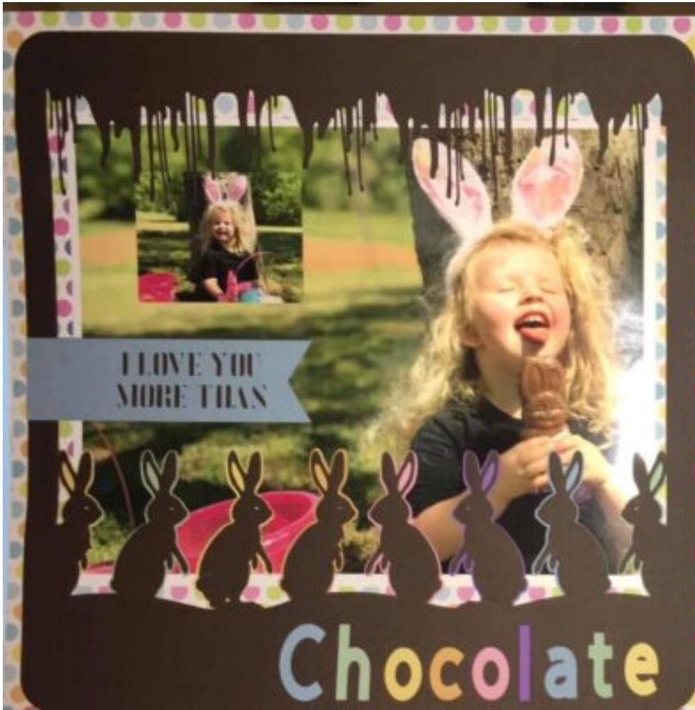
Layout by Patjohnson