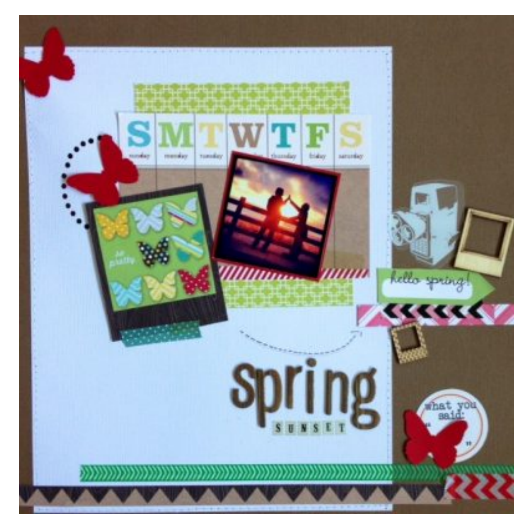
Layout by Carmen C-Henriquez