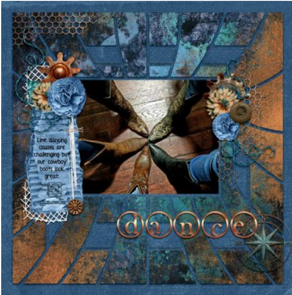
Project by Hawkgirl