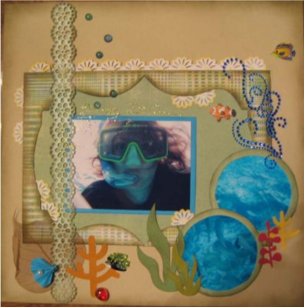
Layout by Laura P.