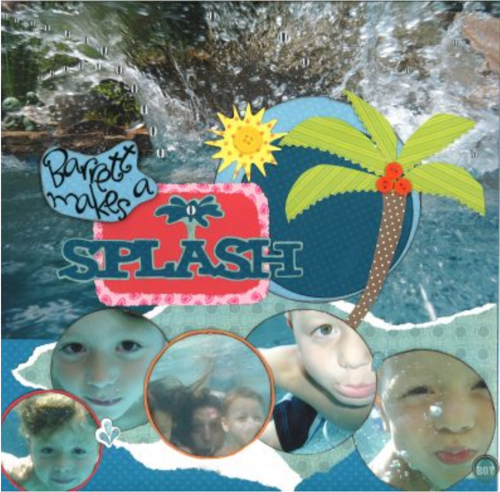
Layout by Kathy