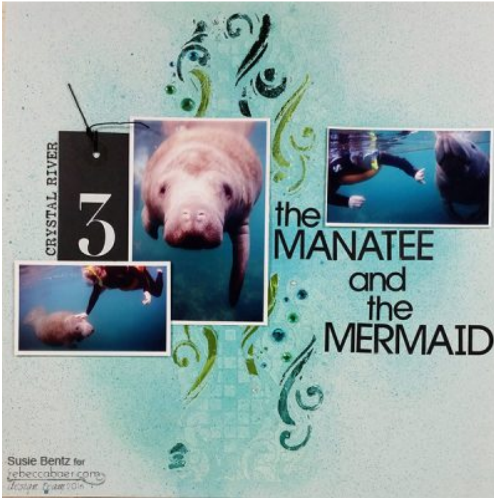
Layout by Susie