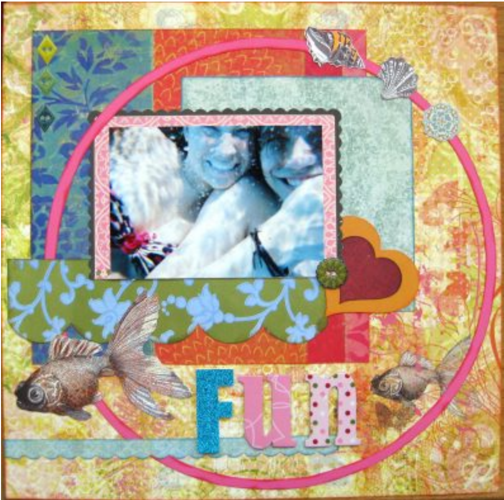
Layout by Bonnie