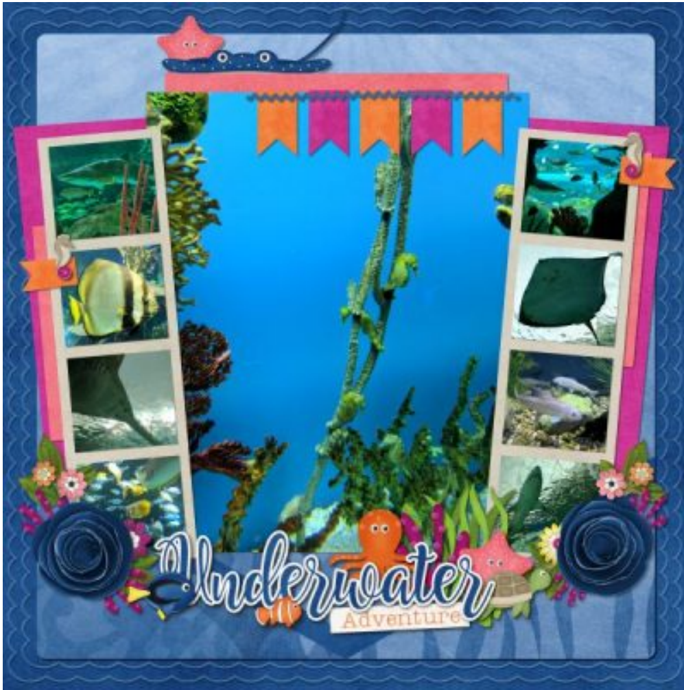
Layout by Sherri