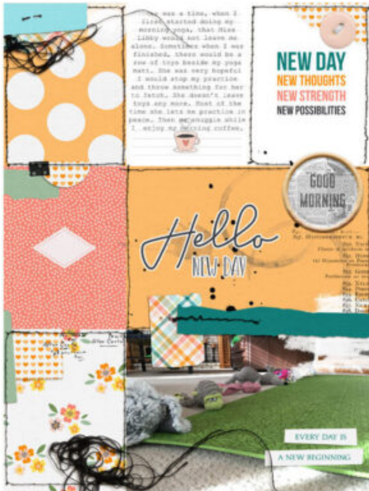
Layout by Candy