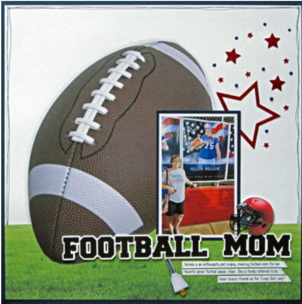
Page by Sgoetter