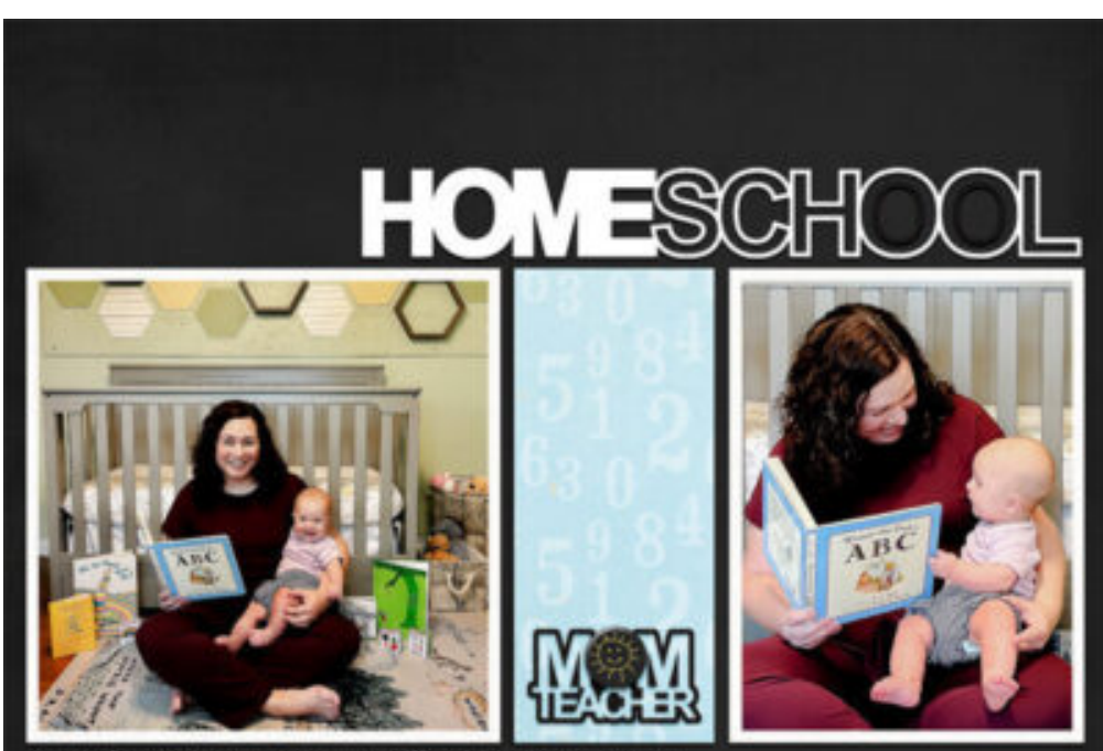
Year 14 of my teaching career looks very different than the previous years

When I learned that I would be having a total gastreetomy, I decided to take a medical sabbatical for the 2022-2023 school year. Recovery from a sungery this extensive is lengthy, unpredictable, and has the potential to affect my ability to do my gib effectively. I've been lucky to have a relatively eavy recovery so far, but I still have a long way to go with no guarantee things will remain this easy as I progress. My doctors, family, and I decided that a medical sabbatical was in my best interest as I get used to what life is like without a stomach. Additionally, the gene mutation that I have also puts me at a 40% lifetime risk of developing libular breast cancer, so I will be using this time to undergo imaging and testing to determine if I need to have a risk-reducing double mastectomy.