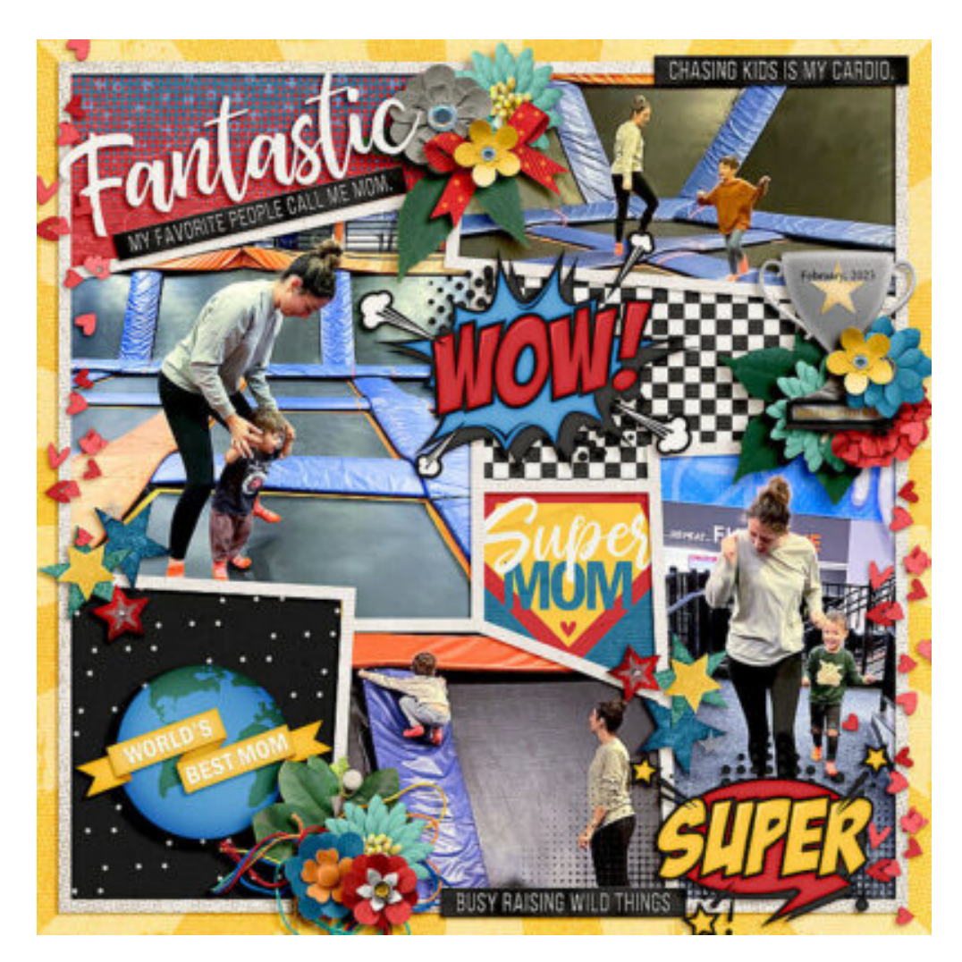
Layout by Tammy