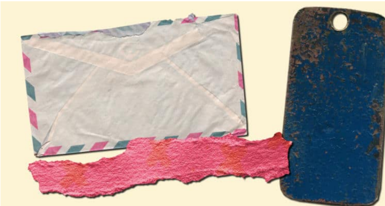
Photo Effects: Apply grungy filters or overlays to your photos to give them a distressed or vintage

Embellishments: Grungy embellishments can include elements like distressed postage stamps, torn pieces of paper, ripped fabric, rusty gears, splatters, stains, or ink blots. These elements can add a sense of texture and dimension to your scrapbook pages.