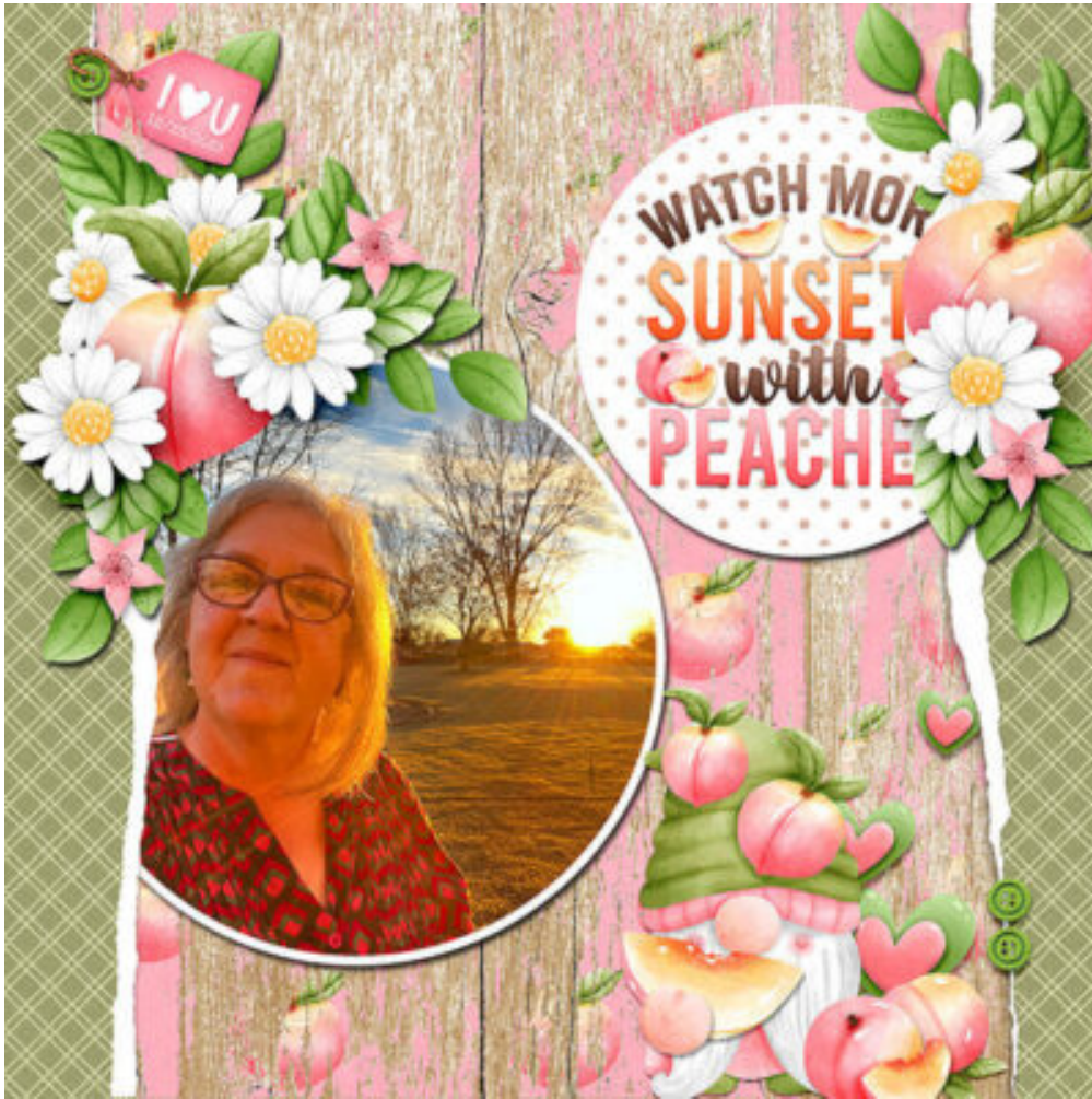
Layout by Kim