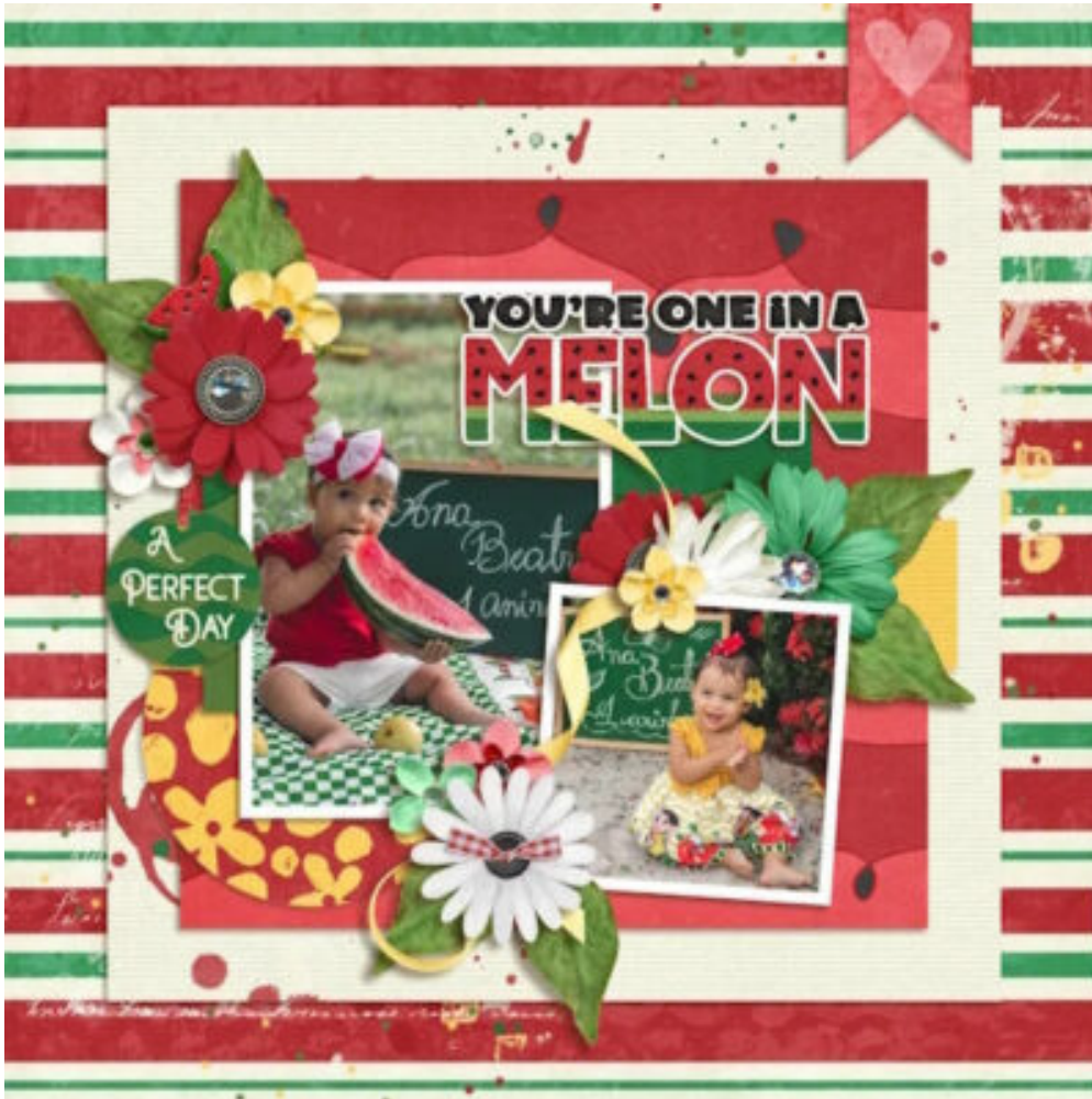
Layout by Lou