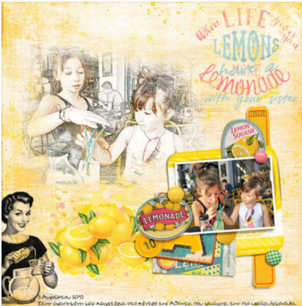
Layout by Cinderella_cindy