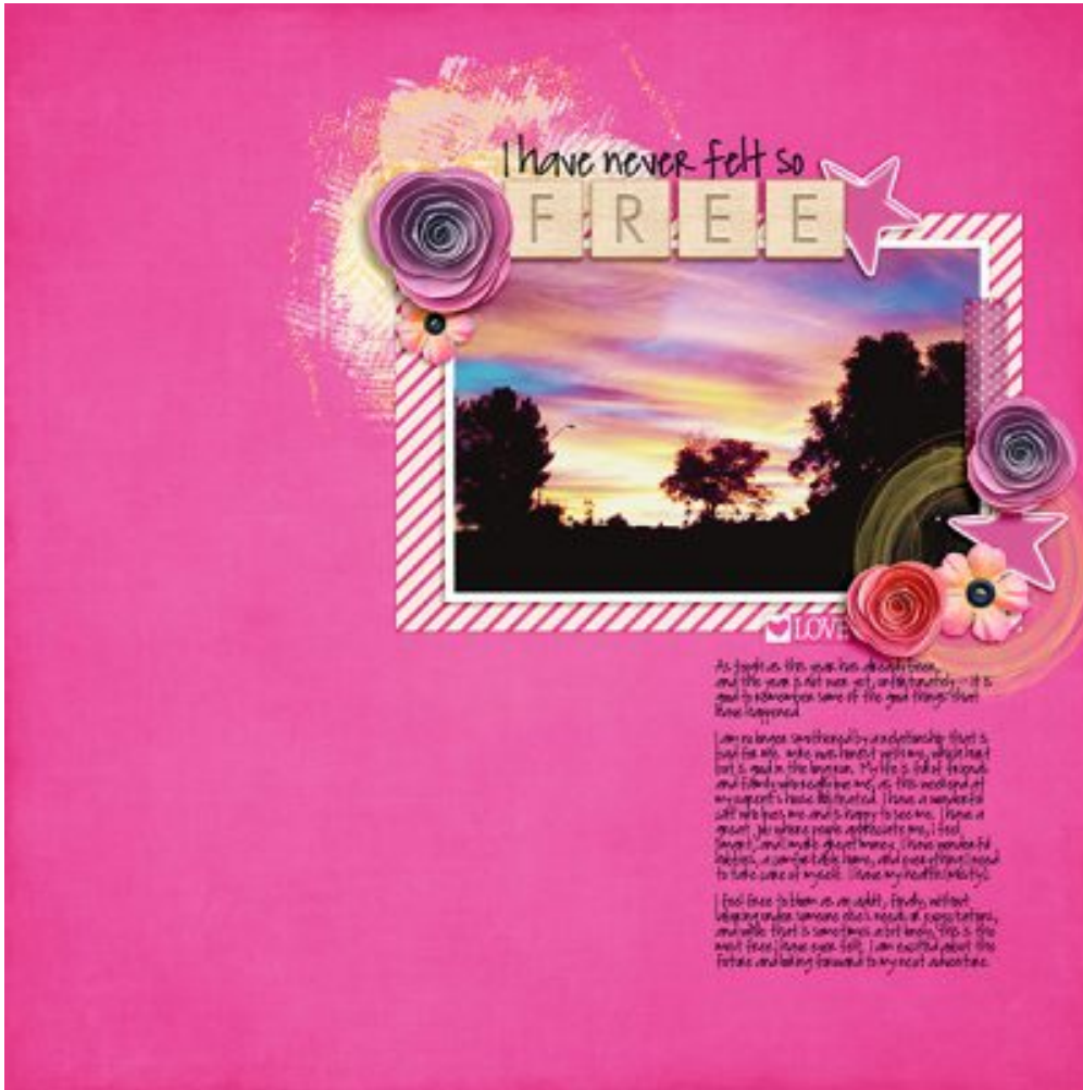
Layout by Kcvance