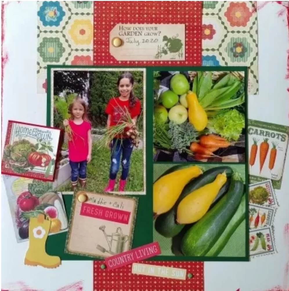
Layout by Susan