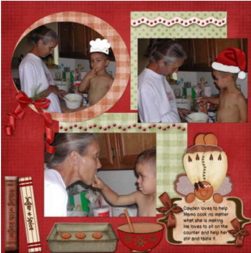
Layout by Mendy