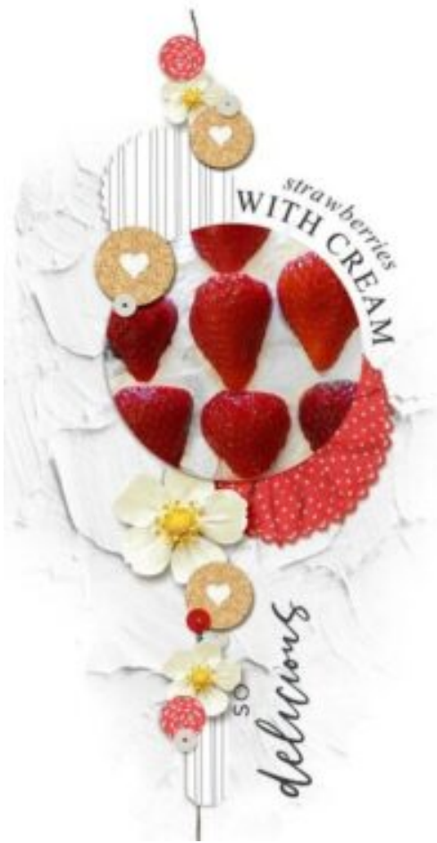
Layout by Jen