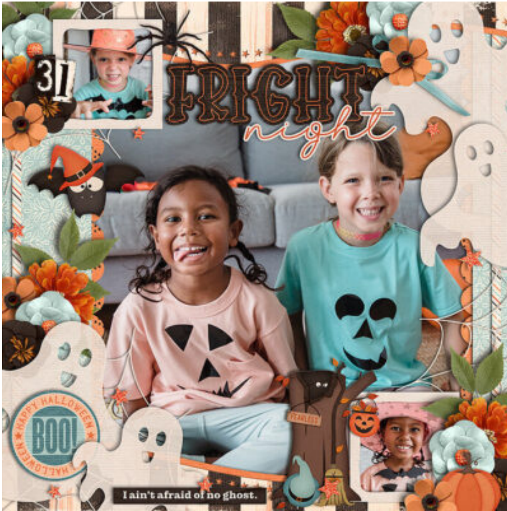
Layout by Mary