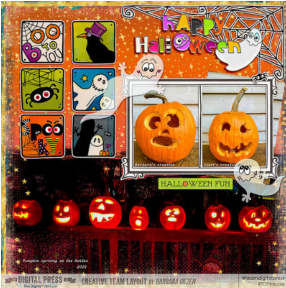
Layout by BarbaraUnzen