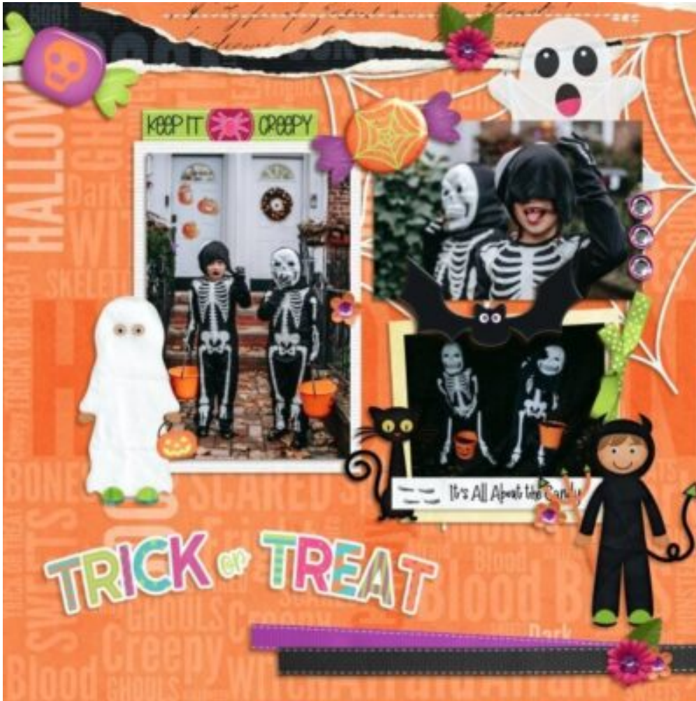
Layout by Lou