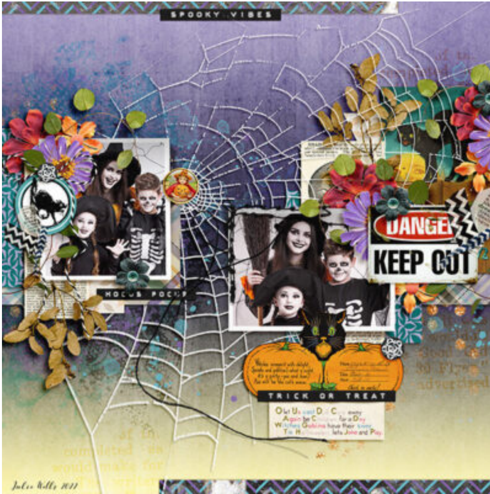
Layout by Julie