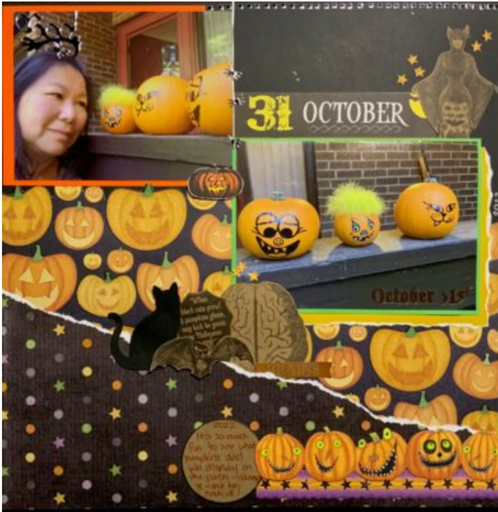
Layout by Lis