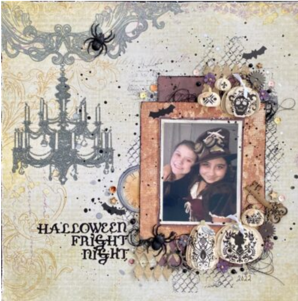
Project by Grammy Scrapper