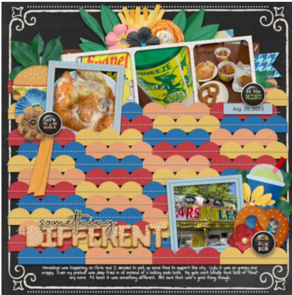
Layout by Lynn