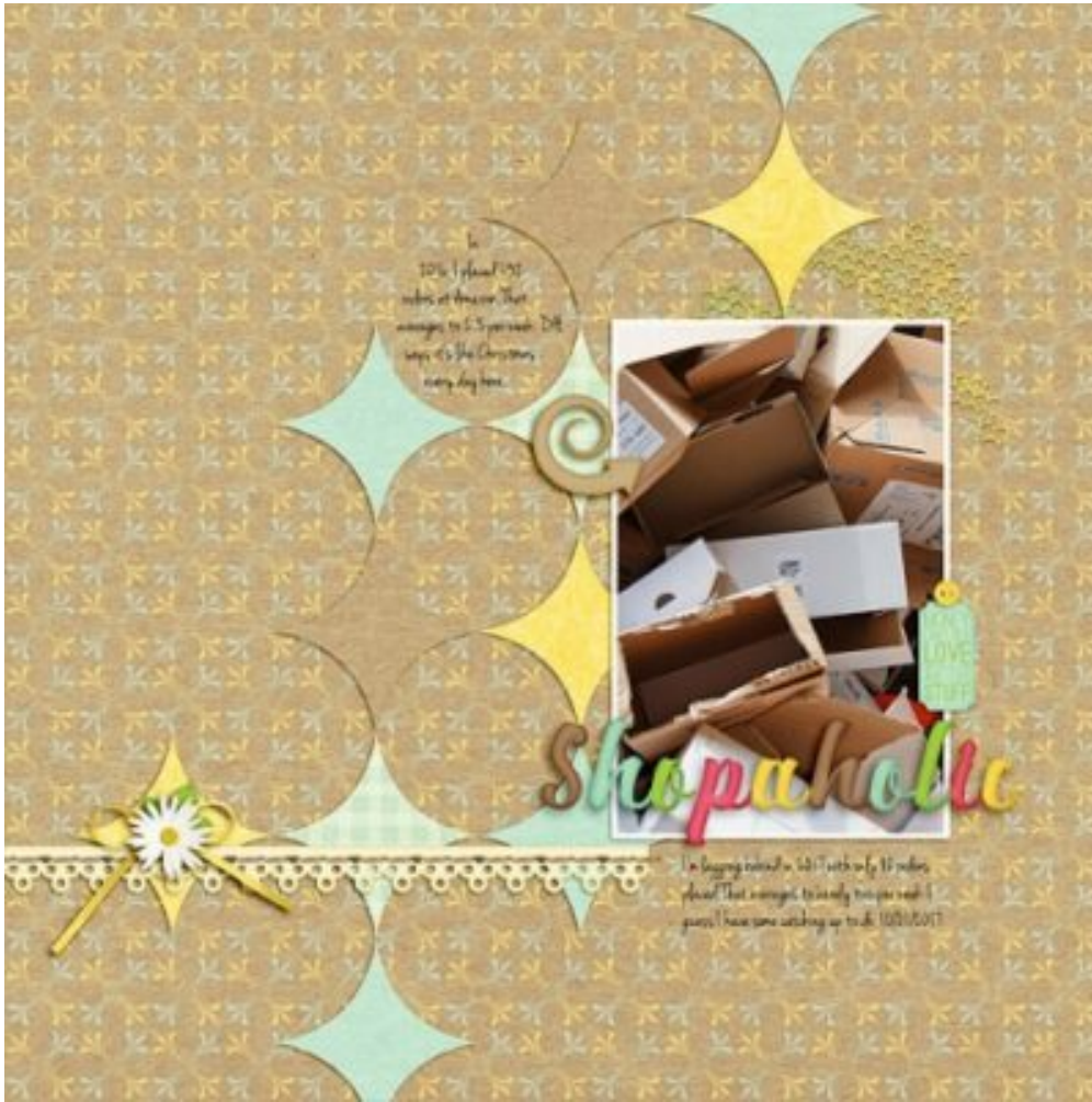
Layout by Beatrice Loren