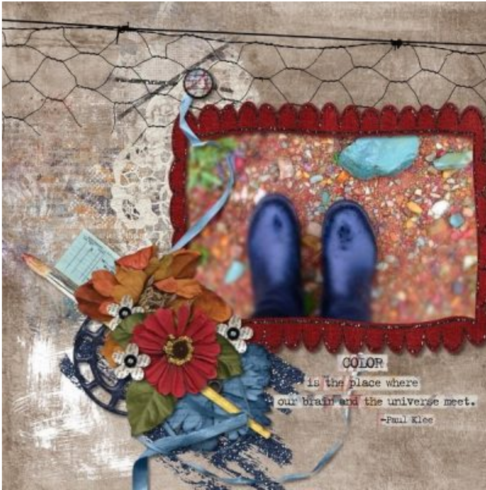
Page by Moemc