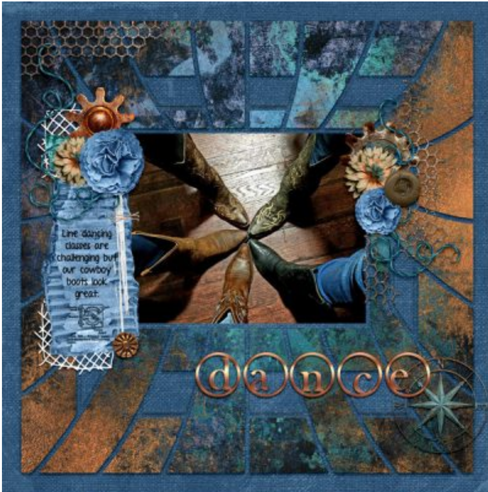
Project by Hawkgirl