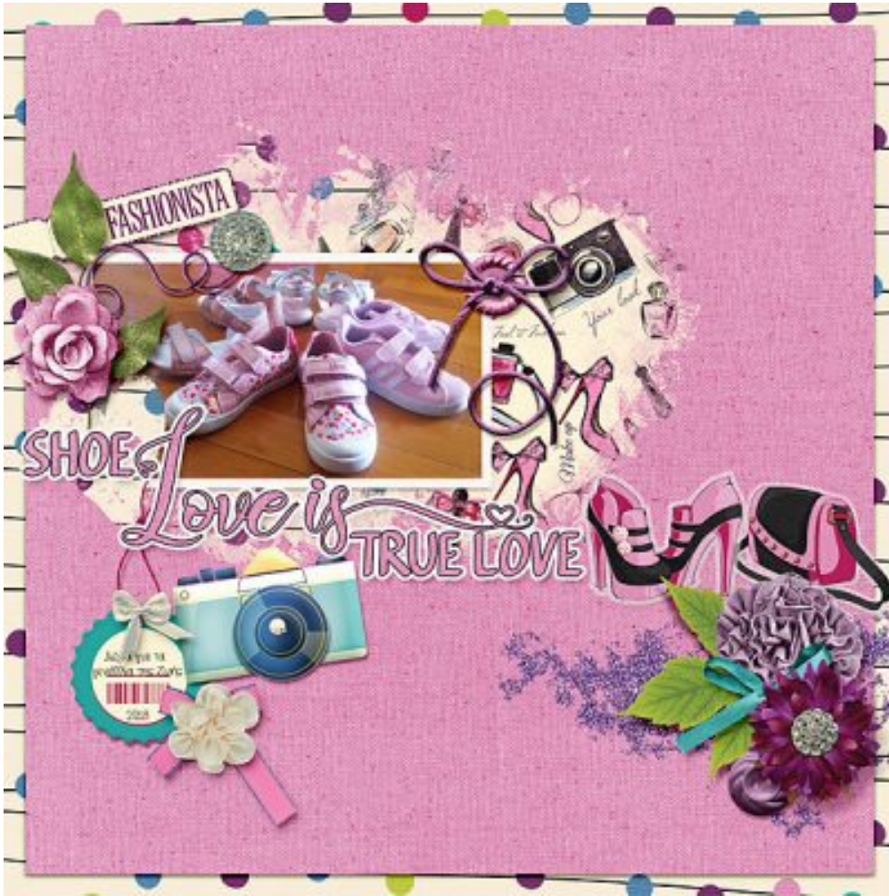
Layout by Cinderella_cindy