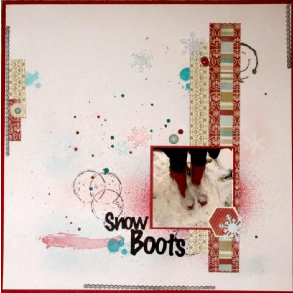
Layout by Norma