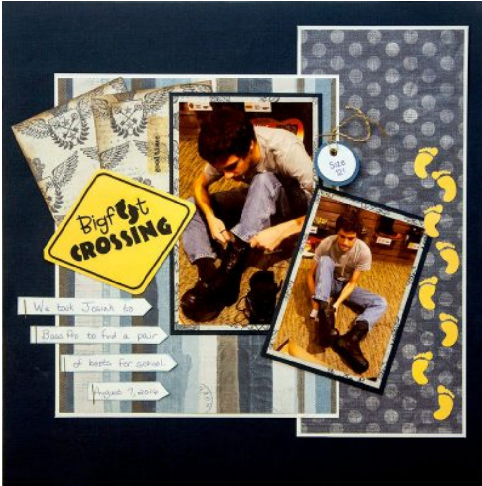
Layout by Lyn