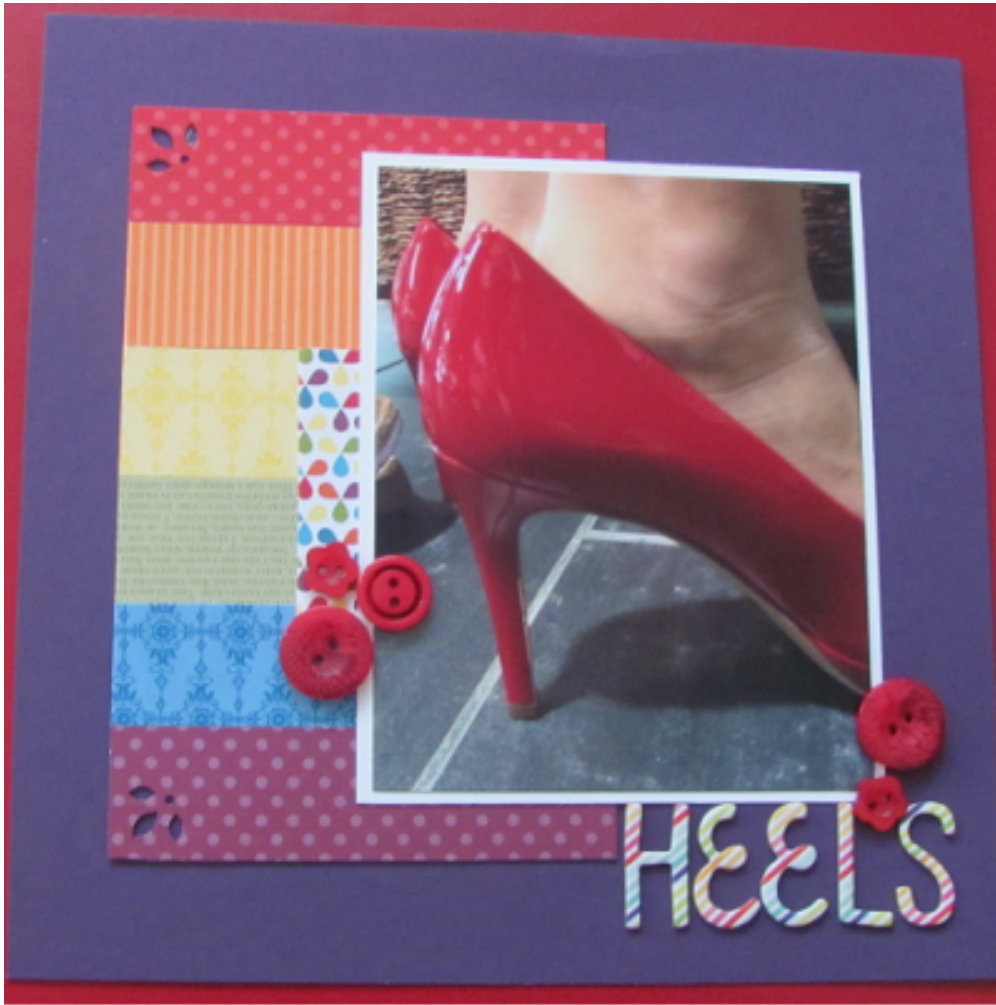
Page by Tammy