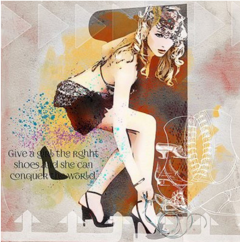
Layout by Marianne/ Margje