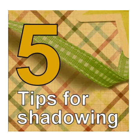
5 tips for shadowing