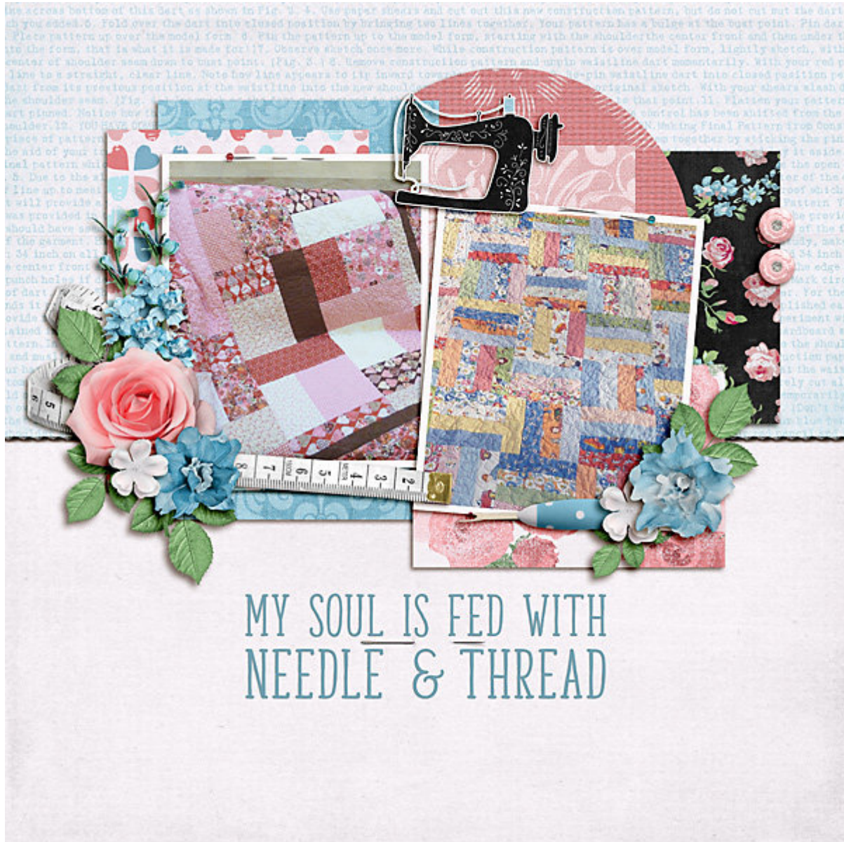
Layout by Tomasia