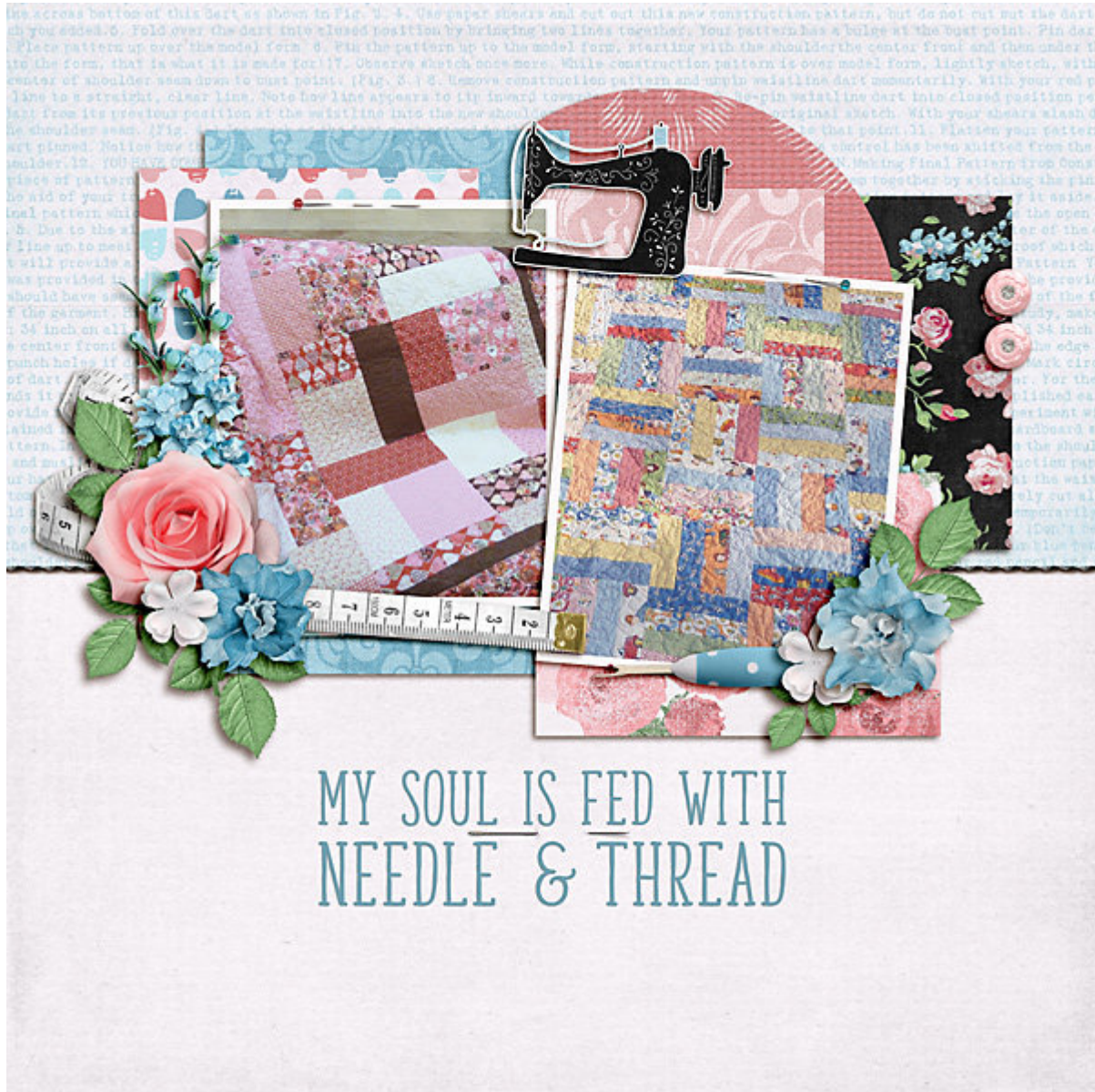
Project by Tomosia