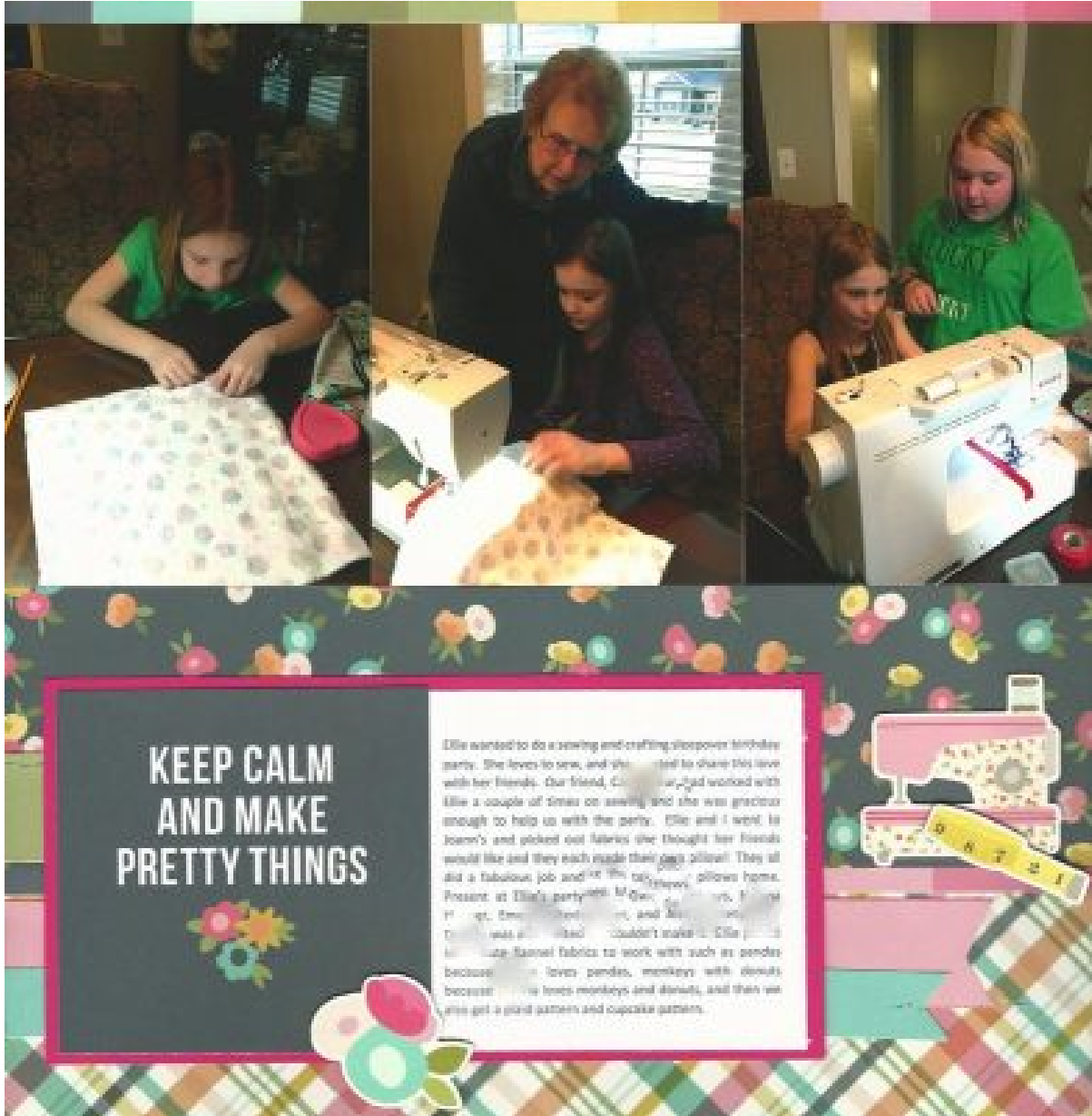
Layout by Alice