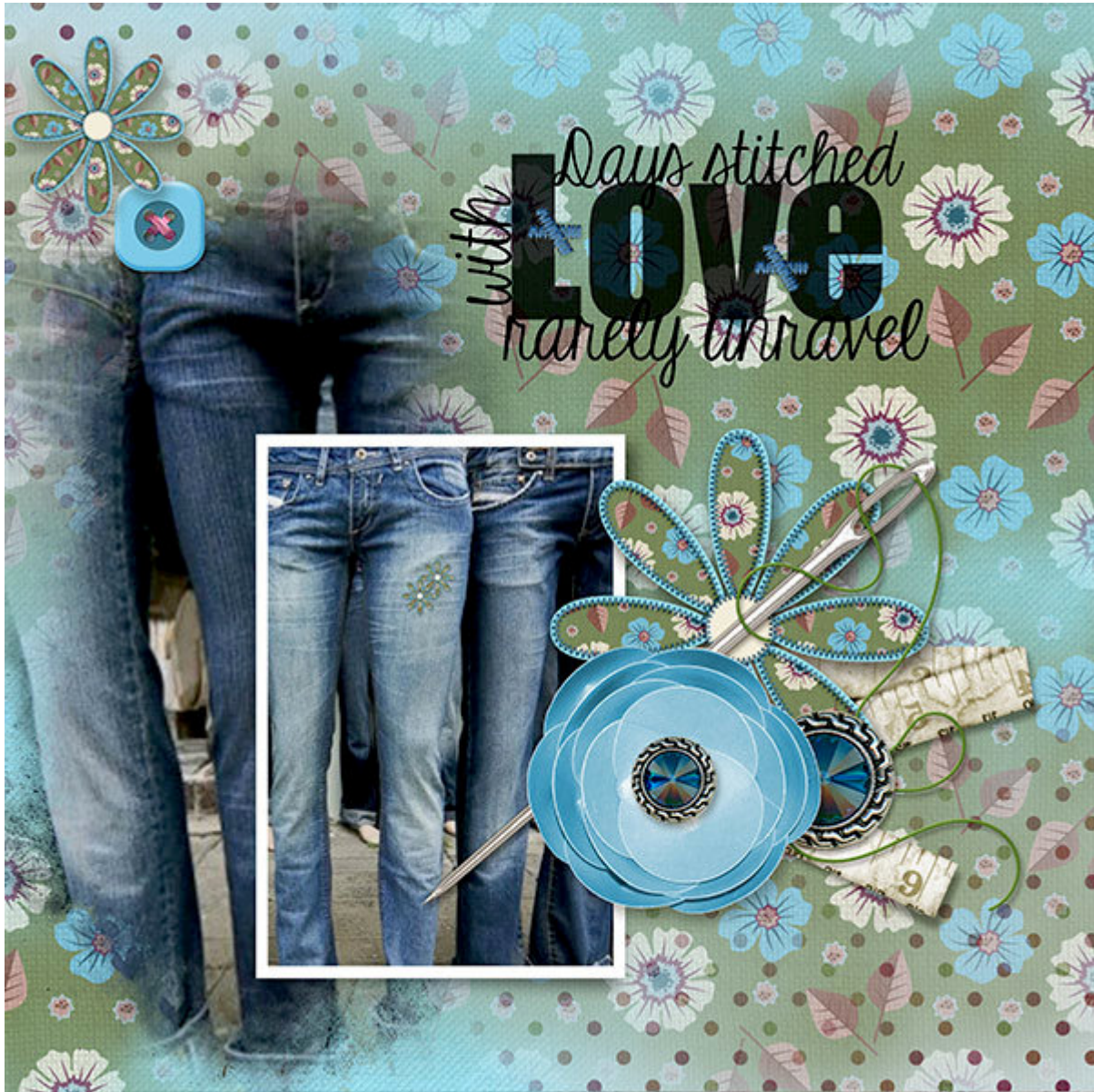
Layout by Joyce