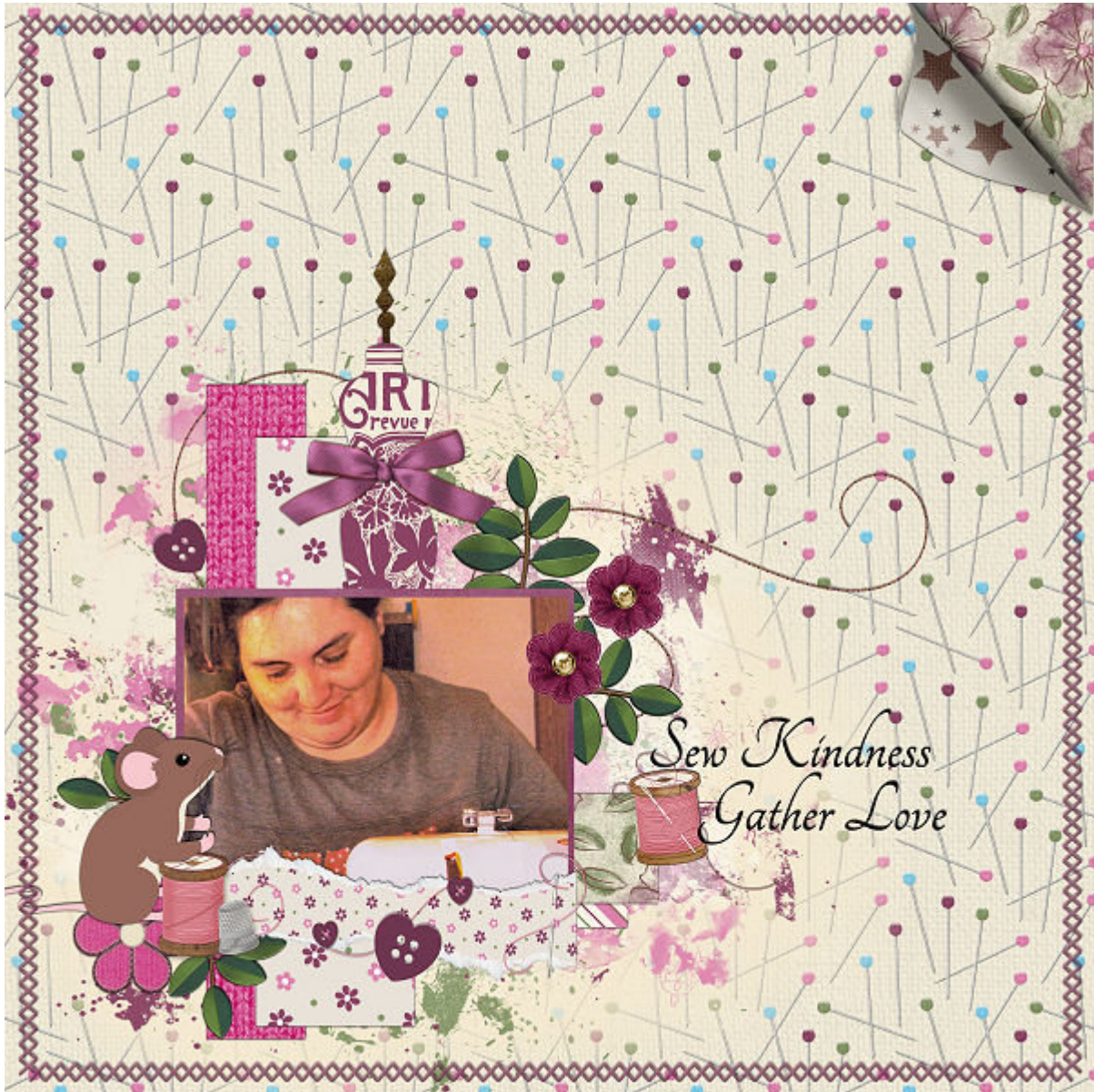
Layout by Jennifer