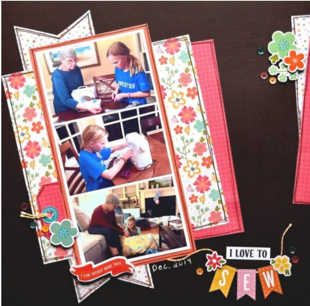
Layout by Ashley