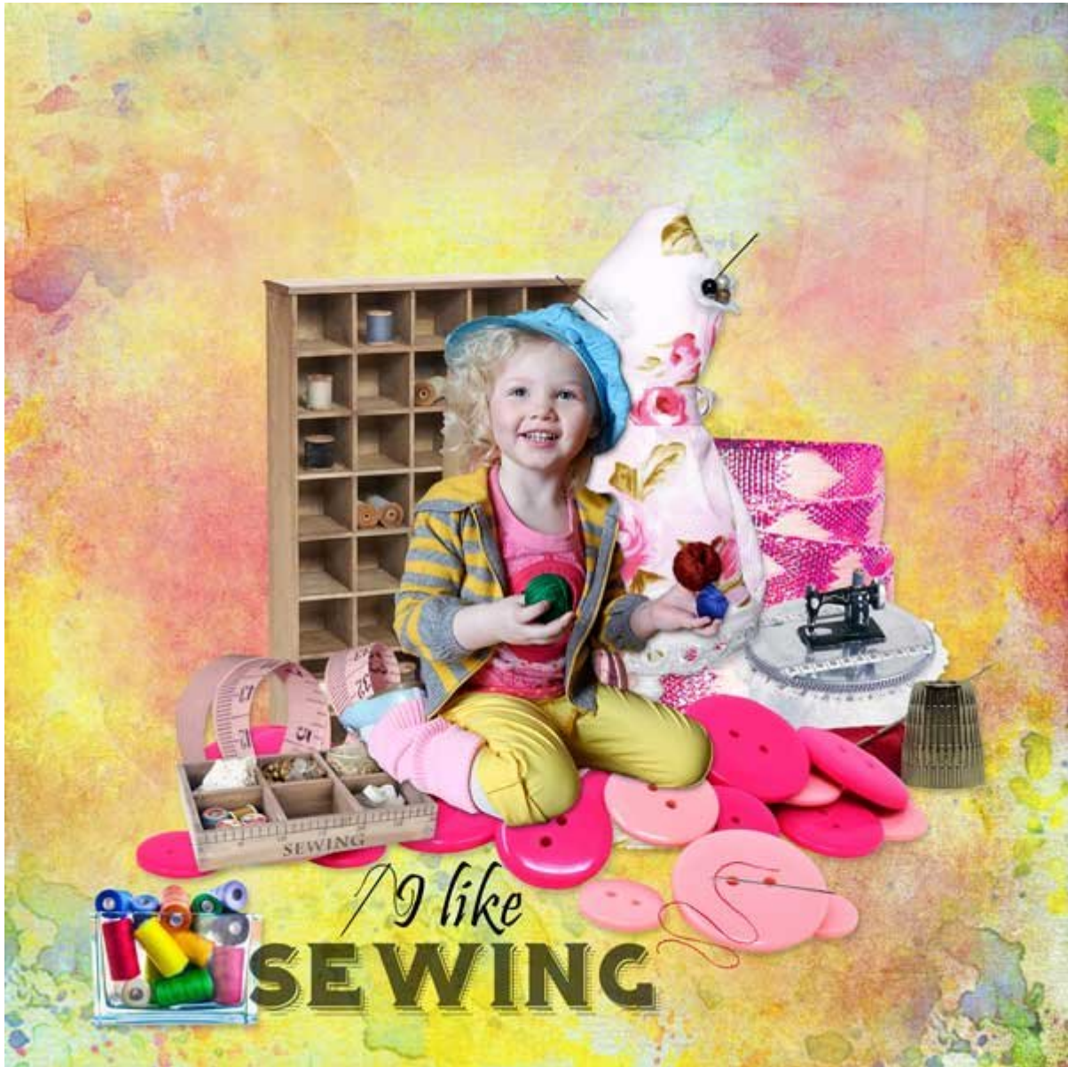
Layout by Stacey