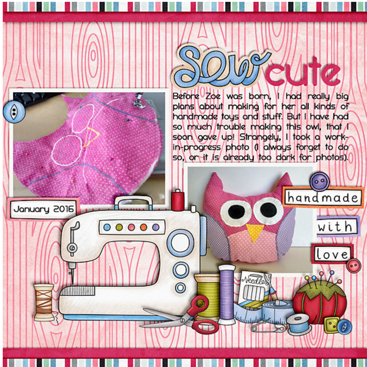
Layout by Cinderella_cindy