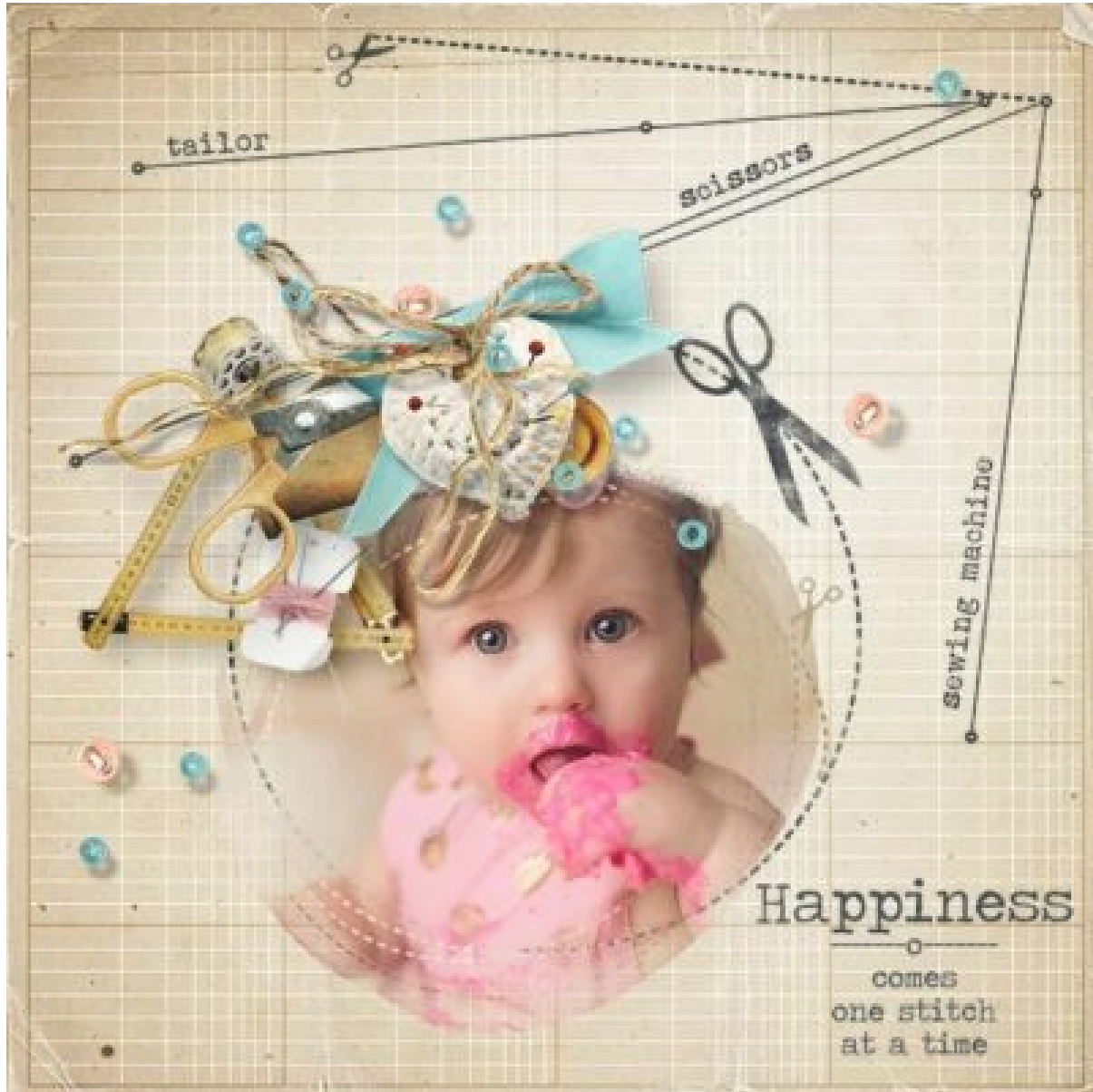
Layout by Henriette