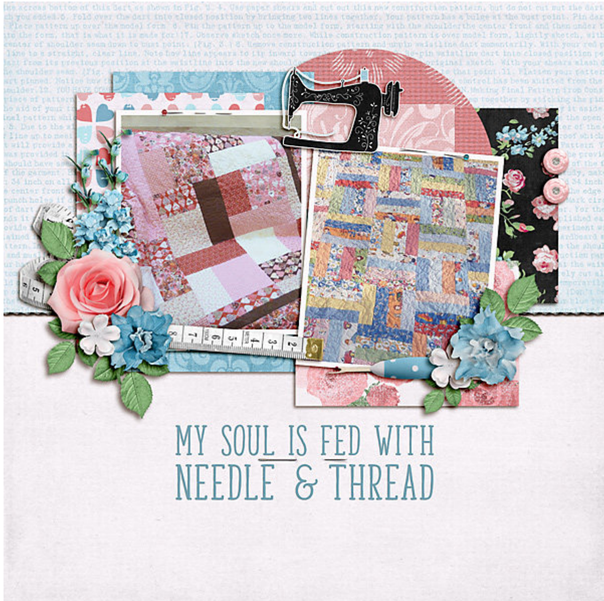
Layout by Tomasia