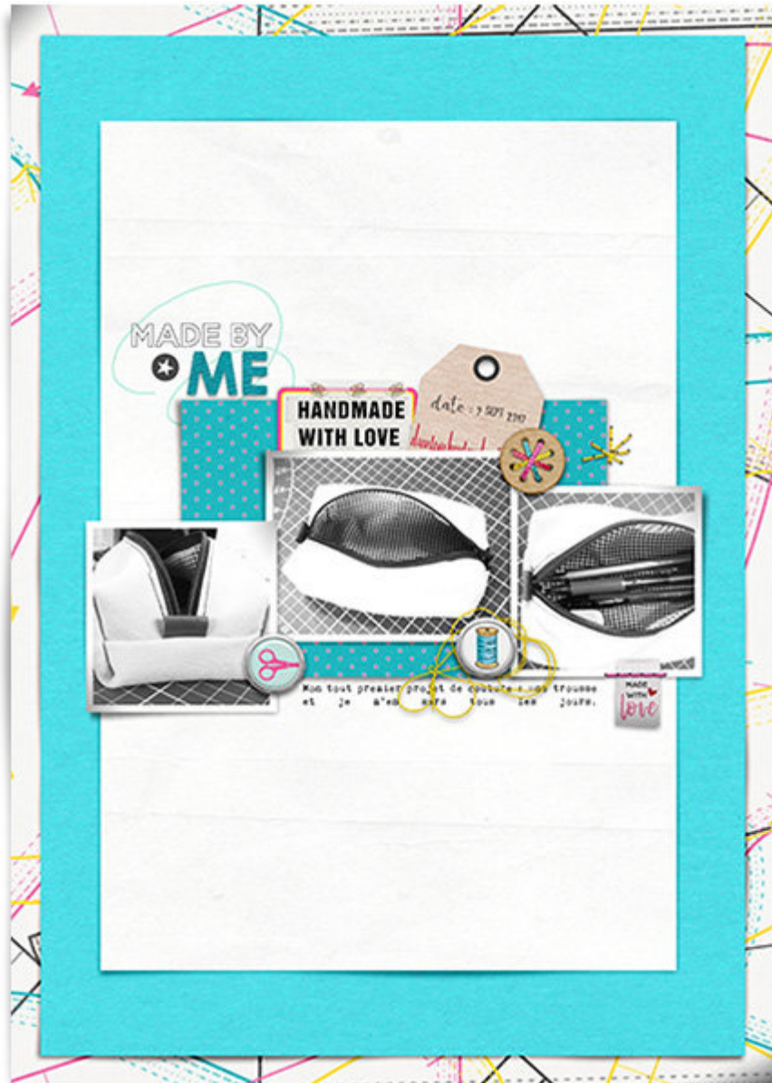
Layout by Gaelle