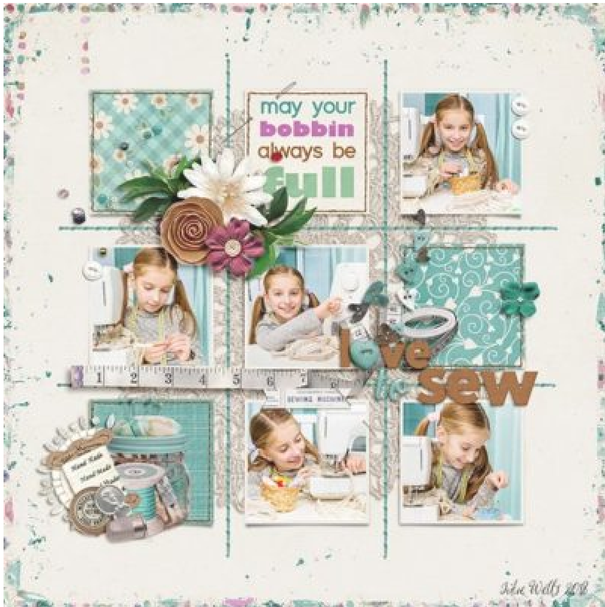
Layout by Julie