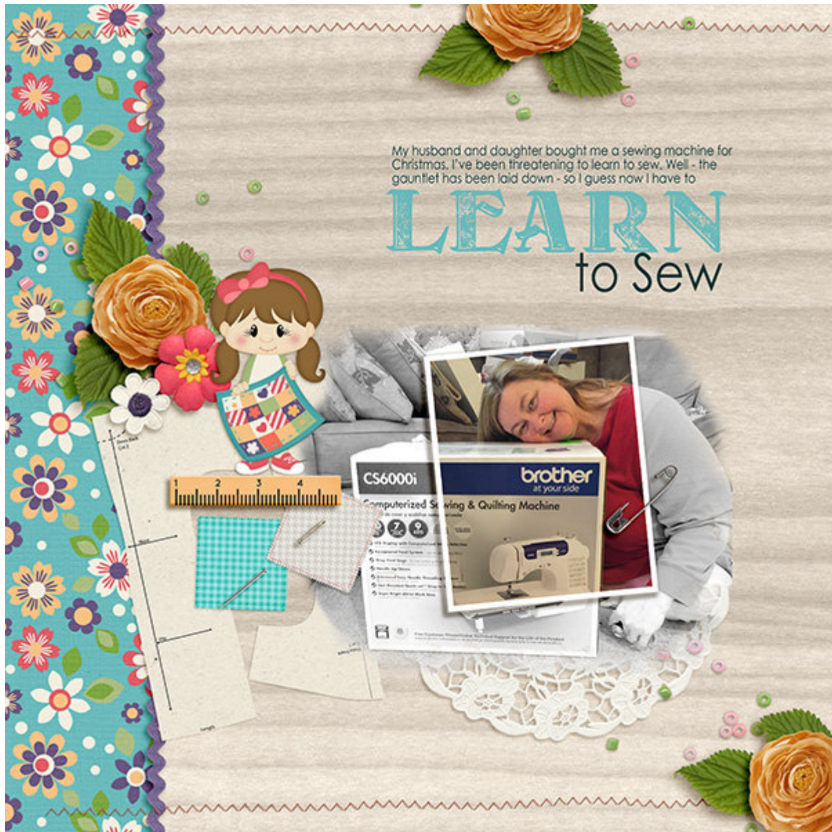
Layout by Susan