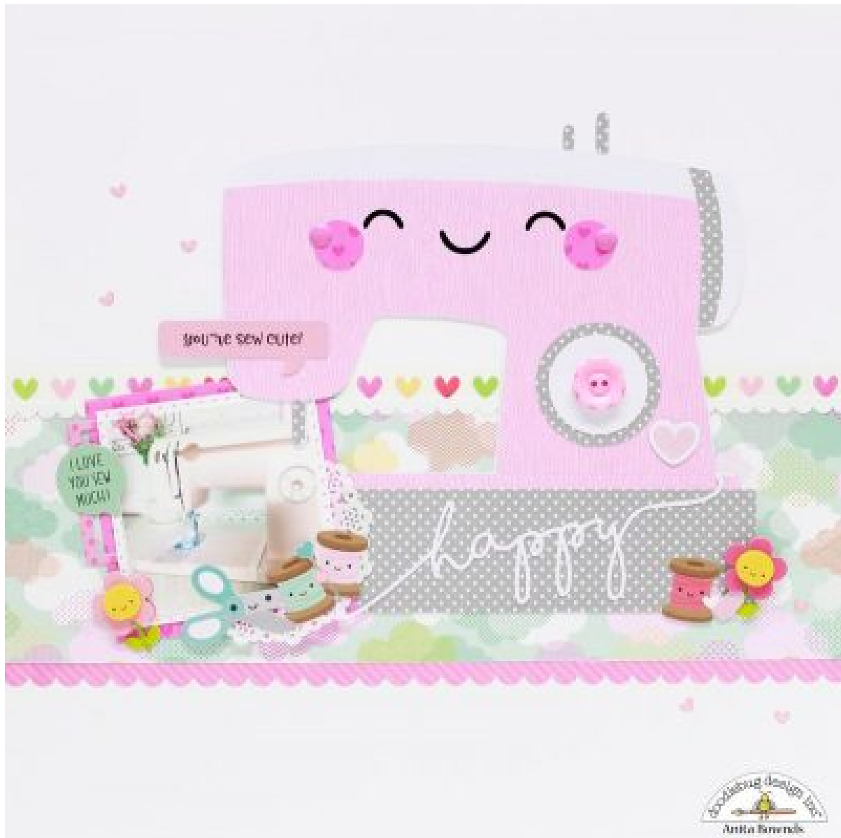
Layout by Anita