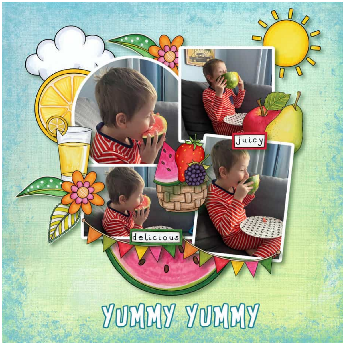
Layout by Chris Allport