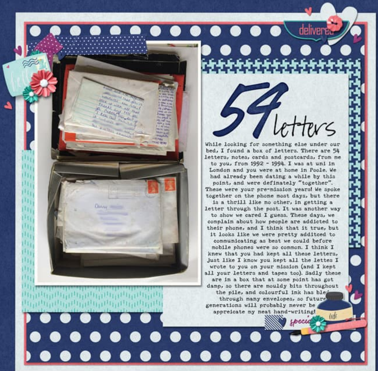
Layout by Corrin