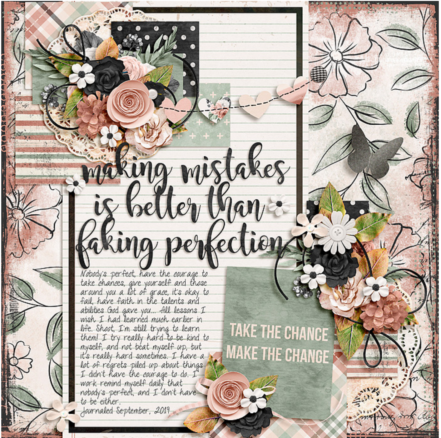
Layout by Tammy