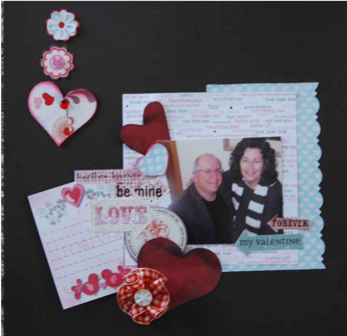
Layout by Jean