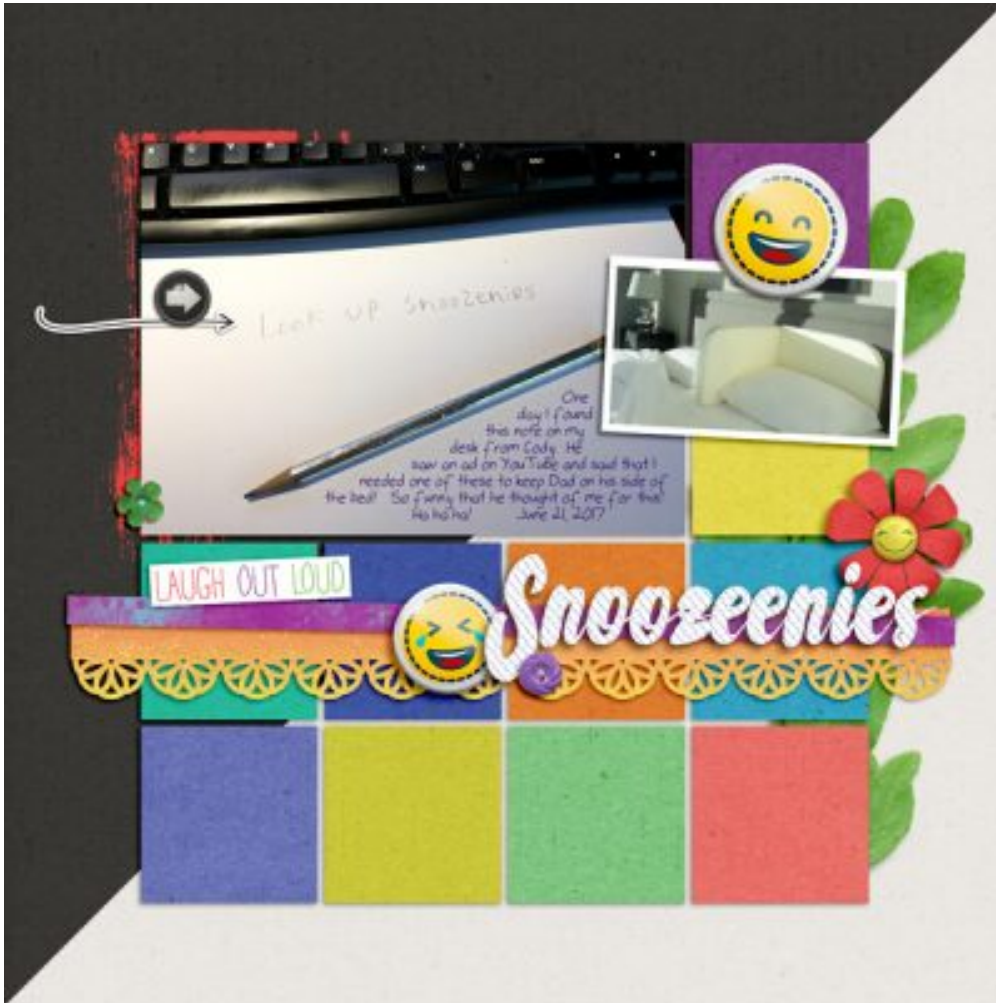
Layout by Karen