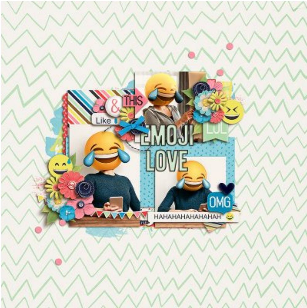
Layout by Biancka