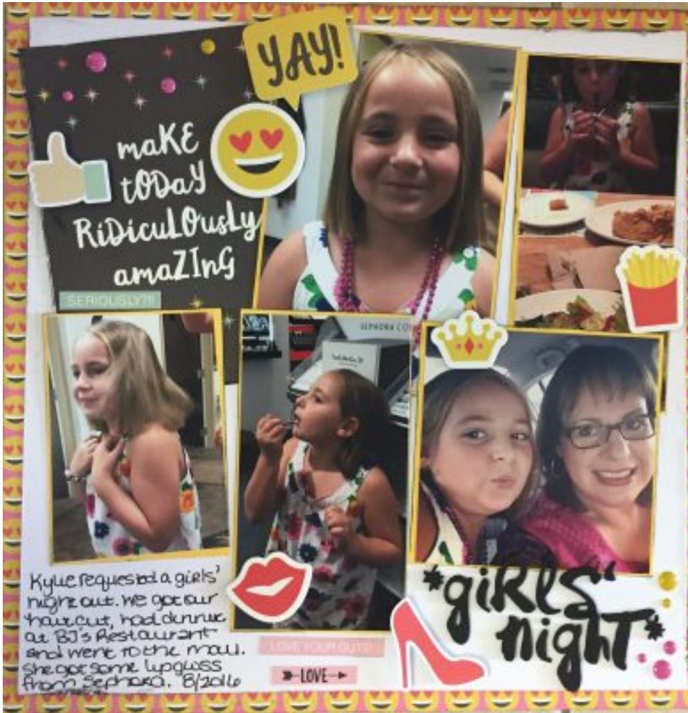
Layout by HillsGirl74