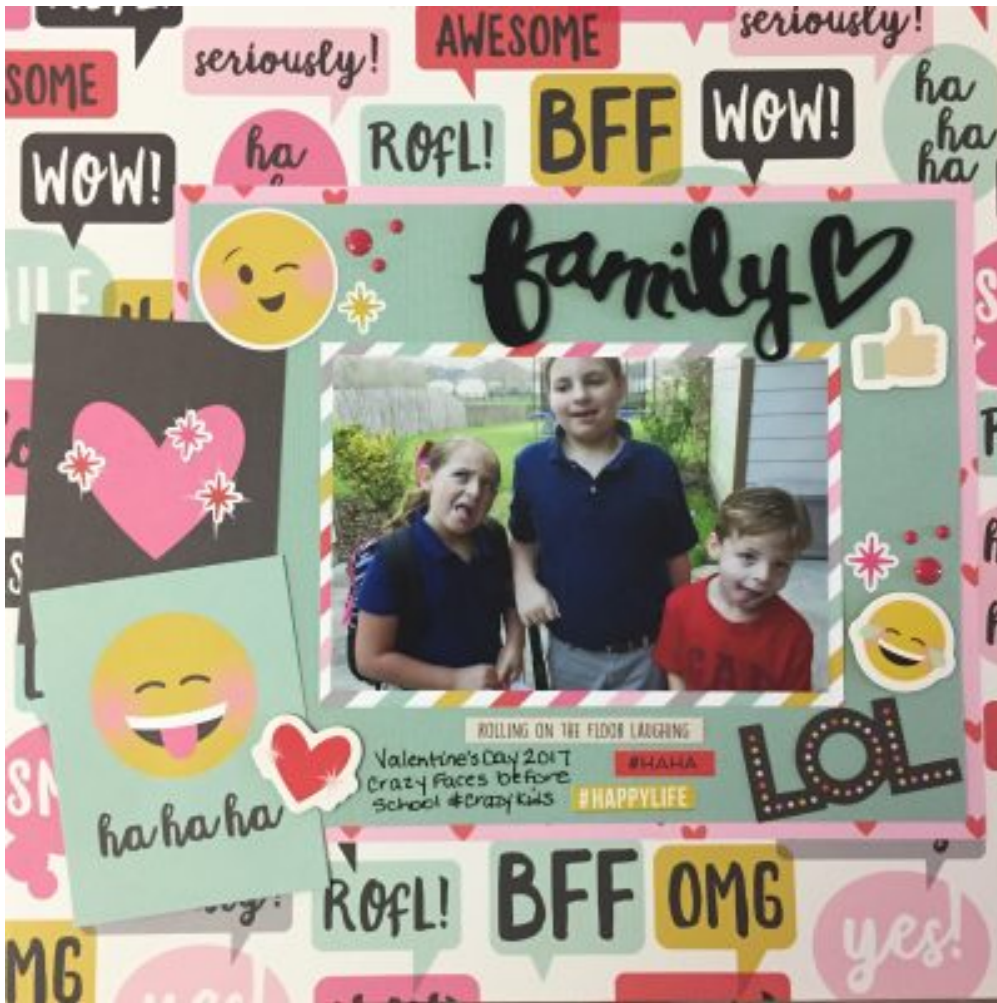
Layout by HillsGirl74