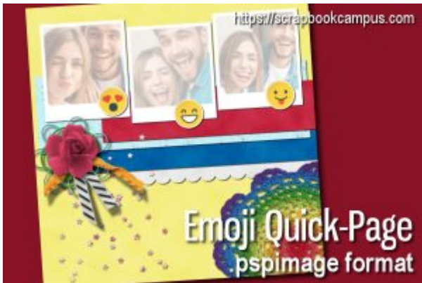
Layout by Rachel

With PaintShop Pro 2020, some tubes that came as part of