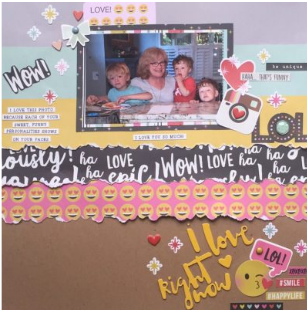
Layout by Dottie