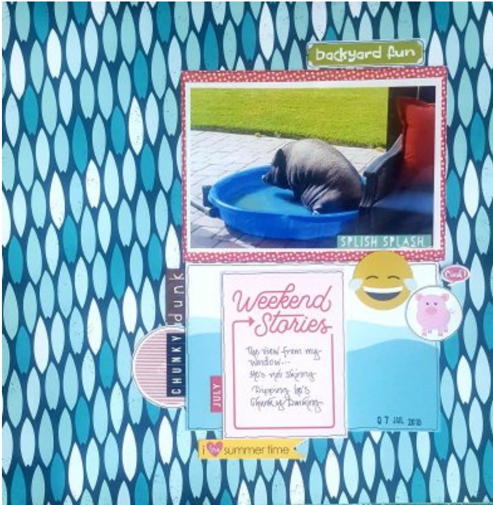
Layout by Doreena