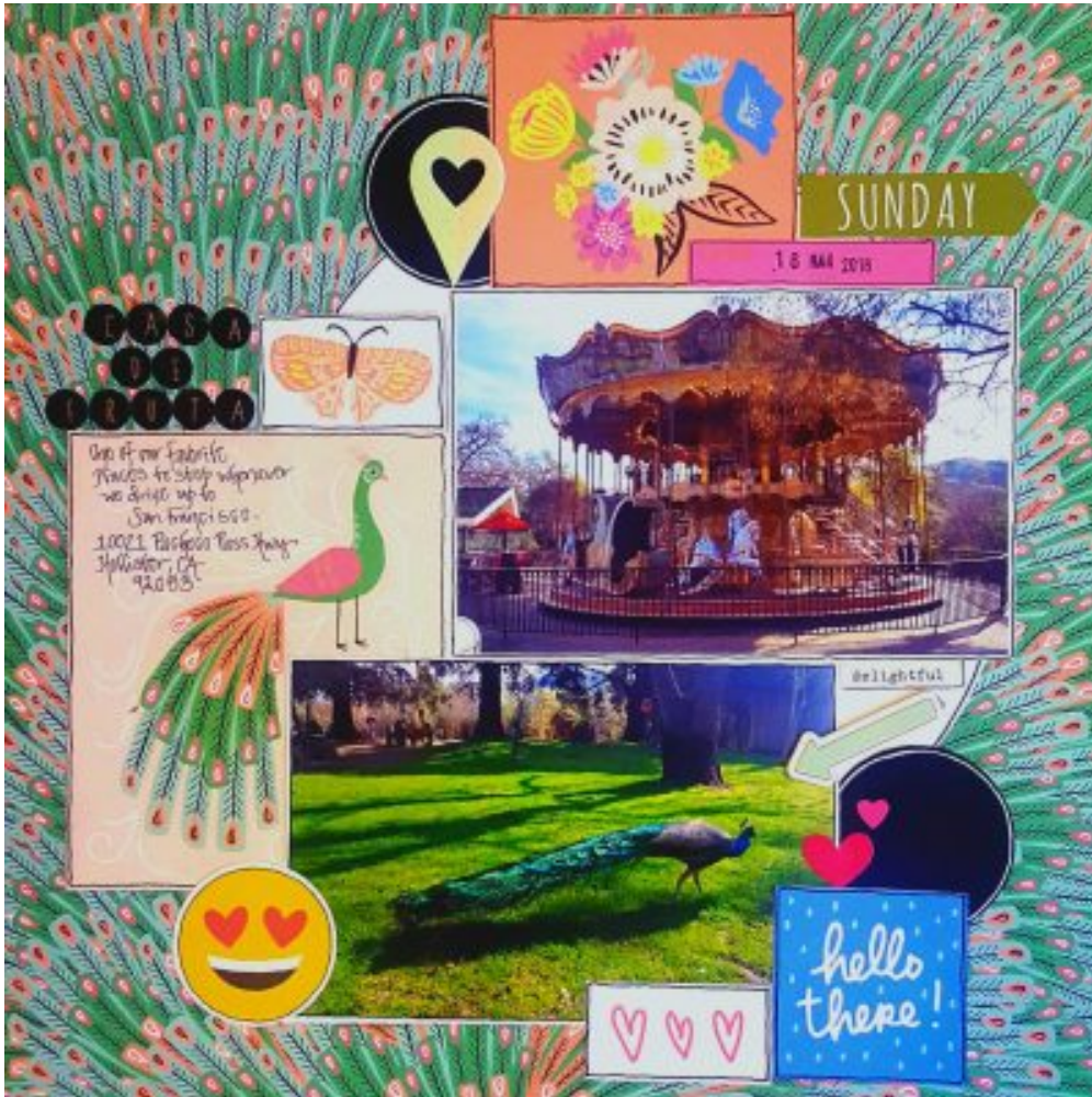
Layout by Doreena