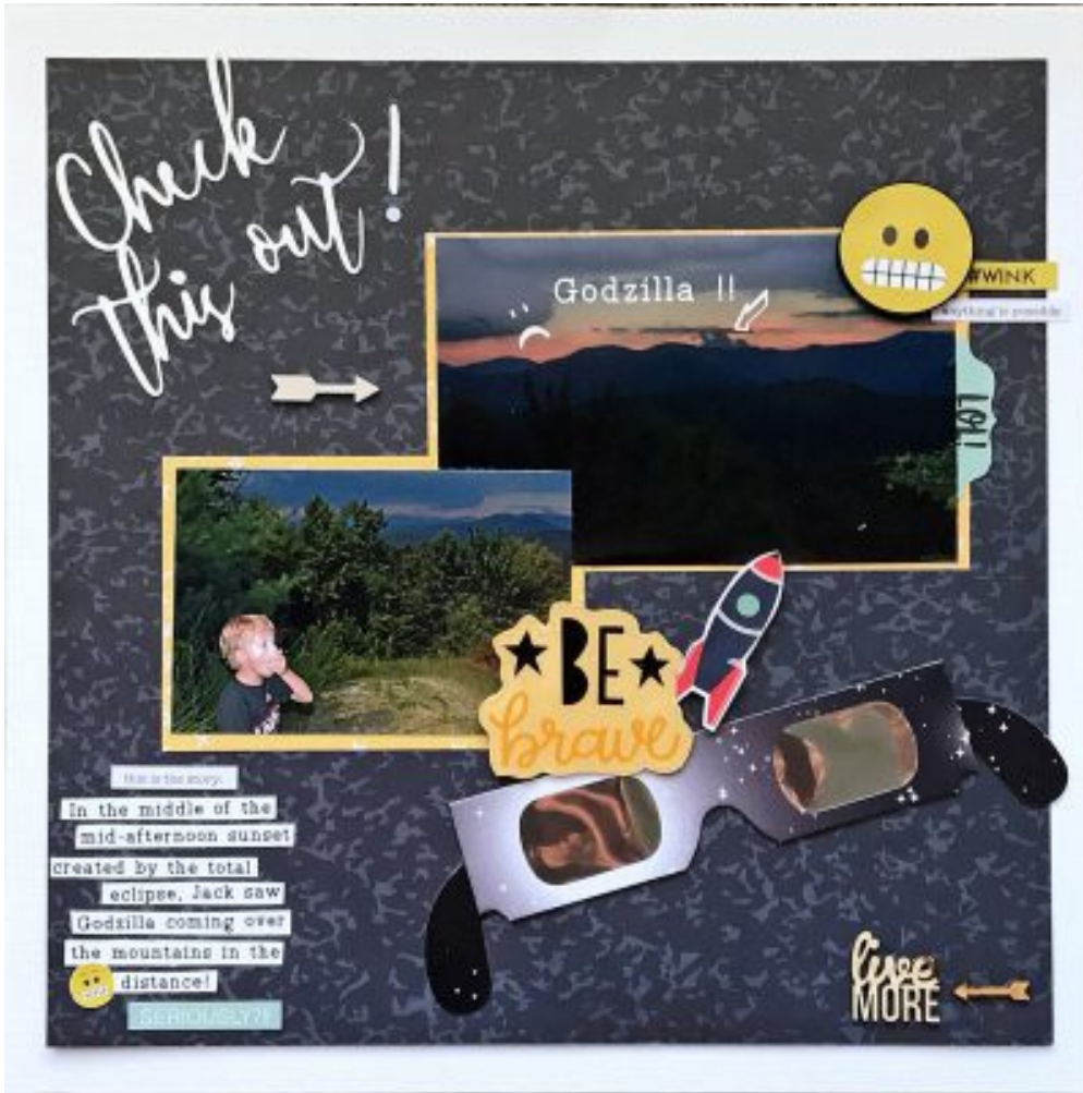
Layout by Dottie