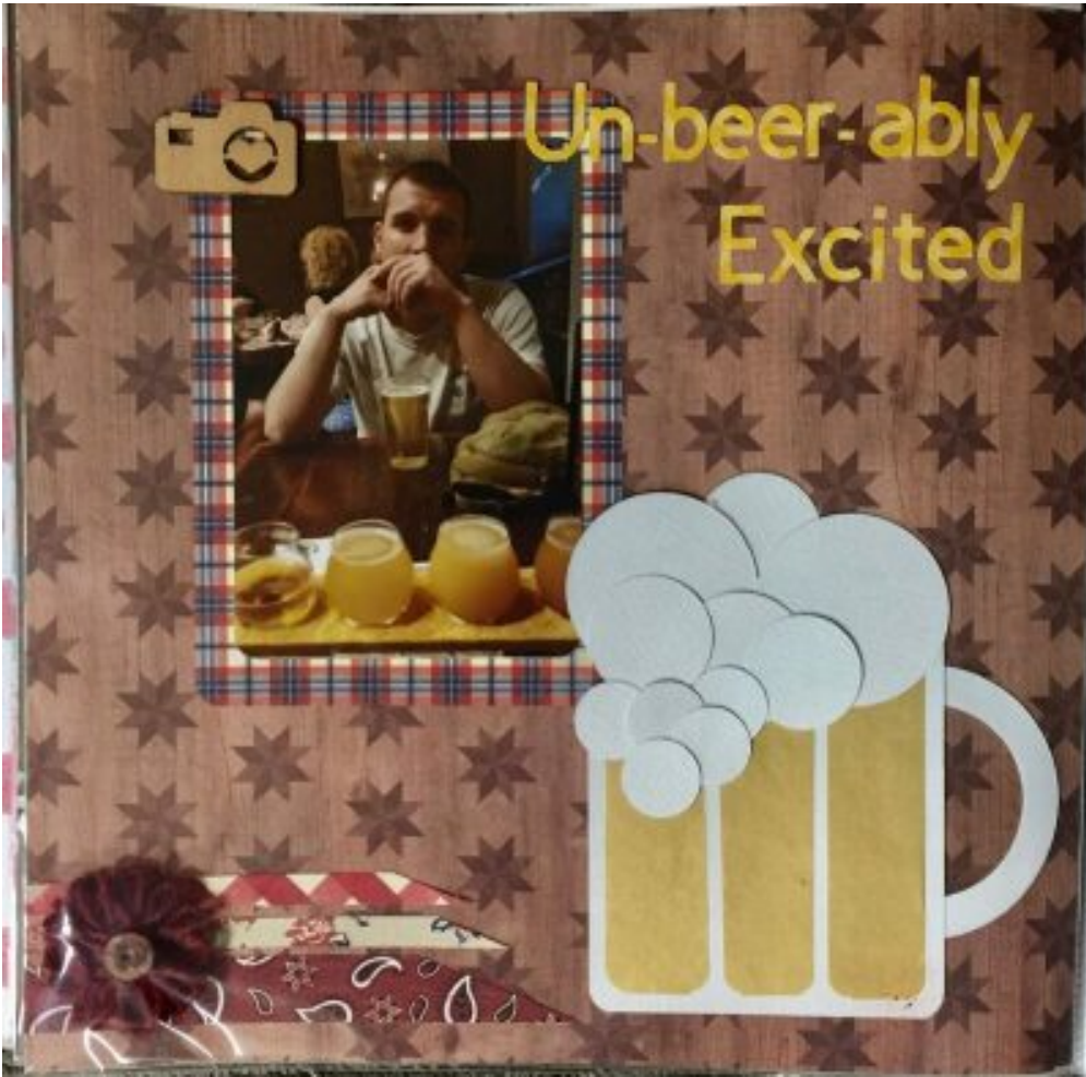
Page by Snappyscrapper23