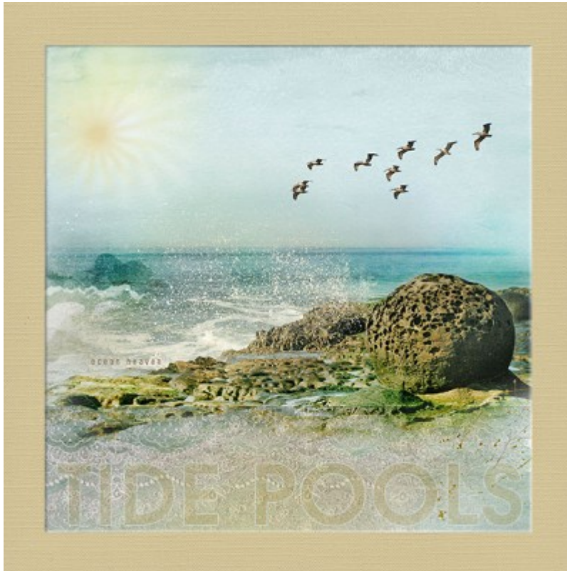
Layout from tylertoo