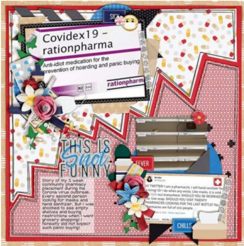
Page by Christelle