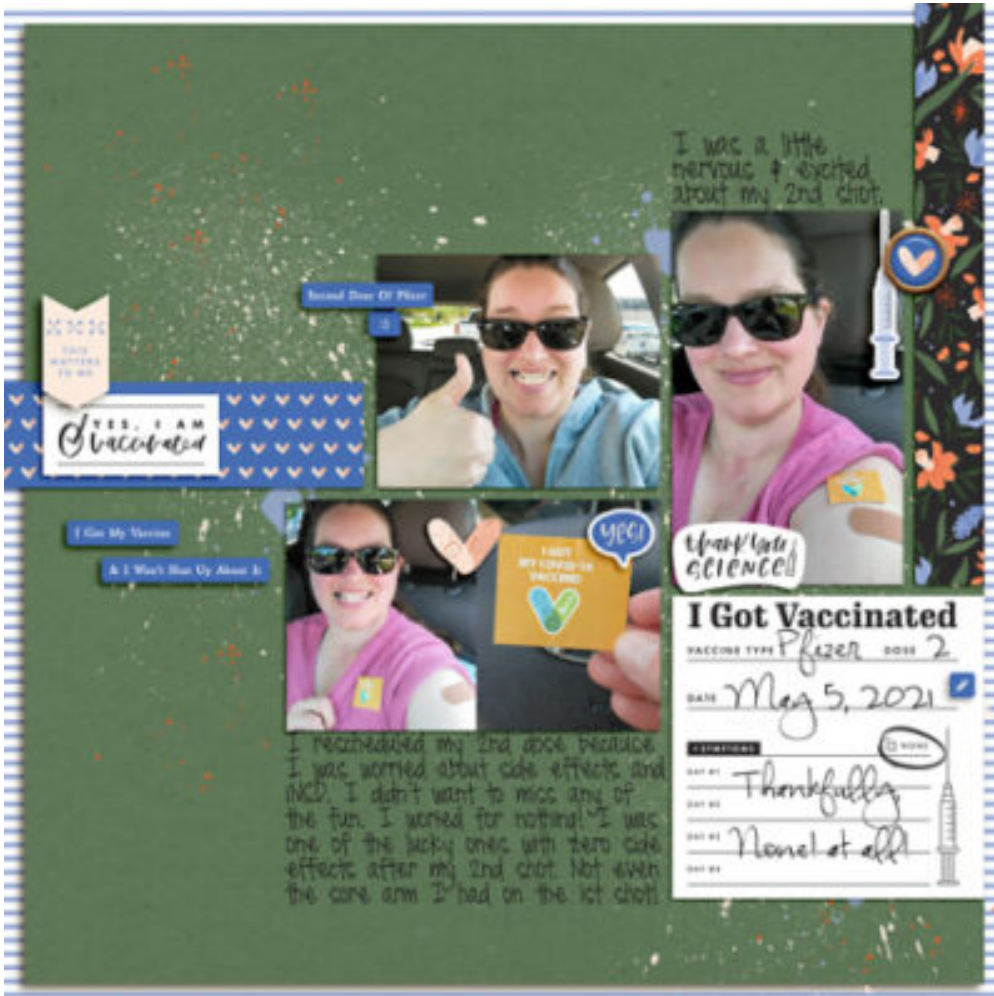
Layout by Courtney