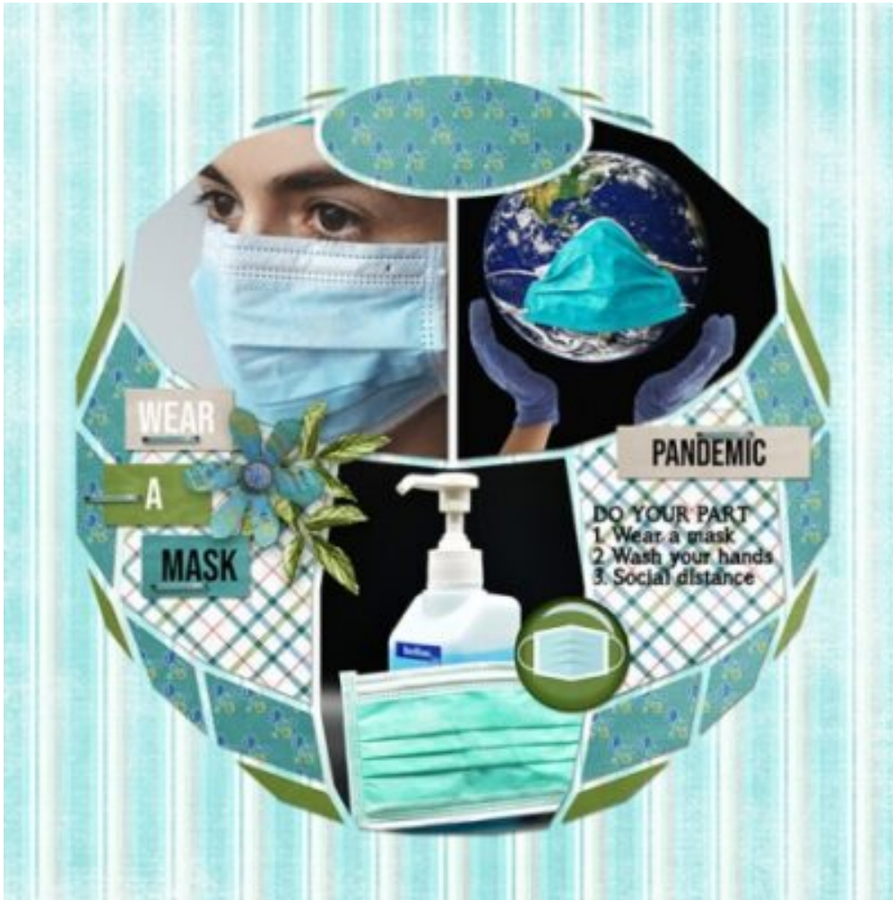
Layout by Joyce