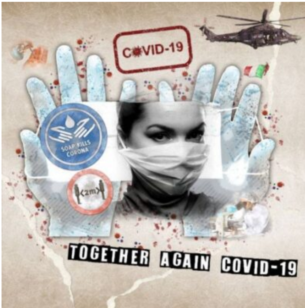
Page by Francine