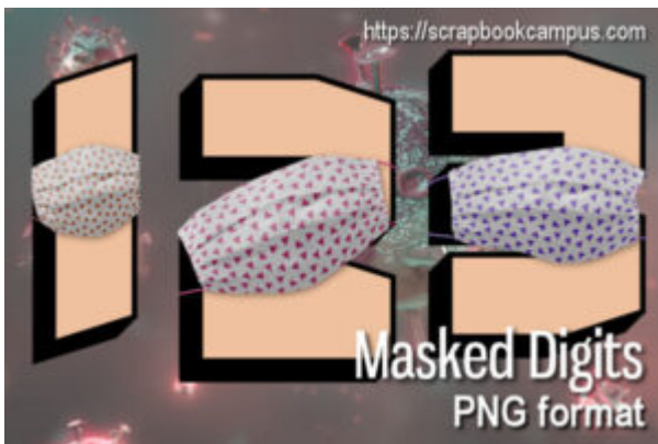
Layout by Linda

Since masks have become the new daily accessory, why