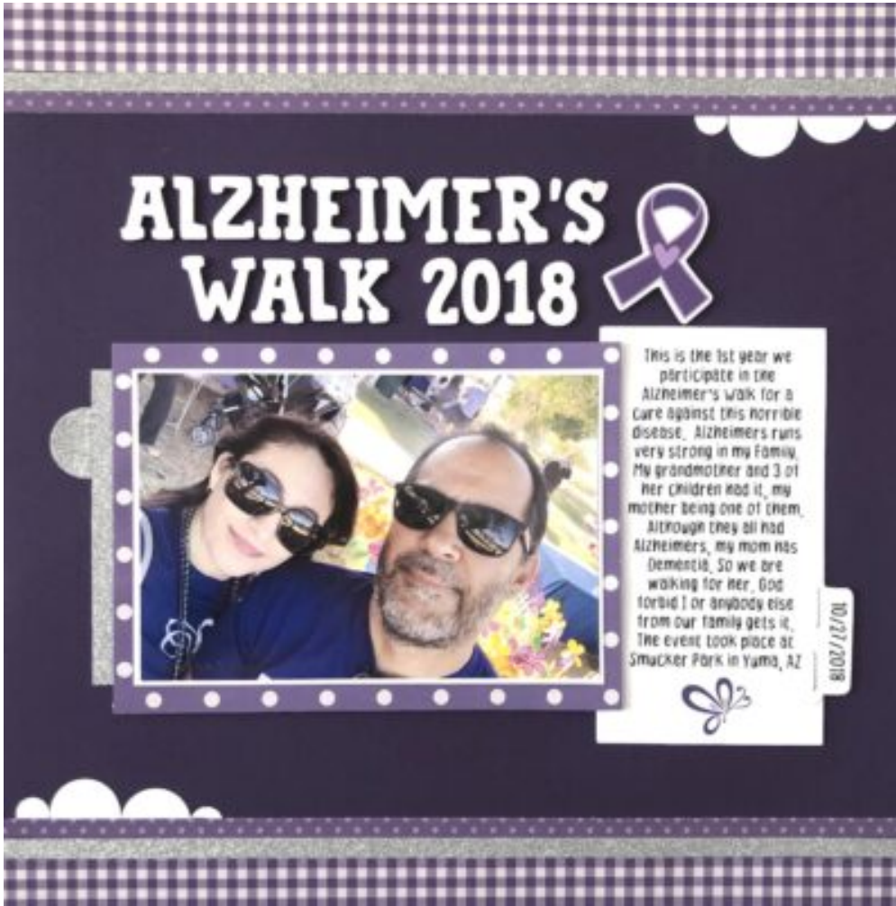
Layout by AngieO