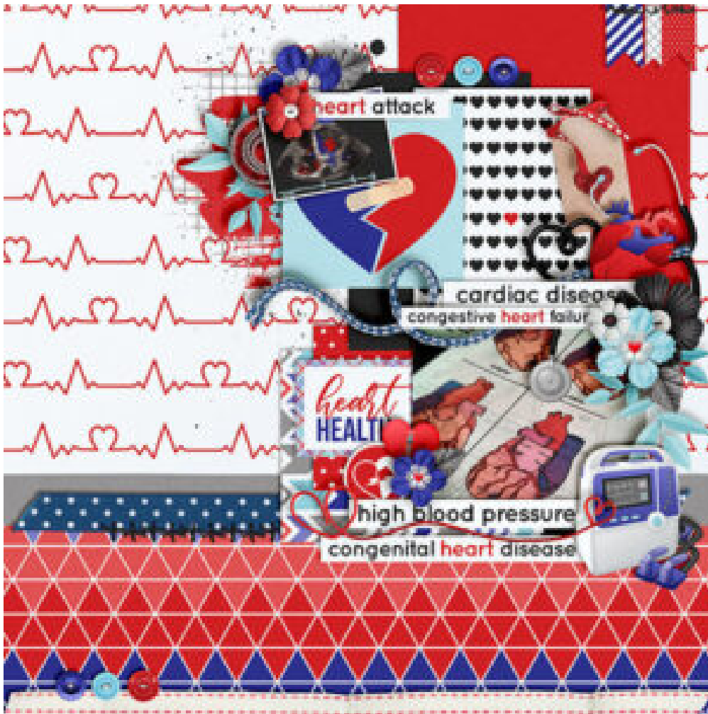
Layout by Christelle