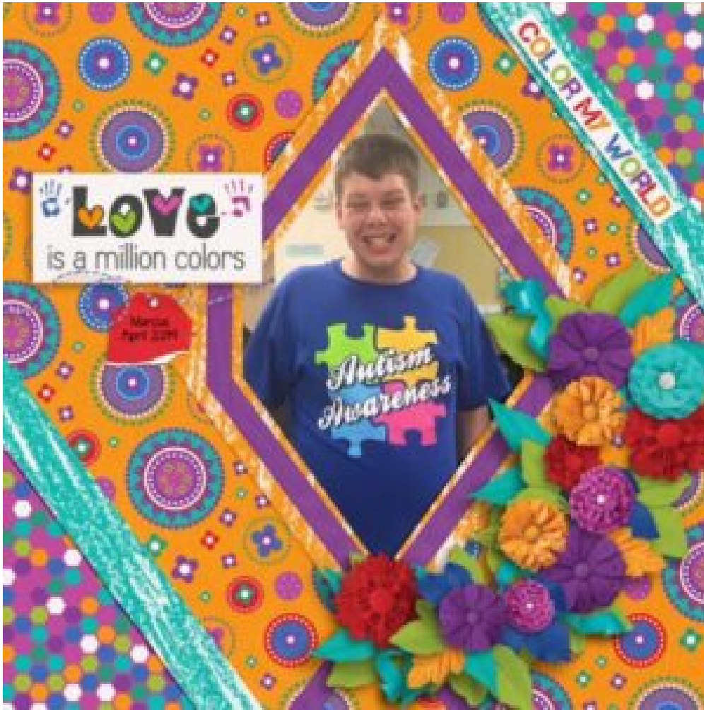
Layout by Dorian