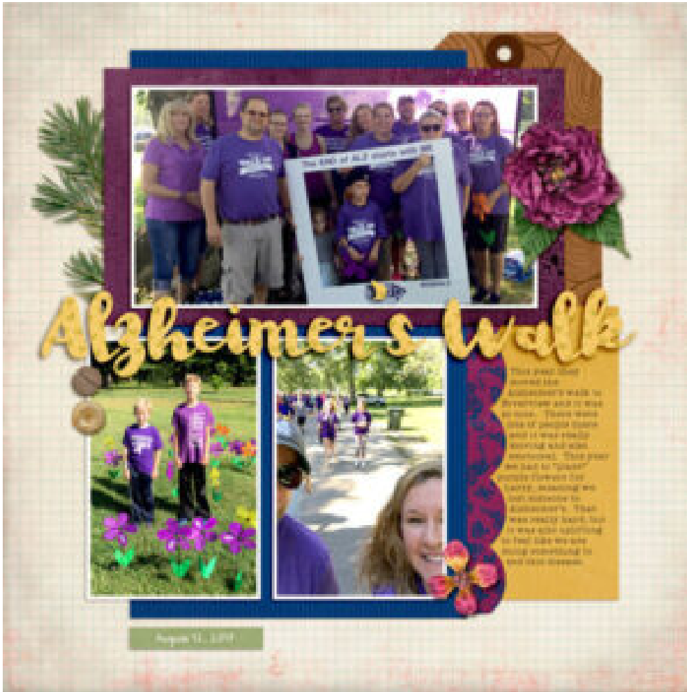
Layout by Karen