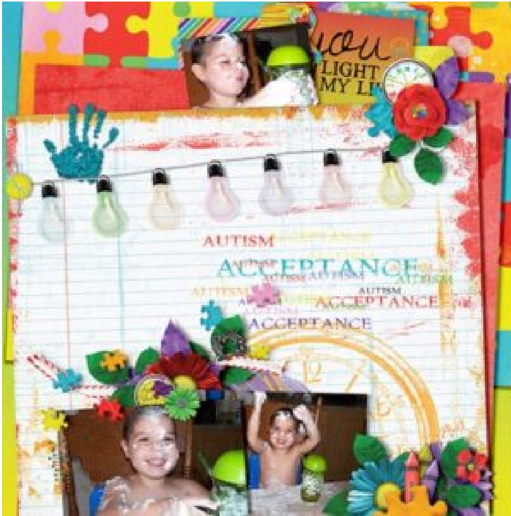
Layout by Michelle