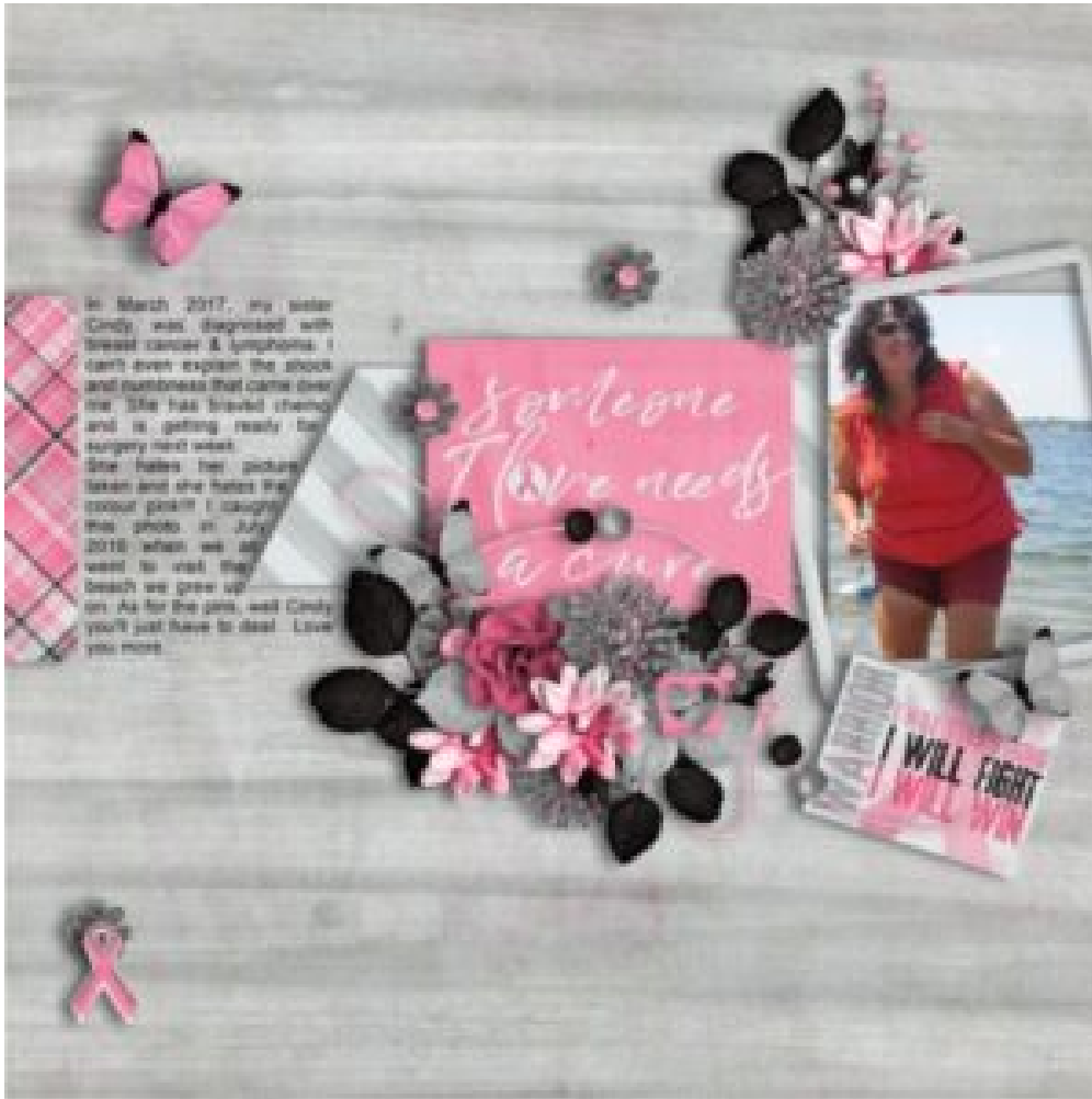
Layout by Ruth