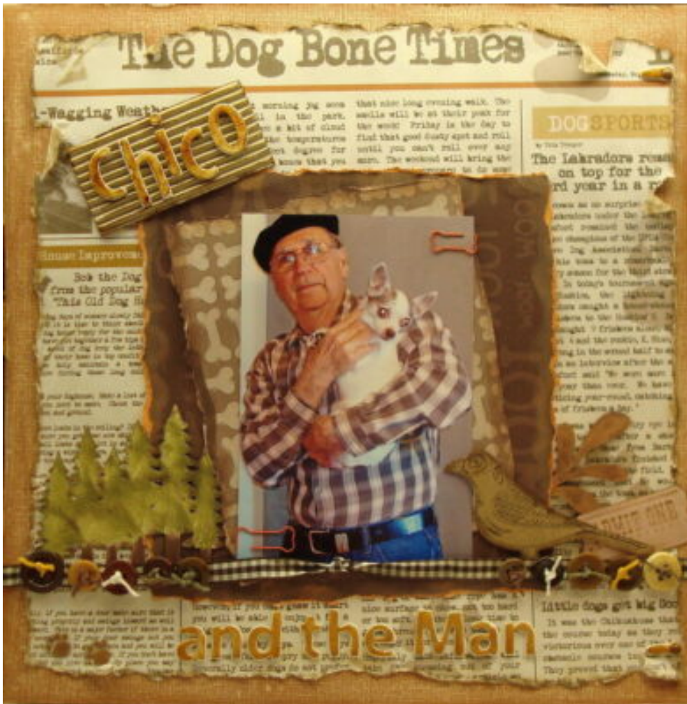
Page by Dnurse