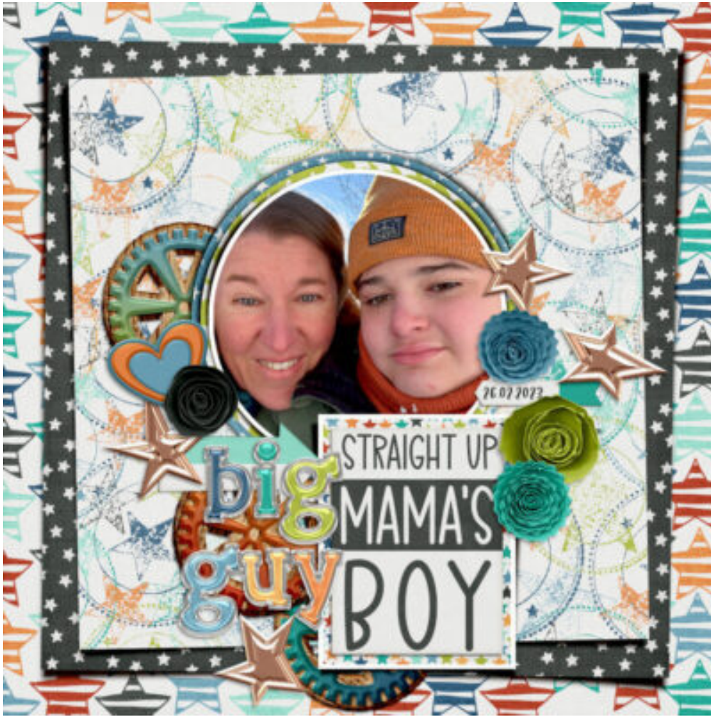
Layout by Mara