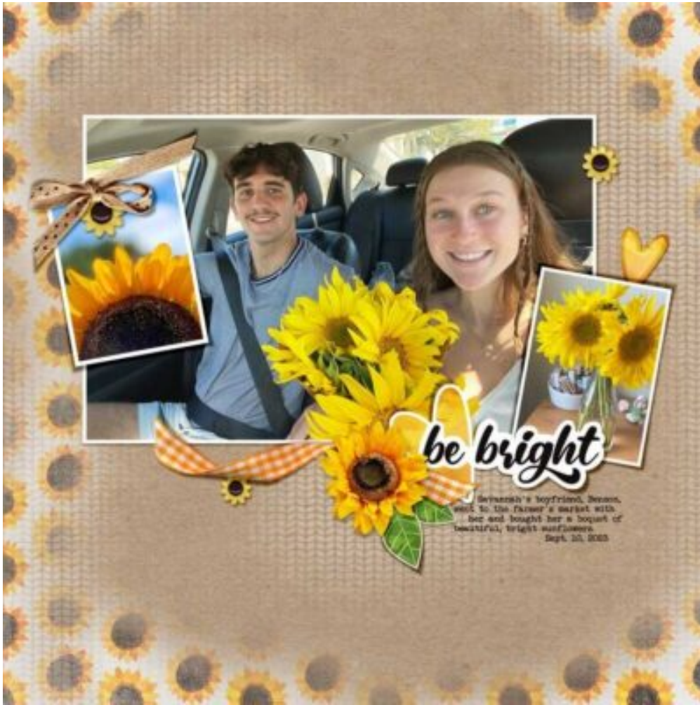
Layout by TiffanyScraps