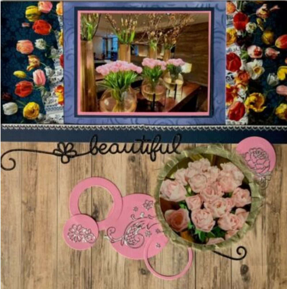
Layout by Lis