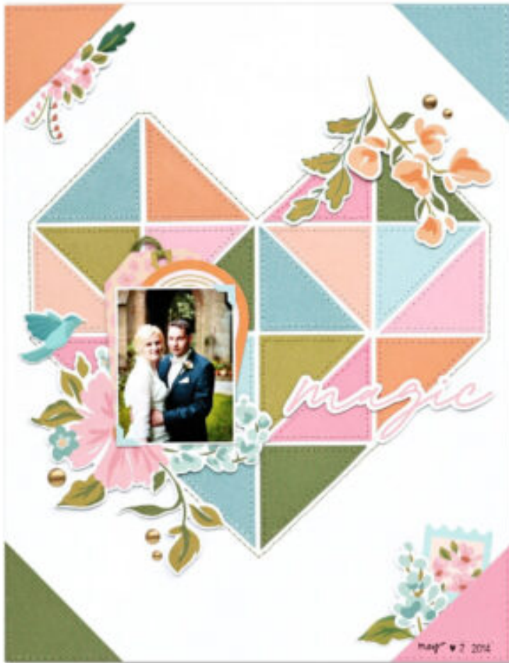
Layout by Evelyn