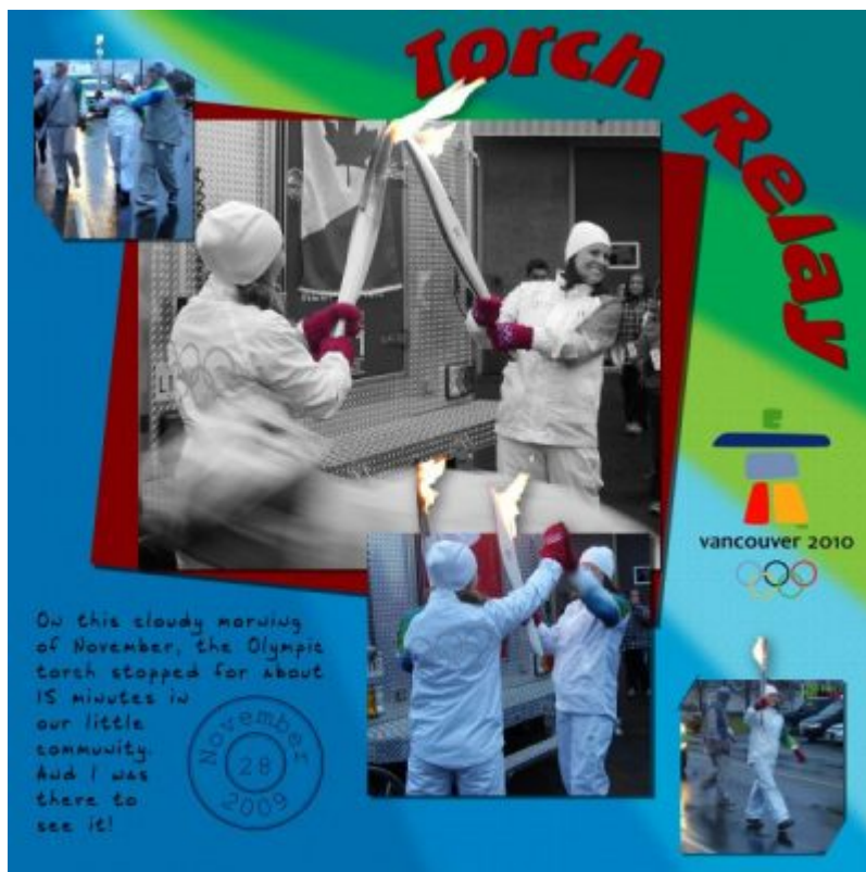
A descriptive title