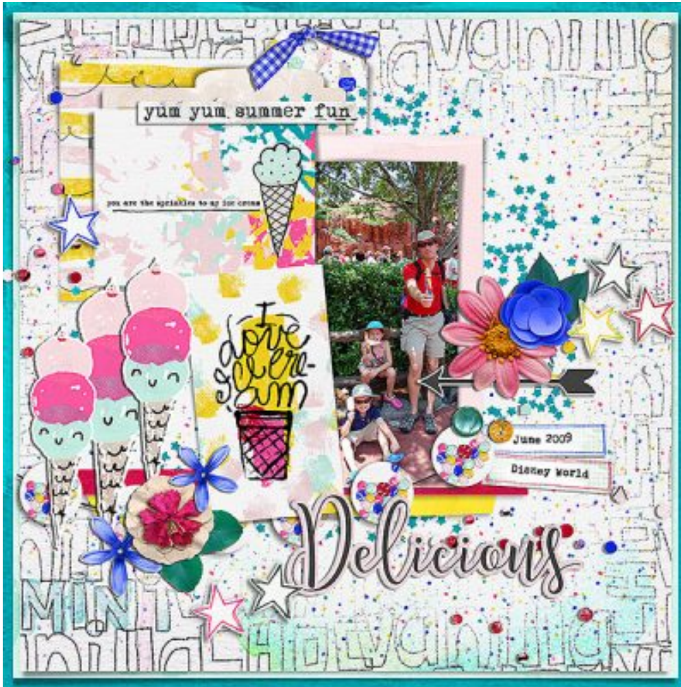
Layout by Chigirl