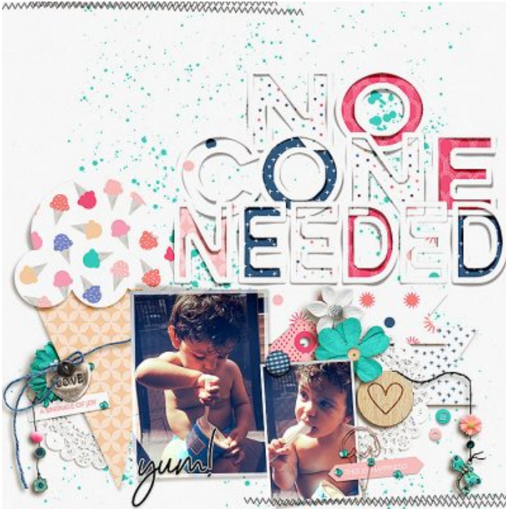
Layout by Mary