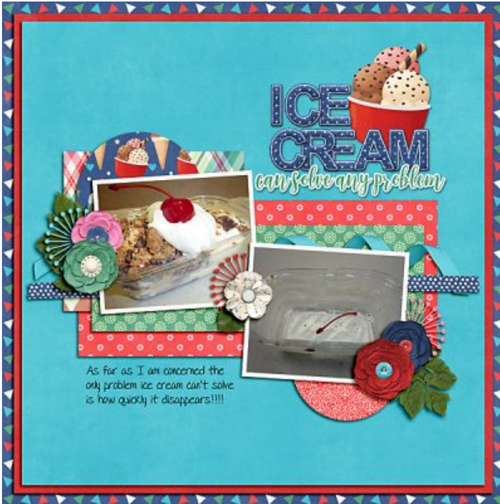
Layout by Tomosia