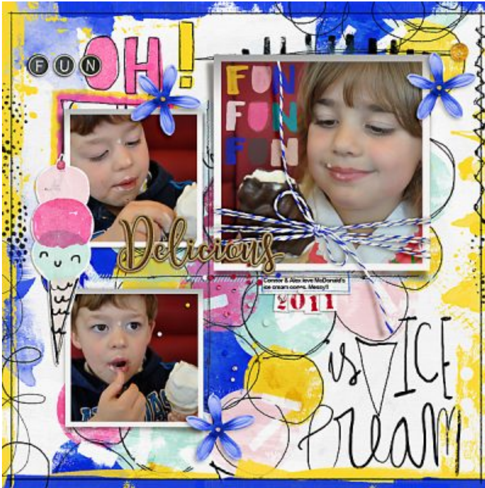
Layout by lowan@Heart