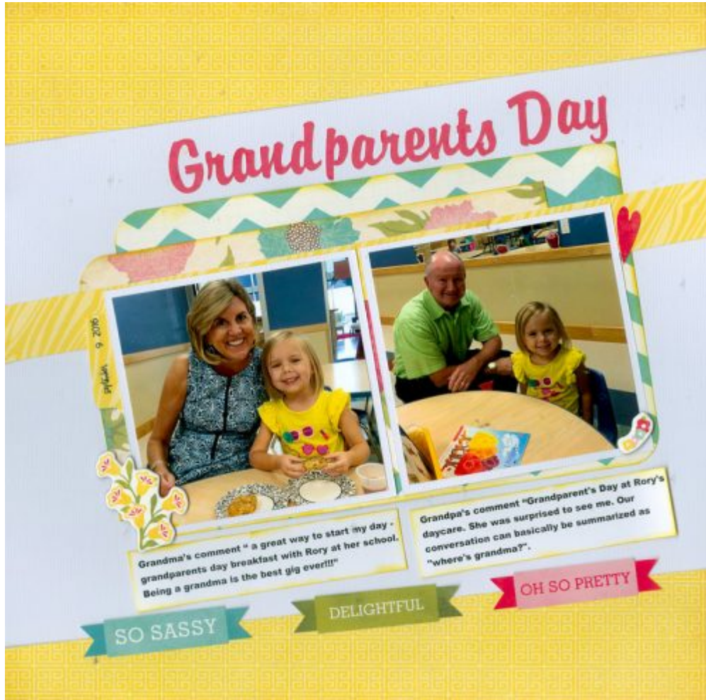
Layout by Pam