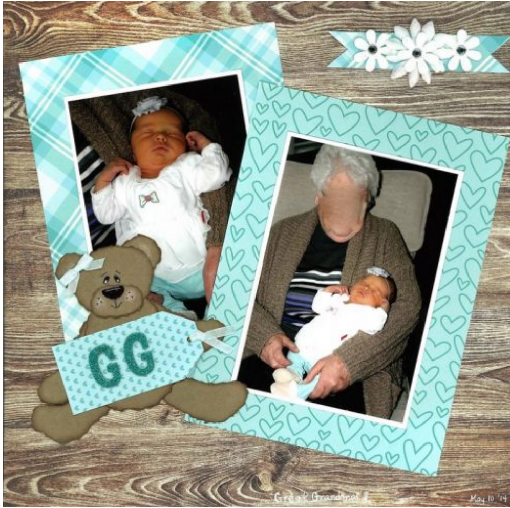
Layout by Judy