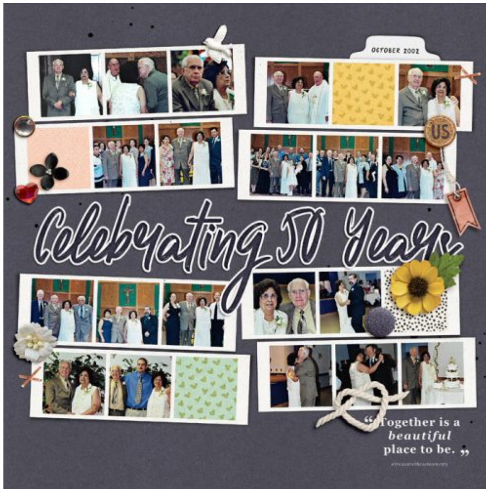
Layout by Carrie