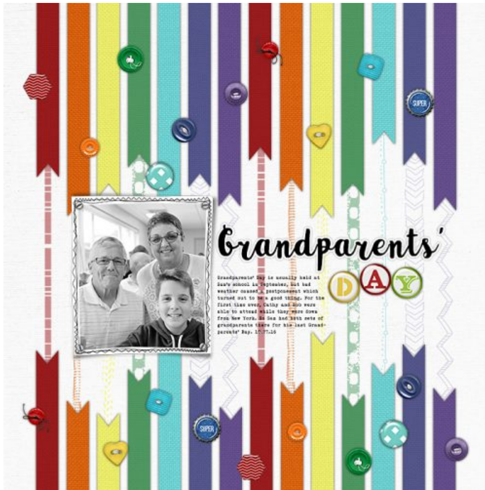
Layout by Linda