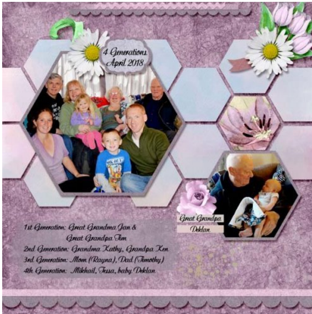
Layout by Kathy