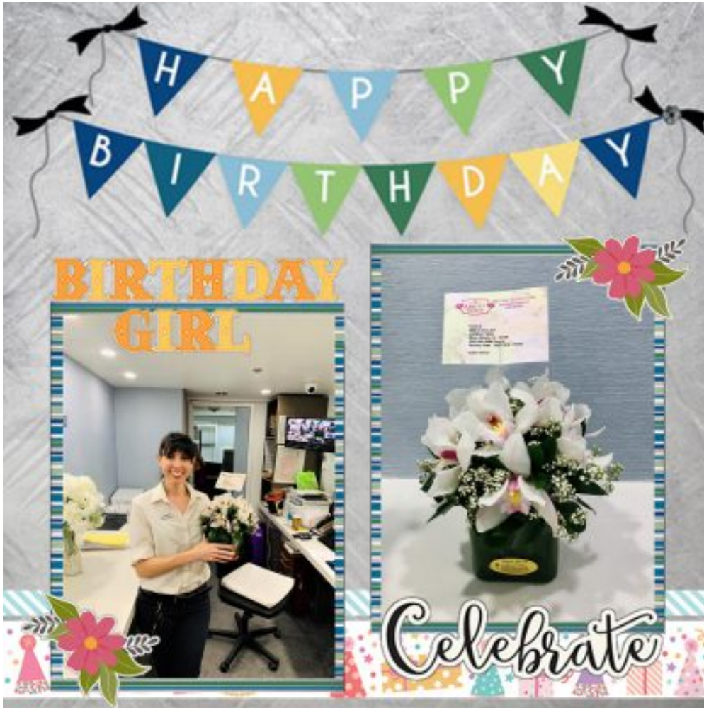
Layout by Ana