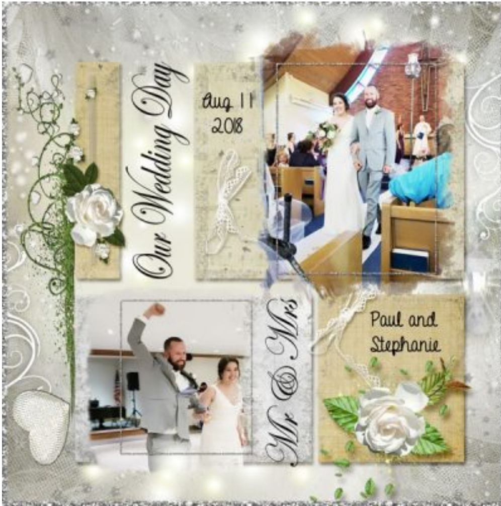
Layout by Kathy