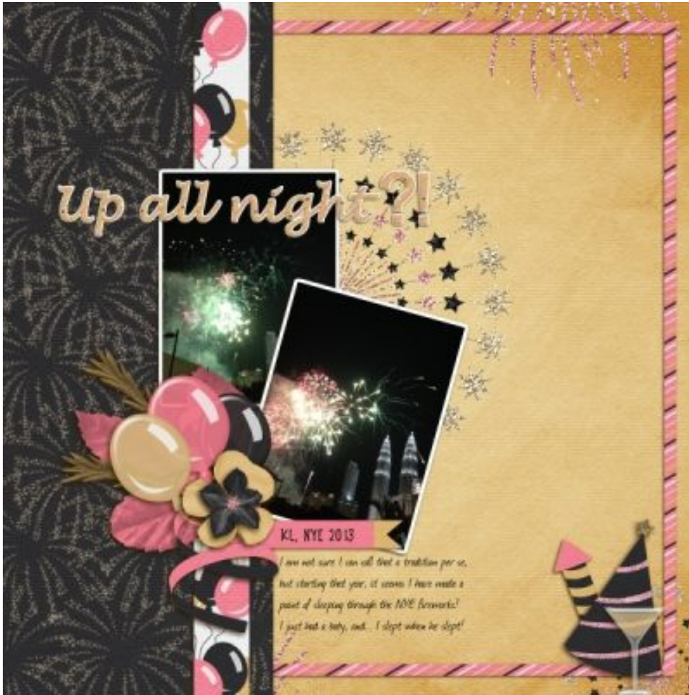
Layout by Lou