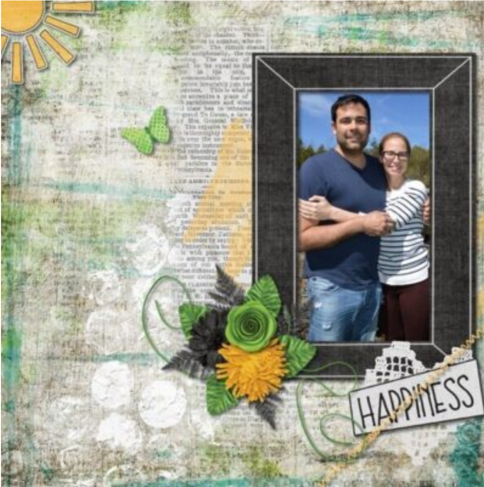
Layout by Maureen